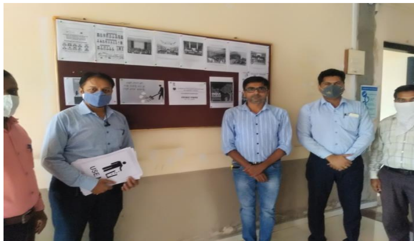
Displayed Swachhta posters on Notice Boards