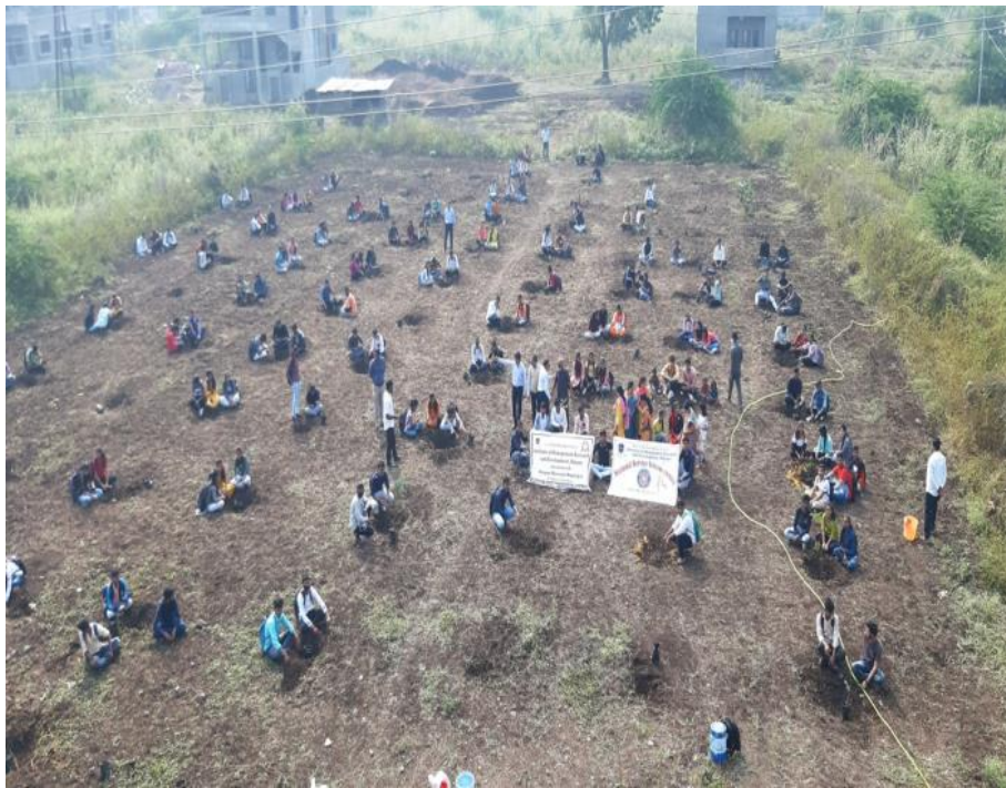
Participation of NSS Volunteers and students in Tree Plantation Drive