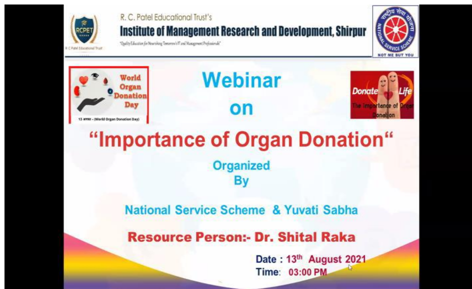
Power Point Presentation on Importance of Organ Donation