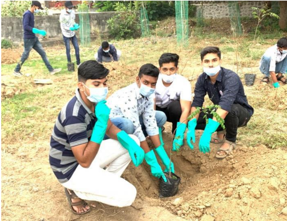
Tree Plantation Drive near Arunavati River