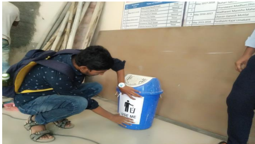
Students' participation in pasting posters at various location of Institute