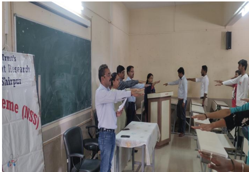
Pledge of Unity by Institute's Staff and Students