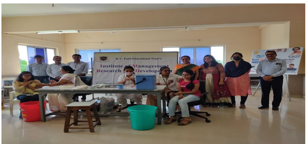
Student's active participation in Vaccination Drive