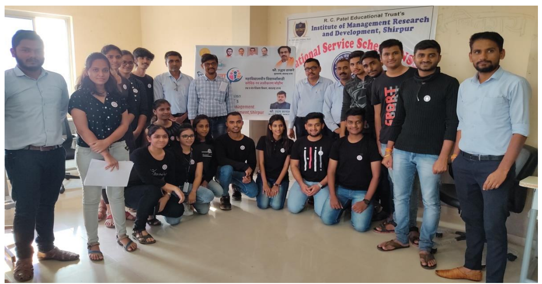
NSS Volunteers active participation in Vaccination Drive