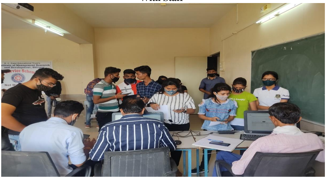
Student's active participation in Vaccination Drive