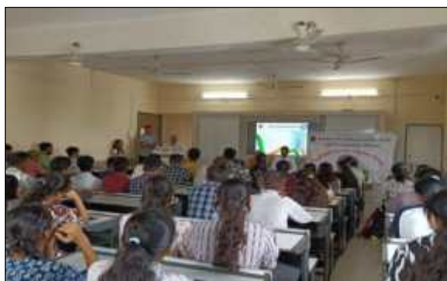
Students and faculty members participating in the National Unity Day Celebration