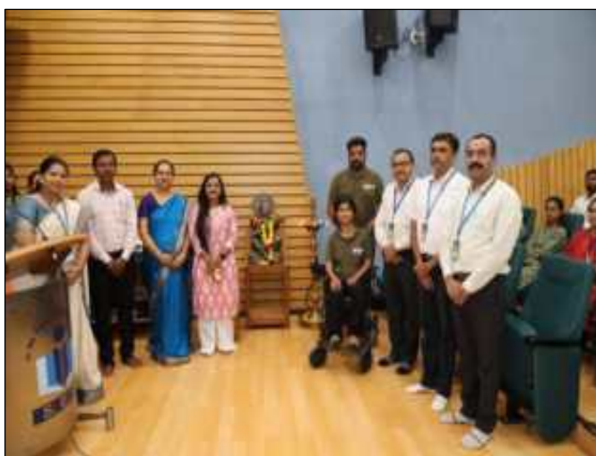
The program begins with Saraswati Pujan and Deep Prajwalan by the dignitaries