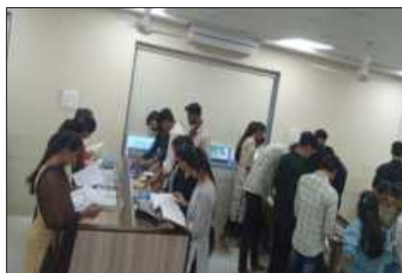
Glimpses of Book Exhibition 2025-26