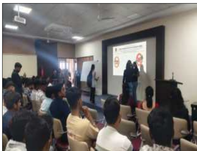
Students performing an Anti-Ragging and Women Harassment Awareness Act