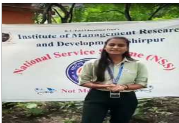
Short video on cleanliness prepared and released by NSS volunteers