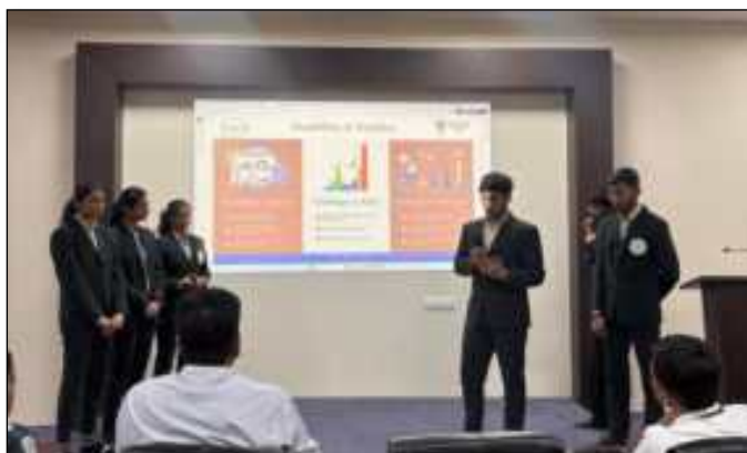
Students presenting innovative solutions during the Internal Smart India Hackathon (SIH) evaluation