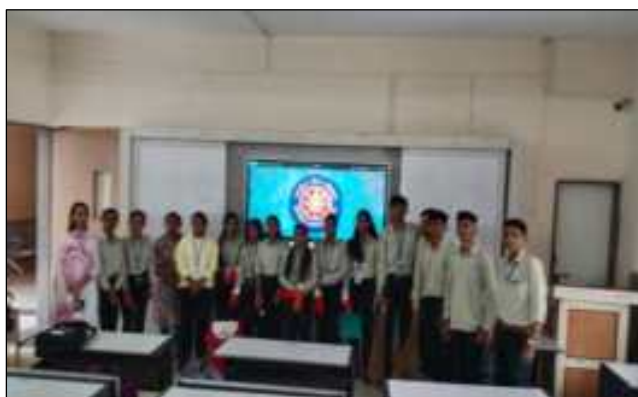
The event reflected commitment to Swachh Bharat Abhiyan