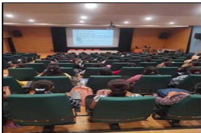
Students attending the Library Orientation Program session