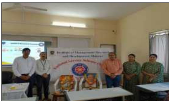
Esteemed dignitaries and faculty members present at the National Unity Day Celebration