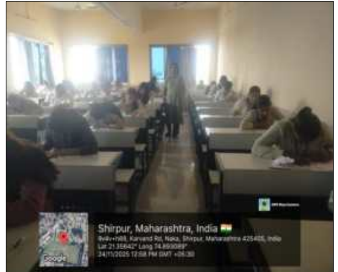
Students enthusiastically attending the Indian Culture Knowledge Examination