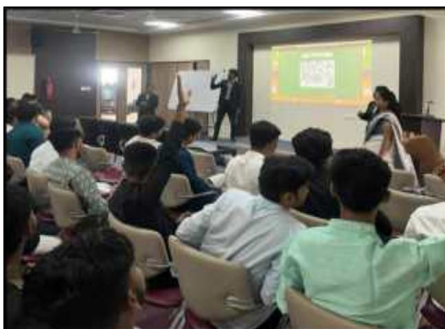
Students enjoying Creative Activities