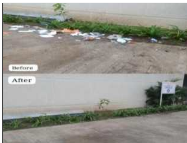
Campus Premises after Completion of the Cleanliness Drive