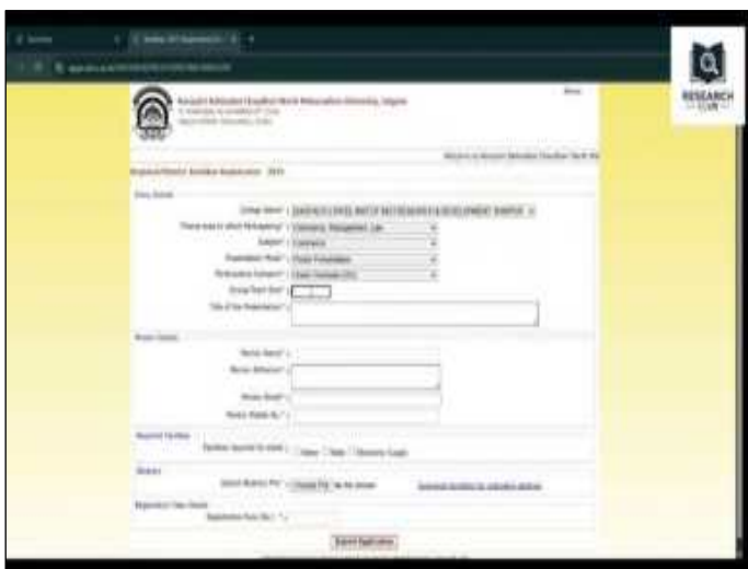
Aavishkar Registration Guidance: On YouTube