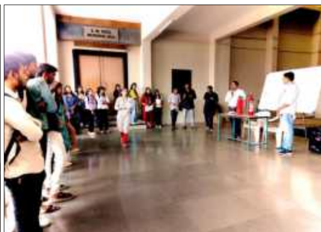
Student during Demonstration on Fire and Safety