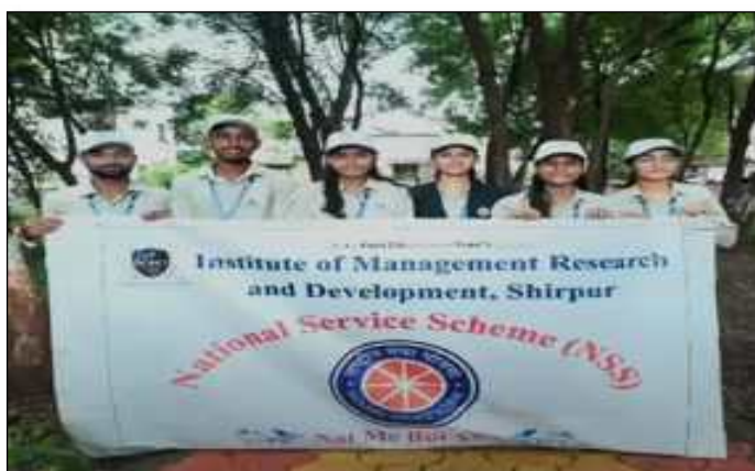
NSS Volunteers spreading awareness on cleanliness among students and society