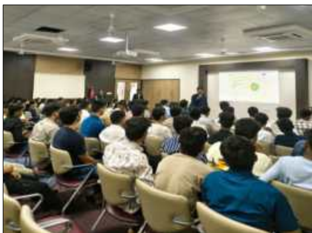
Warm welcome to our new students by Induction Team

Outcome: Strengthening of teamwork, creativity, and assessment of current abilities, rounding off the week with cultural integration.