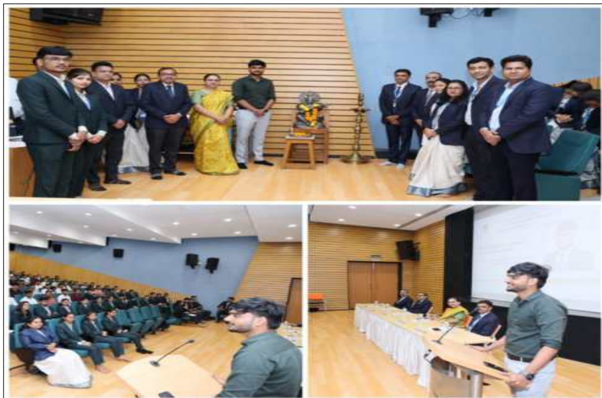
Glimpses of BCA Induction Program – Valedictory Session 2025

The event concluded with a vote of thanks acknowledging the contribution of all faculty members, non-teaching staff, and the enthusiastic support of second- and third-year student volunteers who played an instrumental role in making the program a grand success.