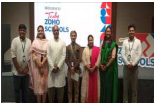
With the Outreach team of Zoho