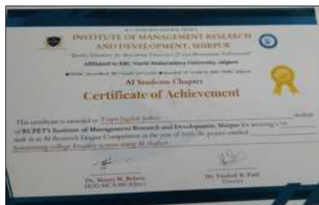
First Rank winners – AI Research League.