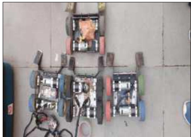
Glimpses of Robo Soccer – TENET