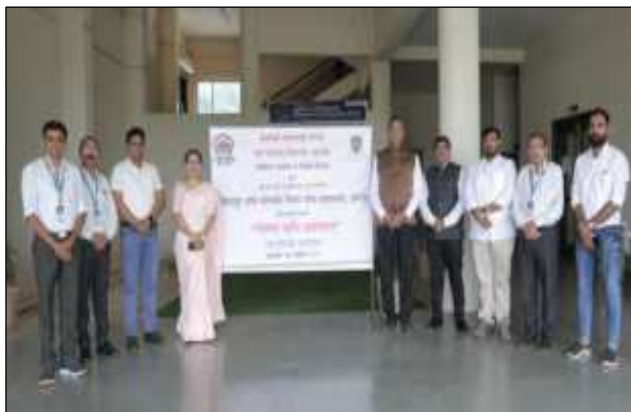
Distinguished guests and resource persons gracing the event with their esteemed presence