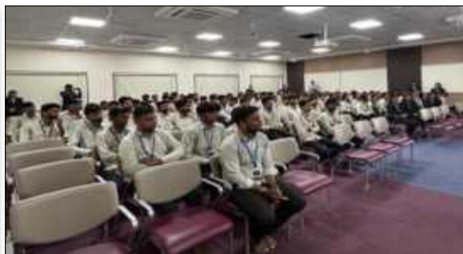
All participated students from second year BBA, BMS and Third Year BBA and BMS