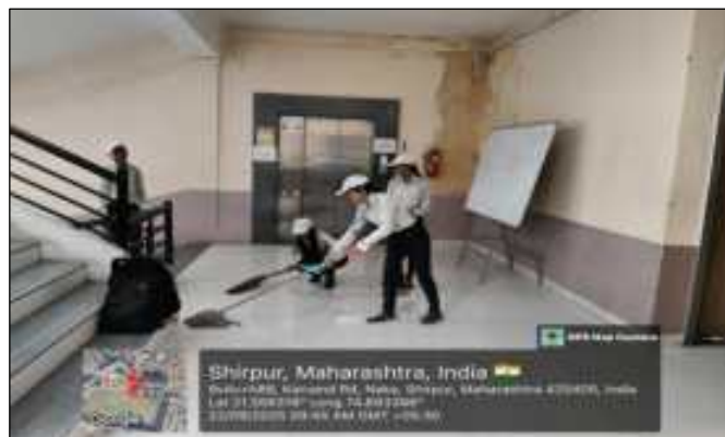
NSS volunteers enthusiastically participated in the campus cleanliness drive