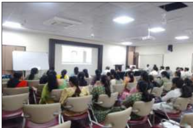
Awareness Session on “Psychometric Test”