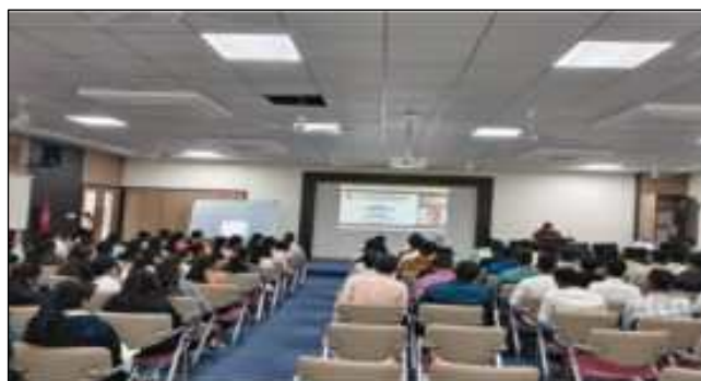
Psychology Workshop on Motivation, Depression, Anxiety & Addiction – nurturing mental wellness and self-awareness