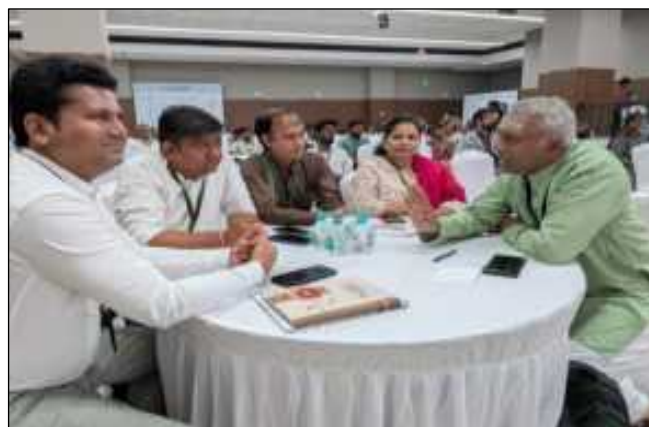
Discussion with Zoho outreach team