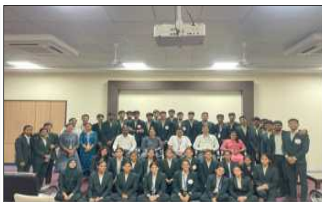
Group photograph of participants with the coordinators of Internal SIH 2025