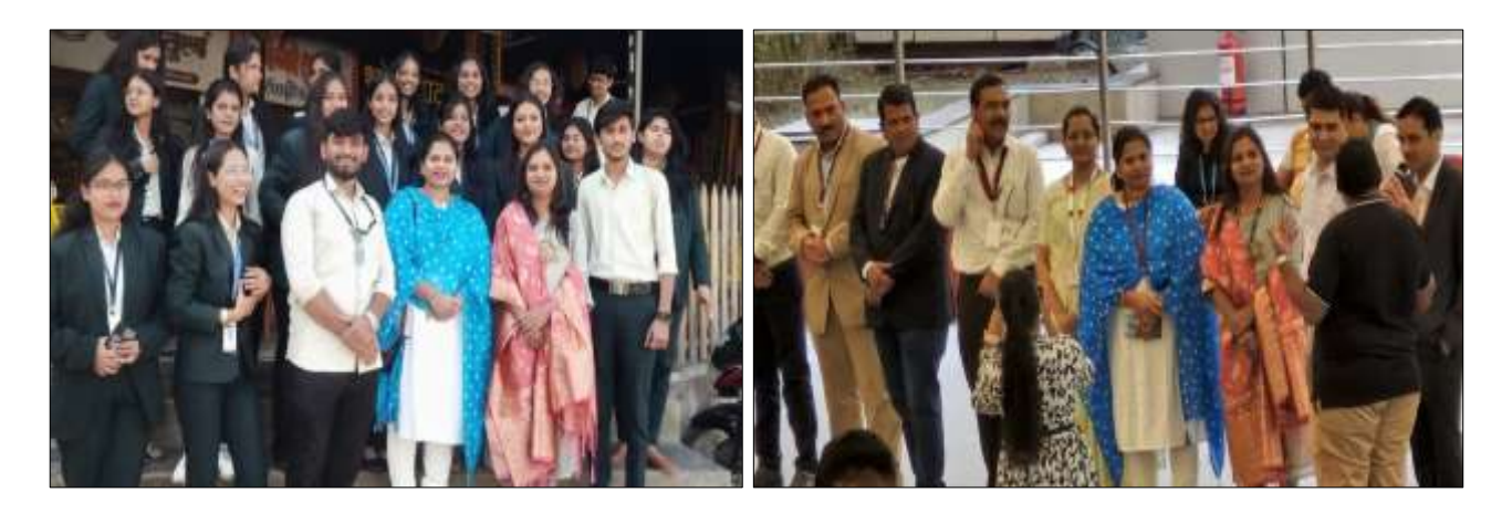
Geared Up for an Insightful Industry Visit

Post the industrial visit; students explored Prati Shirdi and Dehugaon, where they experienced cultural landmarks, making the trip both educational and enjoyable. The visit proved to be a valuable learning experience, helping students gain clarity about industry expectations, boosting their confidence, and motivating them to align their academic skills with future career goals. The Training and Placement Cell extends heartfelt gratitude to the Infosys Pune team for their exceptional support and hospitality.