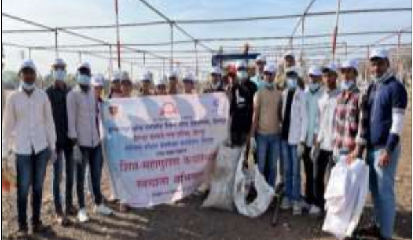
"Swachhata Hi Seva" – Volunteers were provided with cleaning essentials, including brooms, dustpans, and gloves.