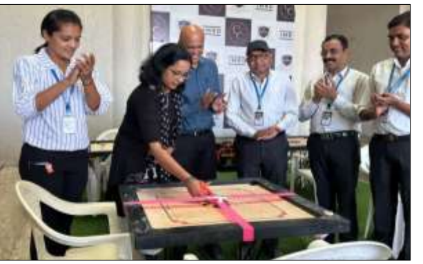
Intramural Carrom and Chess Competition Inaugurated by Chief Guest