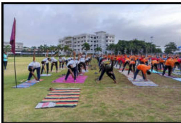
Students and NSS Volunteers performing Yoga