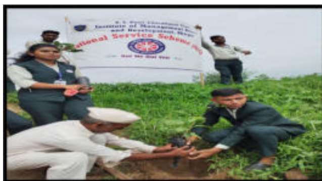
Tree Plantation by a local villager at residential and open area.