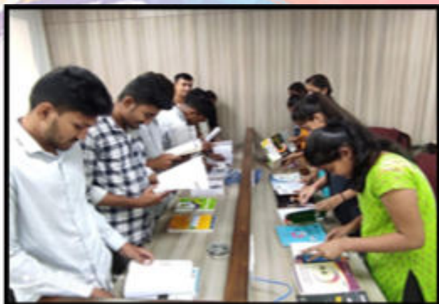
First year students visiting Book Exhibition