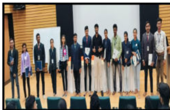
Session on Grooming