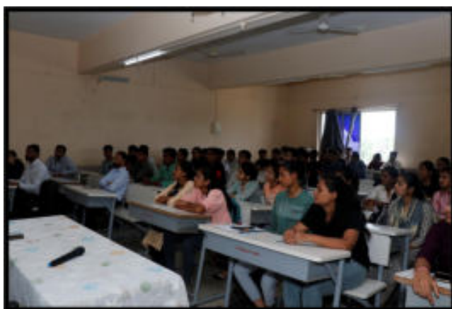
Expert Talk on occasion of International Day of Indigenous People