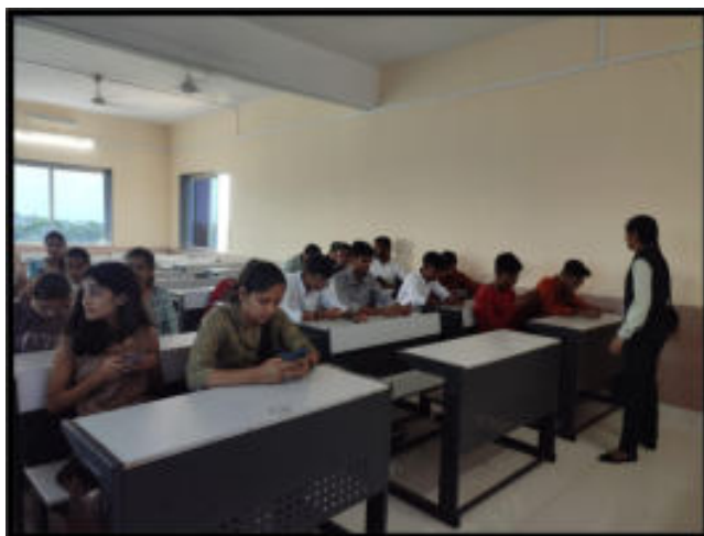
Students are engaged in attempting Entrepreneurship Development E- Quiz