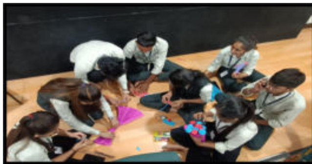
Students Activities in Training