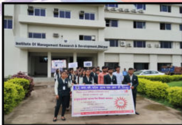
HIV/AIDS awareness rally that saw enthusiastic participation from students and staff members