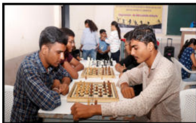
Boys Students Participated in the Chess Competition