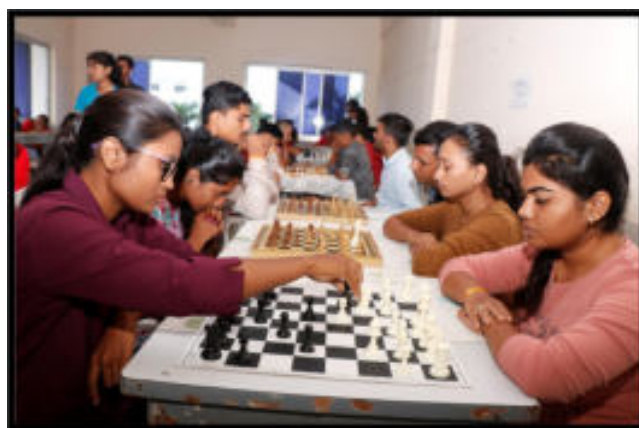
Girls Students Participated in the Chess Competition