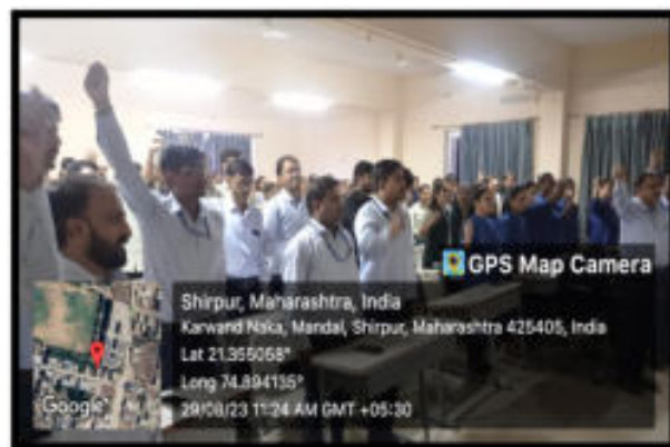
Grand salute to ISRO for successful mission of Chandrayaan-3