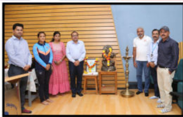
Lightning of lamp by the Dignitaries