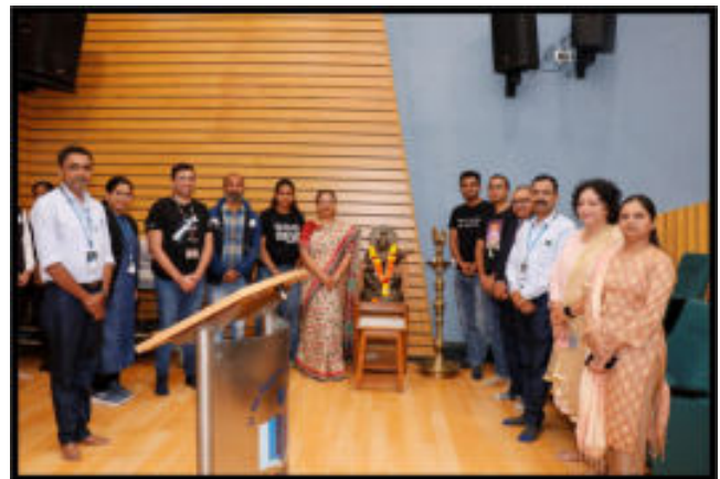
Inauguration of Placement Drive by dignitaries.