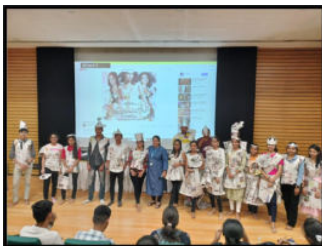
Creativity Enhancement by Students