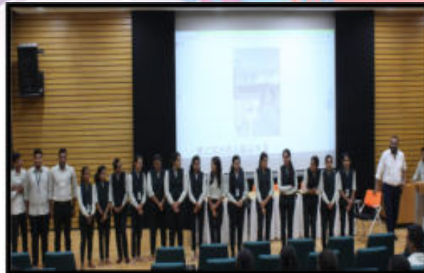
Student's participation in Activity.