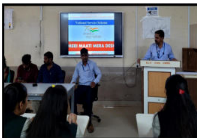
NSS volunteers attend seminar on Meri Mitti Mera Desh