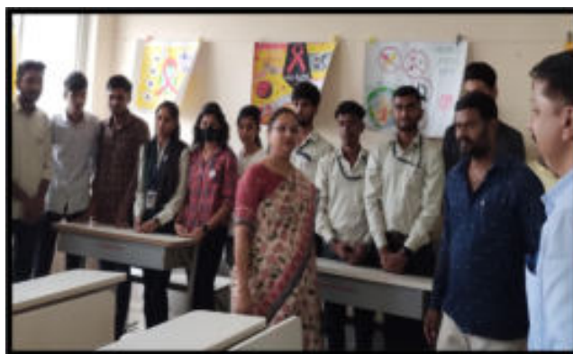
Students from various departments presented visually engaging posters that conveyed vital information about HIV/AIDS