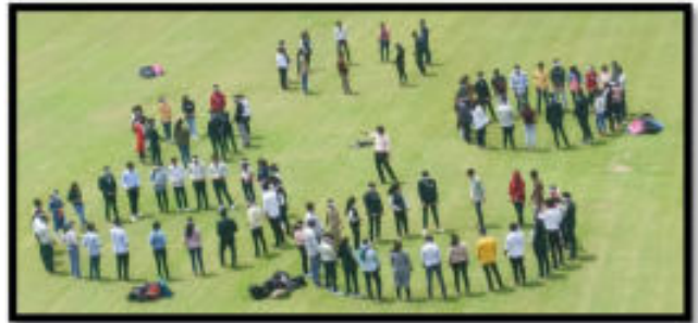
Team buiding activity for students