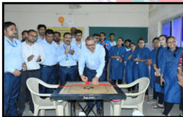
Inauguration of Intramural Carrom Competition by Chief Guest