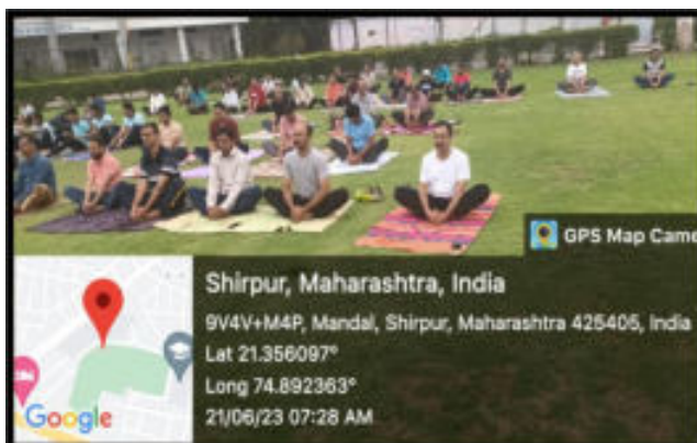
Staff members doing Asanas during the session