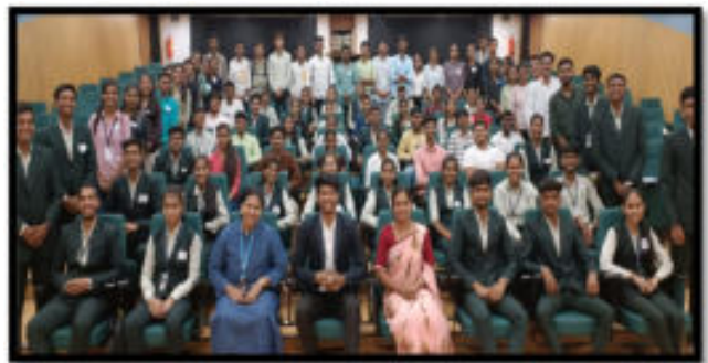
First and Second year BMS Students participated in the Training