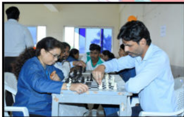
Staff Participated in the Chess Competition