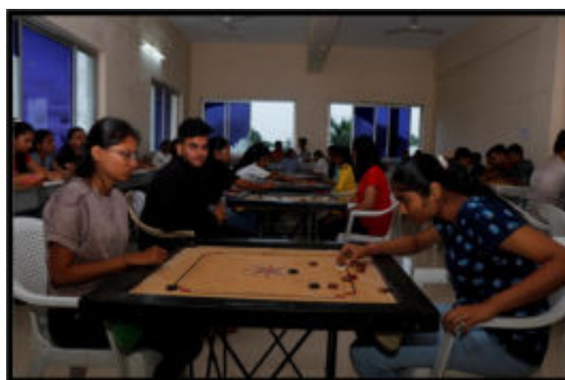
Students participated in the Carrom Competition