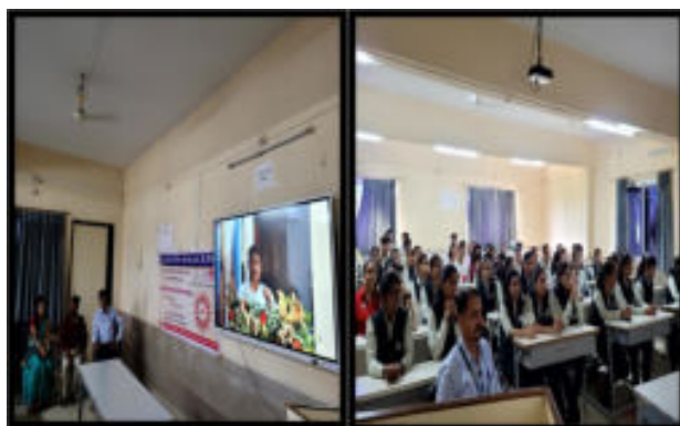
Students attending online live Facebook program