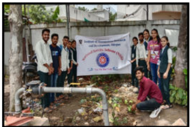
NSS Volunteers while planting plants