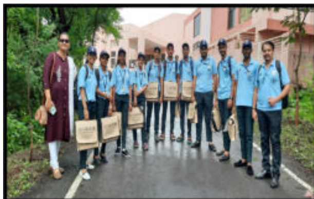
Participant Students at KBC NMU, Jalgaon