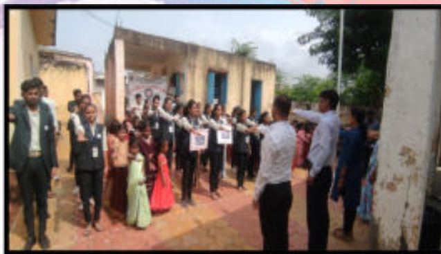
NSS volunteers taking an oath at Z. P. Primary School, Wanaval, Tal. Shirpur