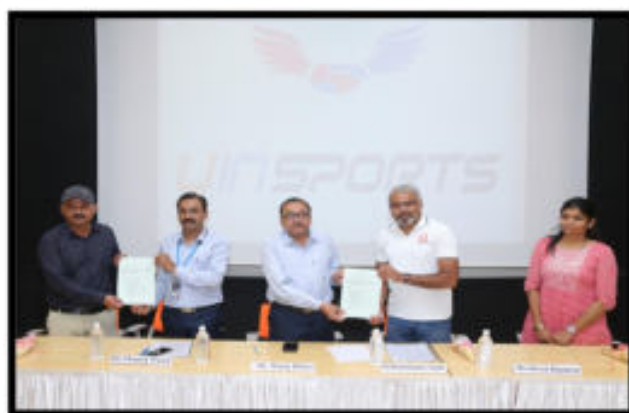
MOU Signing between IMRD and Uin Sports