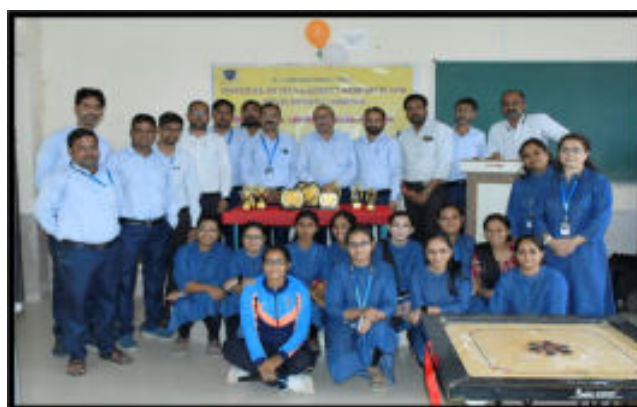
All Staff Participants at Intramural Carrom Competition