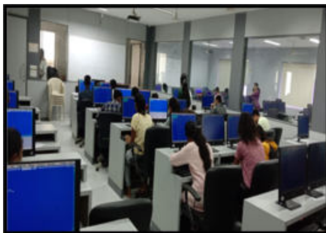
Machine test was conducted for MCA students