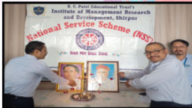
Faculty members paying a tribute to freedom fighters.