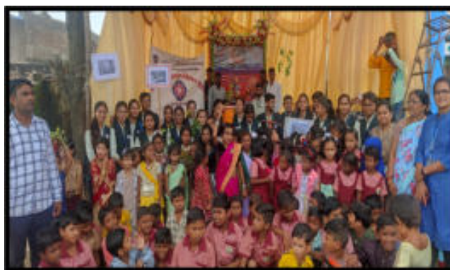
NSS volunteers celebrating Indigenous Day at Wanaval with Bhil Samaj Vikas Manch.