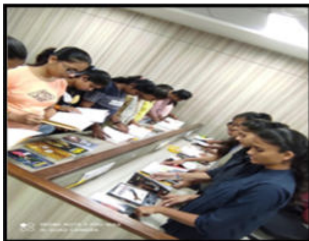
First year students visiting Book Exhibition