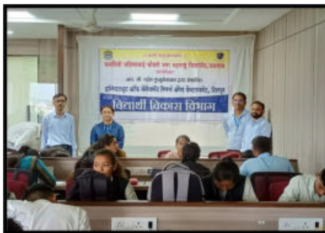
Students participated in Essay Writing Competition