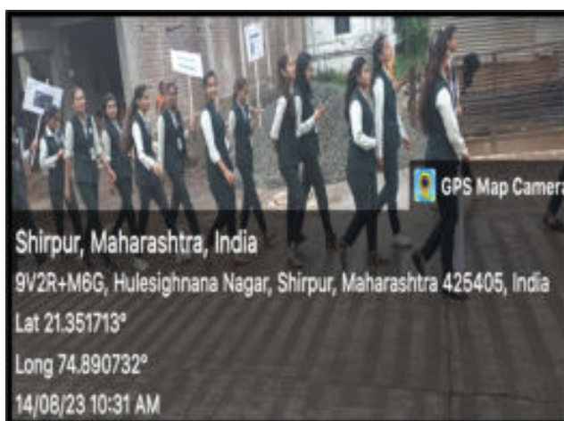
NSS volunteers actively participated in Rally on Mitti Ko Naman and Veero Ko Vandan