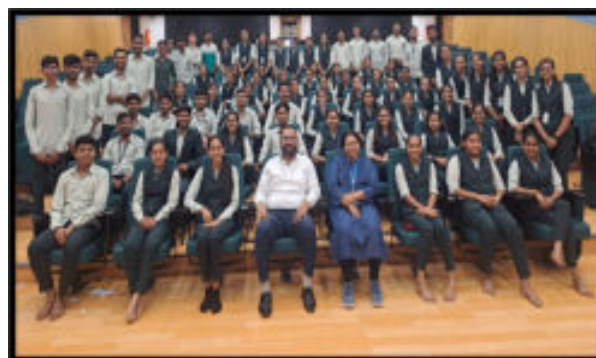
Final Year BCA Students participated in Training