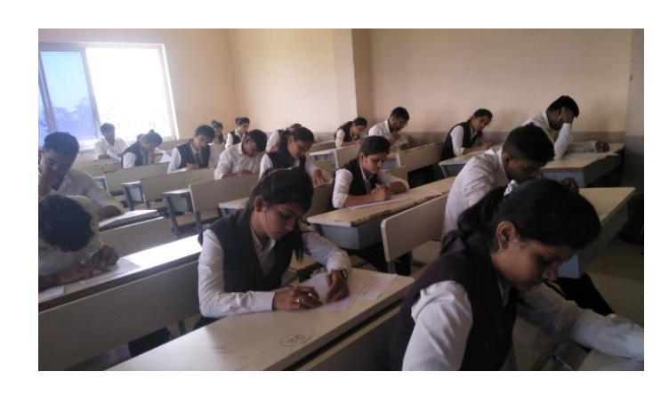
Students participated in aptitude test

Various topics were covered in this series like problem on train, time and work, problem on ages, ratio proportion, height and distance, HCF and LCM etc. Many test on technical skills were conducted like, C++, java, .Net, DBMS etc. Even students conducted few seminars on the topic and shared their knowledge with others. This was great activity by training and placement department through which students were able to enhance their problem solving abilities and improve their technical skills.