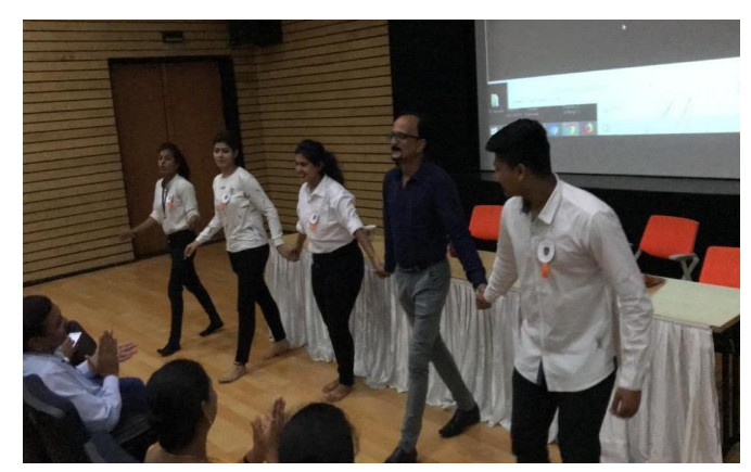
Confidence building and stage daring activity conducted by students in "Summary Showcase"