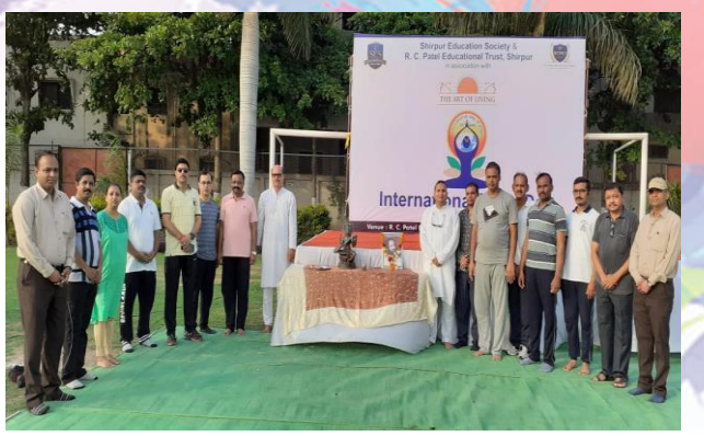
International yoga day inauguration by dignitaries

With the same enthusiasm Institute of Management Research and Development celebrated the "International Yoga Day" on 21st June, 2019. Student's Welfare Department of RCPIMRD, all the faculties and staff members were invited to celebrate "International Yoga Day" at Institute ground at 06:30 am. On this occasion the team of art of living was invited for yoga demonstrations. Different types of asana like Virasana, Vajrasana, Utkatasana, Tadasana, Urdhvamukhasana, Trikonasana, Sukhasana, Shashankasana, Makarasana, ArdhaMatsyendrasana etc. were practiced enthusiastically by participants. RCPIMRD always conduct such kind of workshops, seminar on yoga, diet etc. The Student's Welfare Department team and all staff members gave their great support to make this event successful.