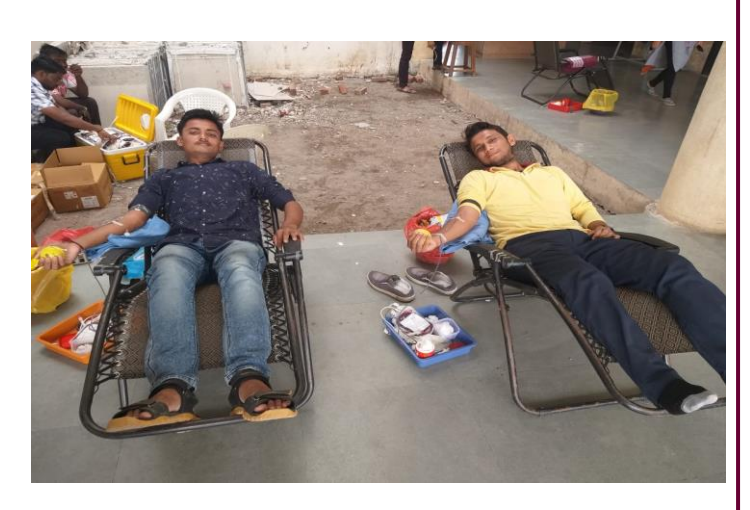
RCPIMRD Students donating blood