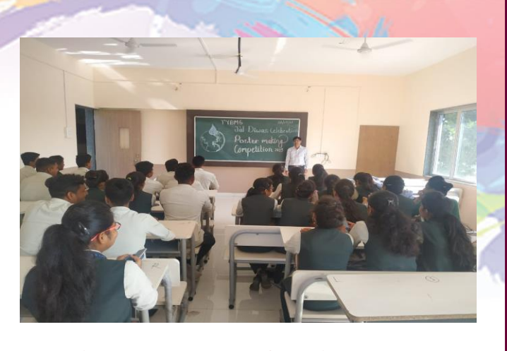
Jal Diwas celebrated by faculties and students