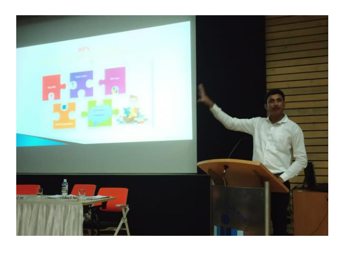
A detailed explanation of RPA by resource person