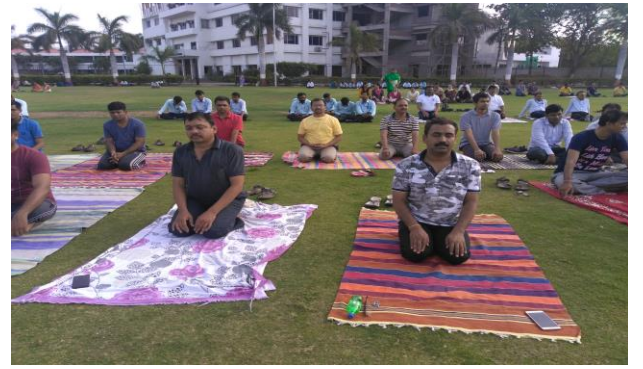
Faculties performing vajrasana at international yoga day