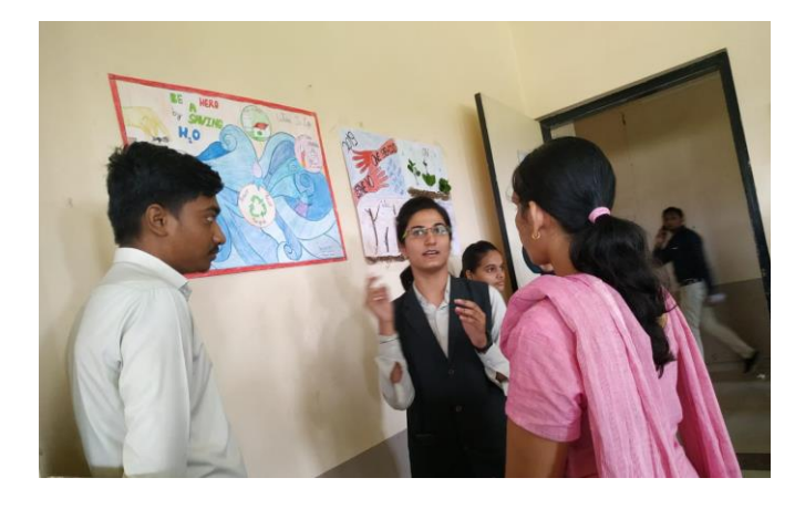
Students participated in poster presentation on the occasion of Jal Diwas

The students from all 2^{nd} year and 3^{rd} year participated in this event and created innovative posters, drawings and all the students participated in this activities enthusiastically and gave a message of "Save Water Save Life"