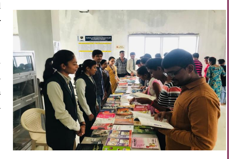
First year students visiting books exhibition