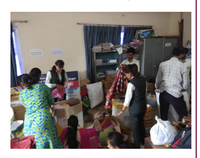
RCPIMRD staff while doing material packing