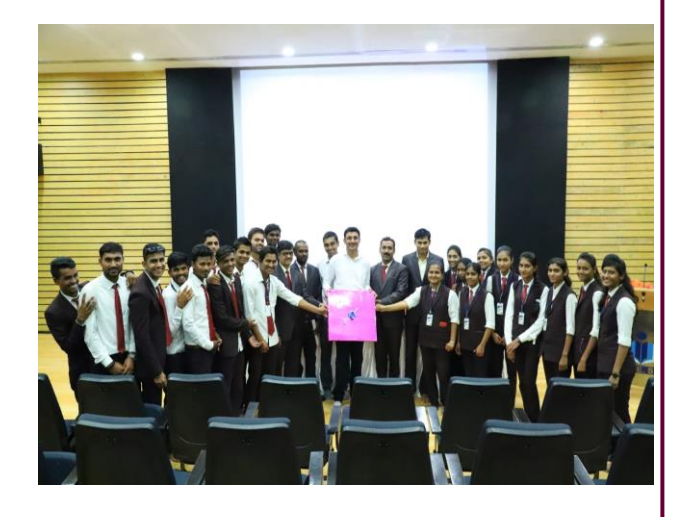
MMS second year students giving token of love to MMS department