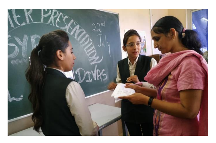
Judges while evaluating posters