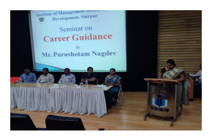
Dignitaries on dais for career guidance seminar