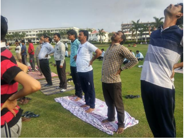
Faculties participated in international yoga day