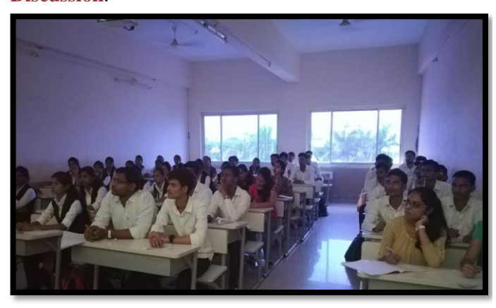
Students participated in Aptitude and Softskill training program