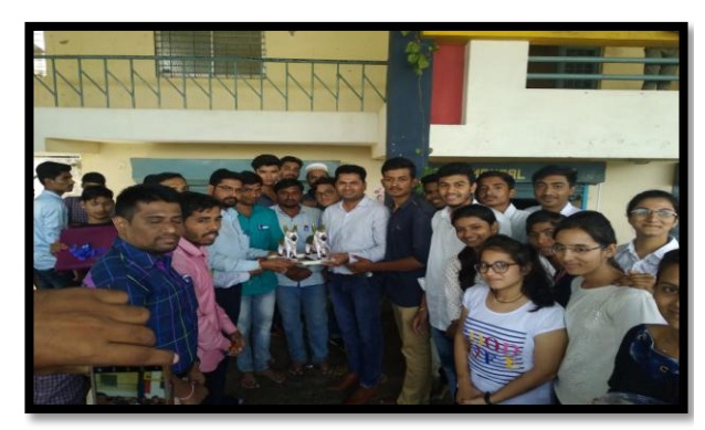
Faculties and students of IMRD with faculties of Anath Matimand Mulanche Baal Gruh, Shirpur.