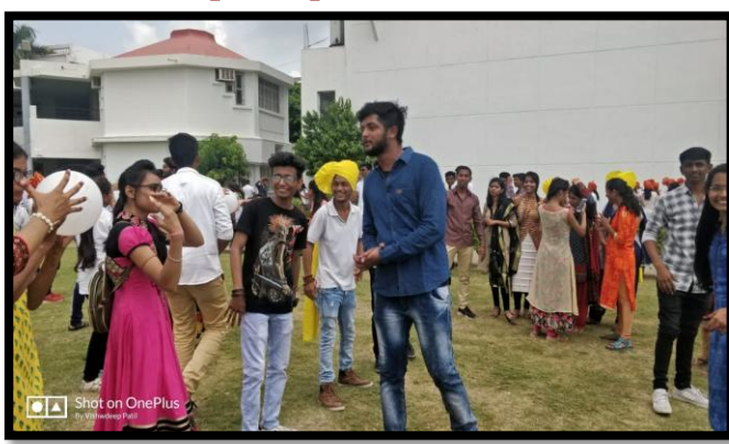
Student's participation in different activities.