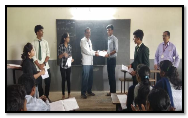
Prize distribution by Jr. College teachers to their best three winners.