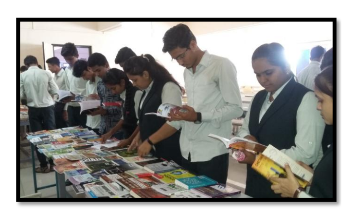
Students visited the book exhibition