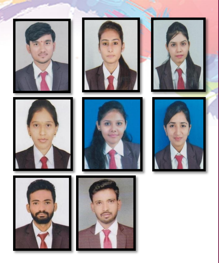
"Hearty Congratulations" to all selected students in TCS Technology, Pune.