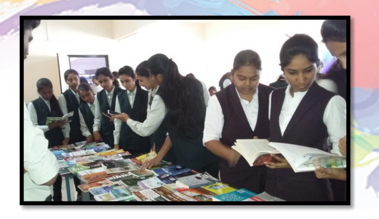
Girl students from UG and PG visited book exhibition