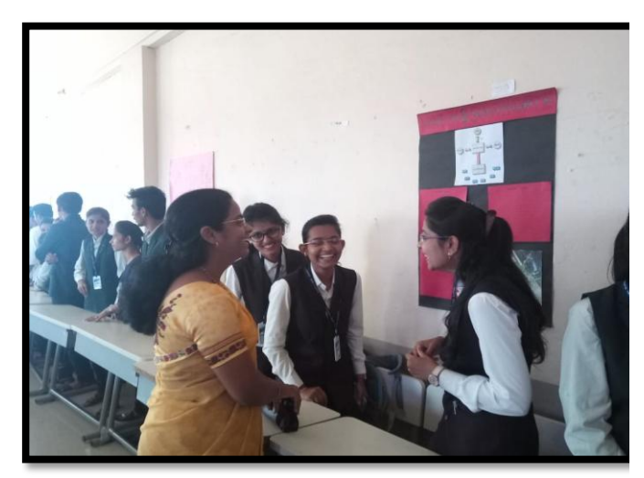
Faculties visiting to posters