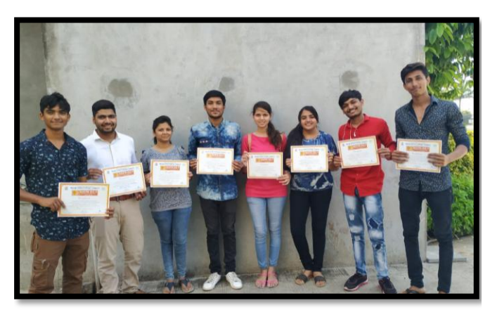
Students awarded with participation certificate.