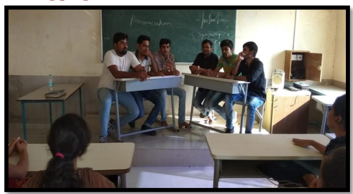
Active participation of MCA and IMCA students in Group discussion activity.