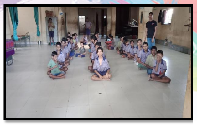
Orphanges at Anath Matimand Mulanche Baal Gruh, Shirpur