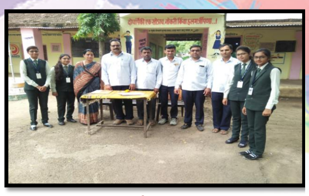
Students from BBA 2^{nd} year with staff members of Jr. College.