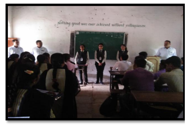
Girl students from IMRD presenting the theme of Teachers day best message contest.