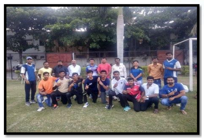
Inter College Softball 2<sup>nd</sup> Place Team

R. C. Patel Institute of Technology Shirpur, organized Intercollegiate Softball competition on 10<sup>th</sup> Oct 2018. In this competition 7 Boys team participated from R. C. Patel I.M.R.D. Shirpur who played very well and secured 2<sup>nd</sup> position. "Hearty Congratulations" to all winners