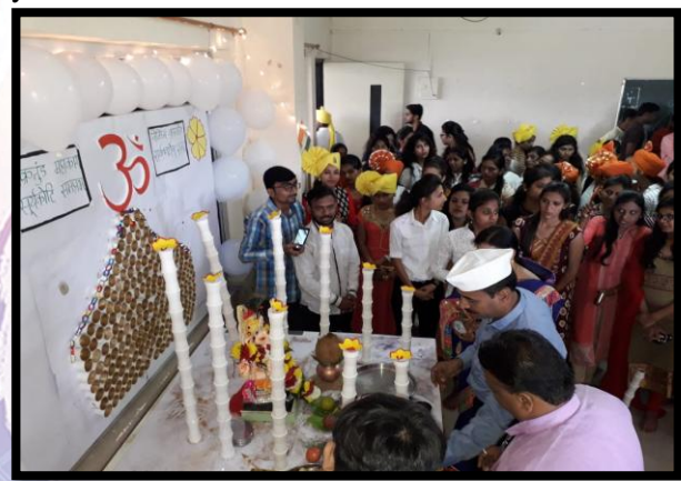
Ganesh Staphana by faculties and students.

Last day of festival on which a well-disciplined procession was led by the students from the campus to the immersion site of river "TAPI". "Bappa" was bid farewell with heavy hearts and with reassurance to come back soon in the next year.