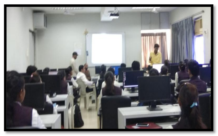
Hearty Congratulations to all selected students.