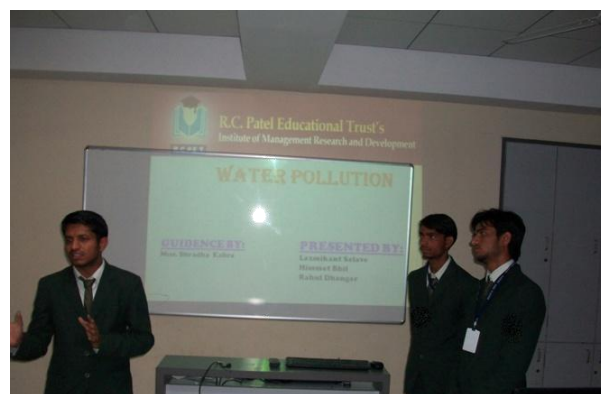
Students giving Presentation.