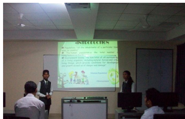
Girl students giving Presentation.