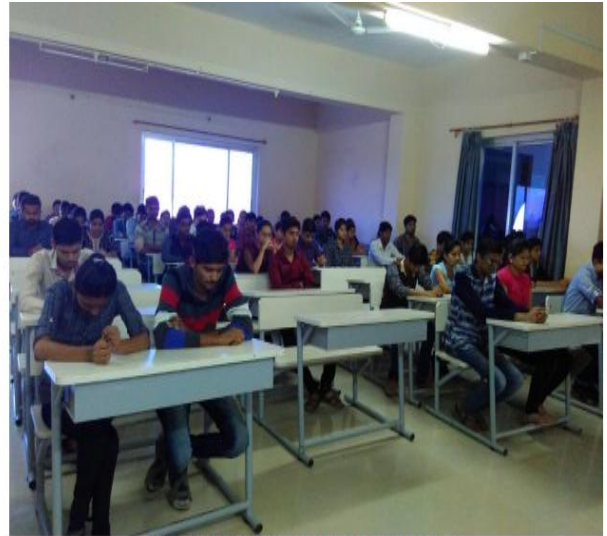
Meditation session for MBM students before exam.