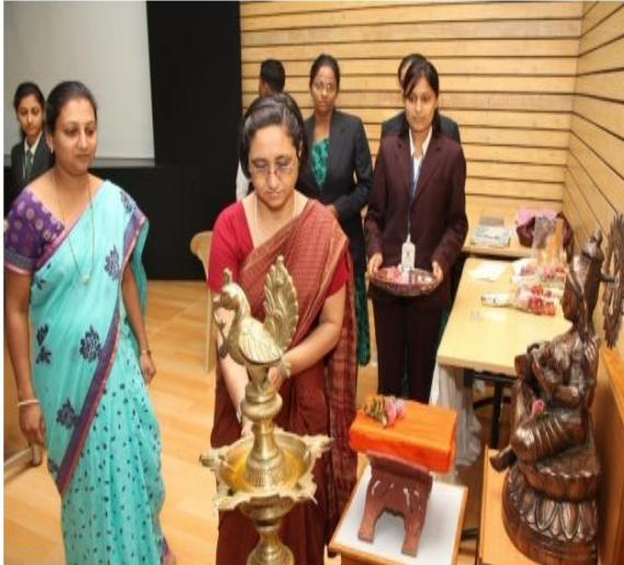
Dignitaries at inauguration of Save girl campaign

Save Girl child Campaign program organized in IMRD as on 05 Feb 2015. The main objective of the program was to create awareness among the people about the importance of girl child.