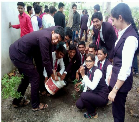
Institute students planting trees in rural area.

Institute organized tree plantation under this activity 30 students are participated. Main objective is to improving environmental conditions and providing multi-disciplinary learning for students of all ages. It teaches them about plants and shows them how their efforts make an impact that they and their communities can revisit for years