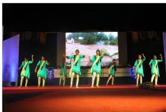
Girls performing Group Dance on Annual day