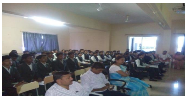
Students & Faculties at Workshop on “Learning to Learn”