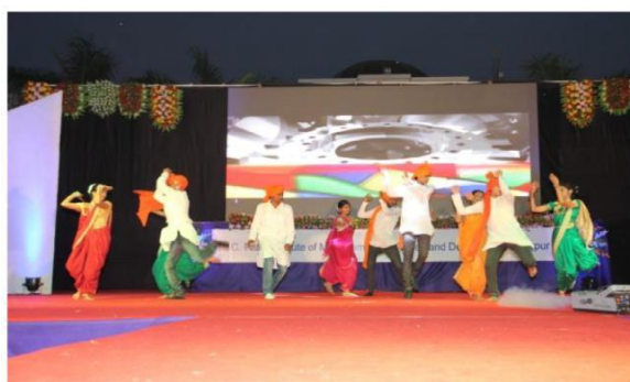
Students performing FolkDance on Annual Day