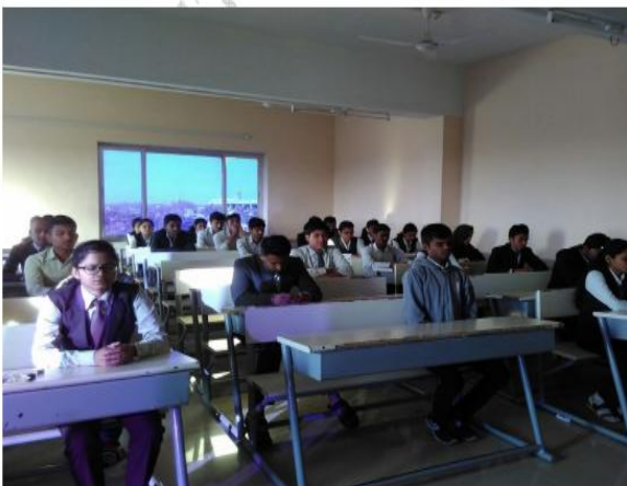
Meditation session for UG students before exam

Institute conducts two minutes meditation session for students to refresh their mind and increase concentration power before internal examination in exam hall.