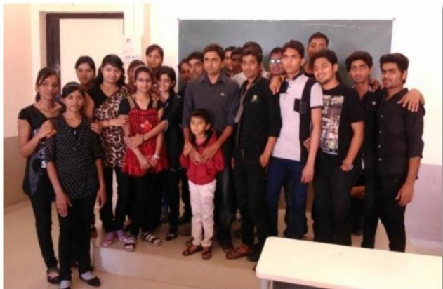
Mis - Match Day