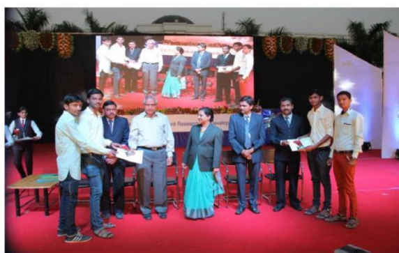
Awards given by Chief Guest & Director Madam