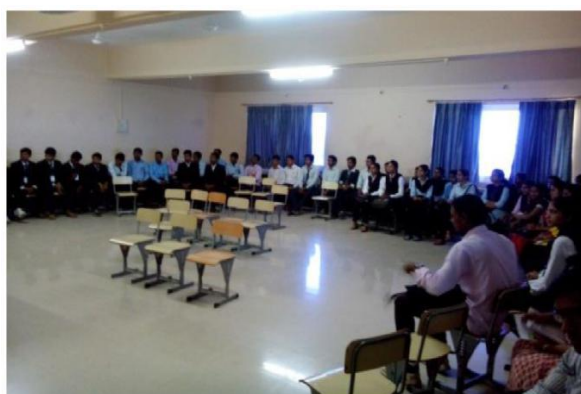
Students & faculties present at workshop