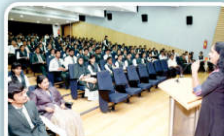
Soft Skill Development Training