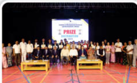
Academic Toppers in University Merit List