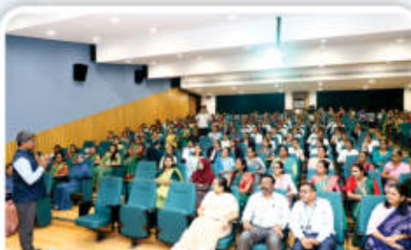
Women Financial Literacy