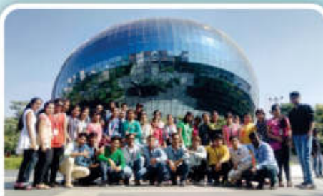
Industry Visit at Infosys