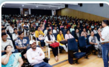
Gender Sensitization Workshop