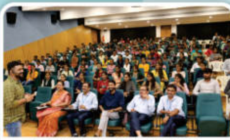
Entrepreneurship Development Awareness session