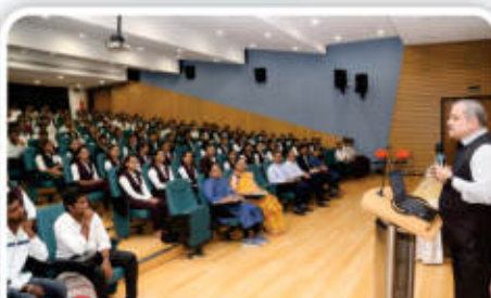
Personality Development Program