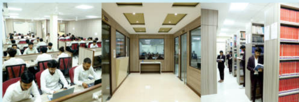
AC Library and Reading Room

repute as a centre for quality education for its prime infrastructure tied up with modern equipments and a disciplinary environment. An academically strong and committed faculty is the backbone of IMRD. A special mention about our Alumni, who are eminent and hold significant position in their profession in India and abroad. We heartily welcome you to explore a brand new wonderful life and a bright future ahead.