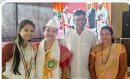
MCA Gold Medalist in KBCNMU, Jalgaon