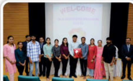
MCA Induction Program