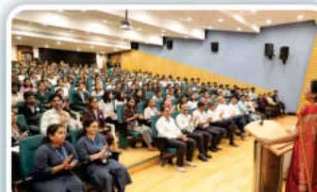
Session on AI