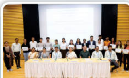
BI-to-BI top 10 Teams