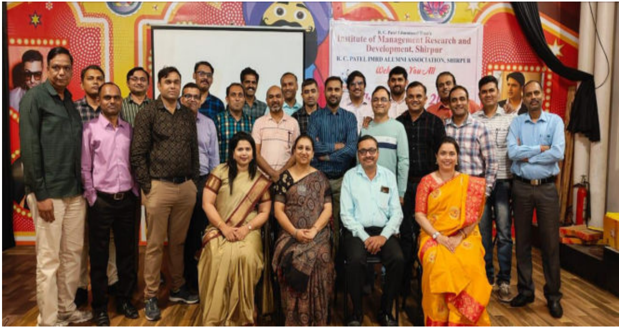
Alumni Meet 2023 at Hotel Tim Luck Luck, Pune