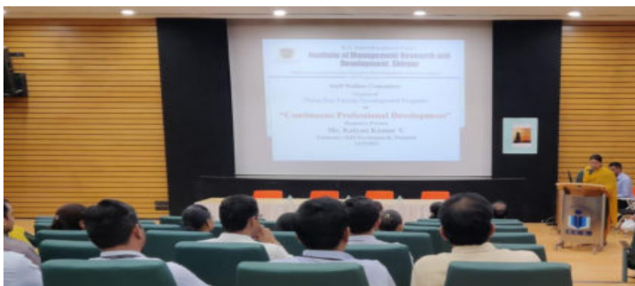
Inauguration of session Six Days Faculty Development Program on “Continuous Professional development”