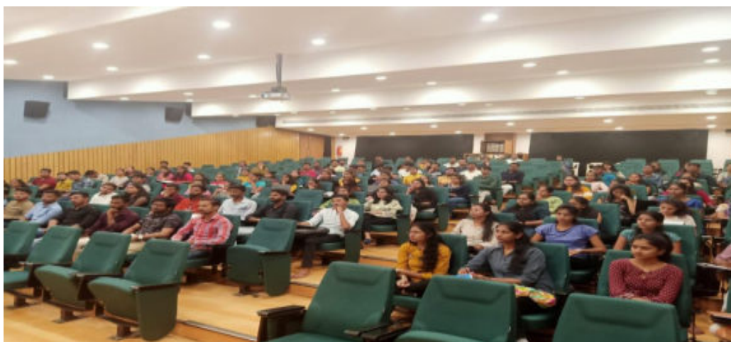
Students Attending training program