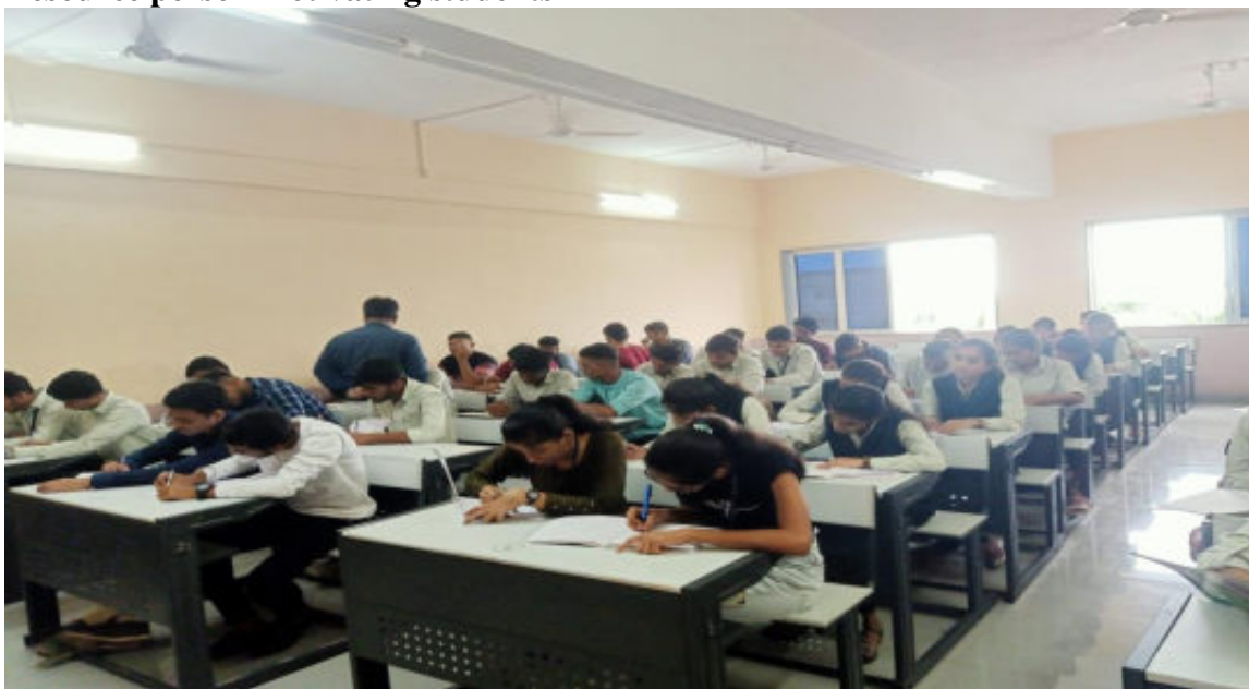
Students Participated in event.