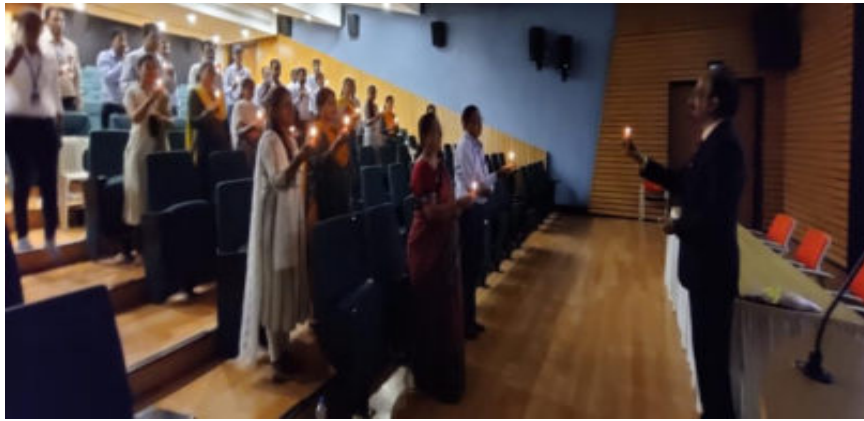
Inaugural activity in the FDP