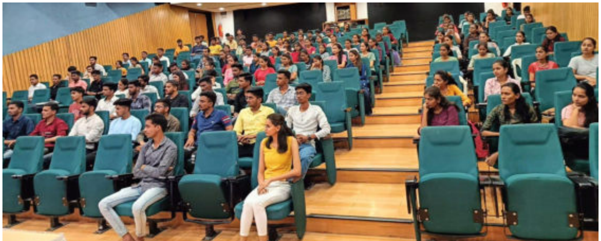
Students involved in Infosys Skill Development Training