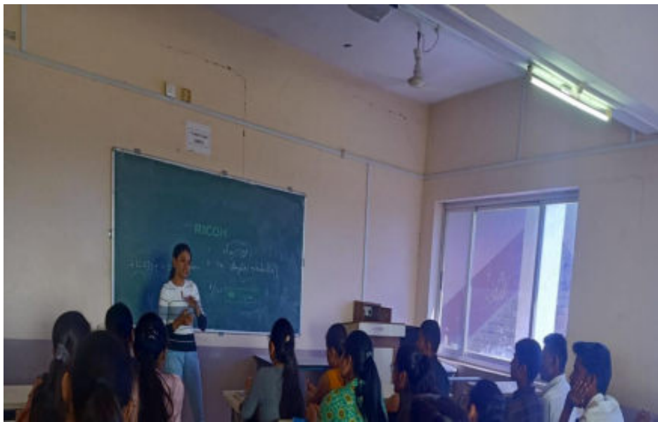
Interactive session by bright students of IMRD