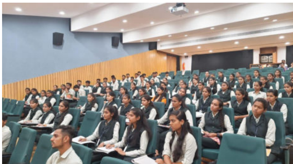
Final year students participated in event