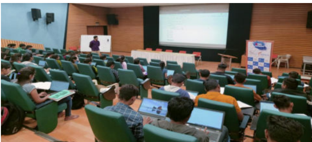
Students doing practices during Technical training on AI with Python