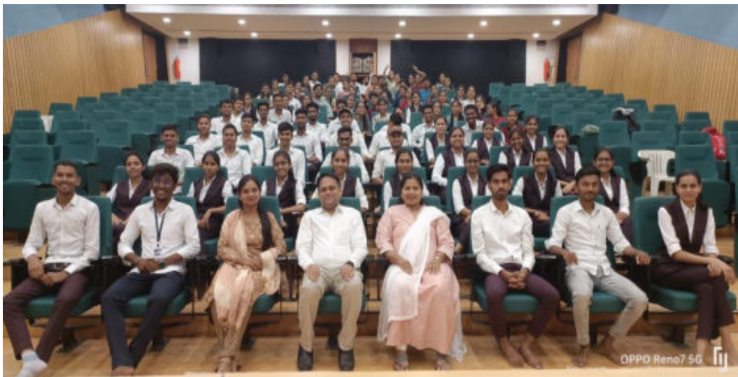
Students participated in training with Resource person and T&P team