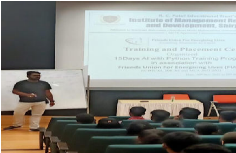
AI with Python Training