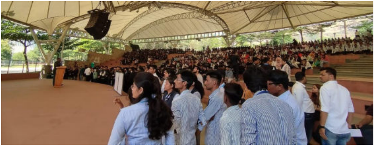
Students in the HR Session at the Auditorium.