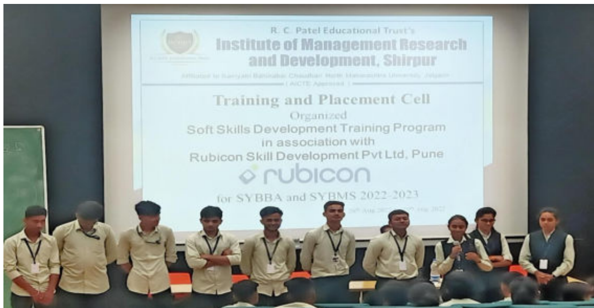
Students participated in Confidence building activity.