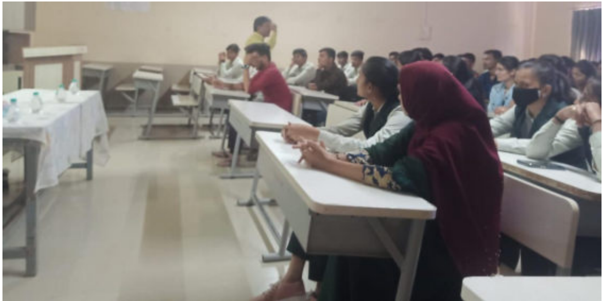
UG and PG students participated in Japanese Awareness program.