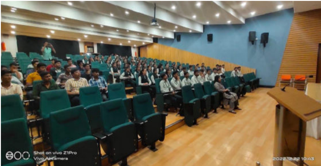
BCA Students participated in training