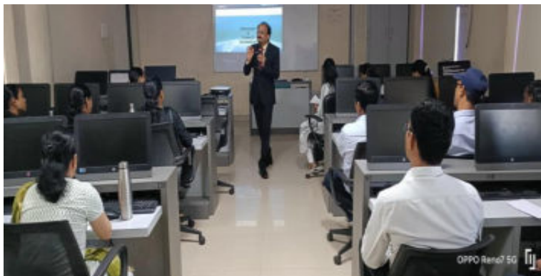
Sir delivering content in FDP