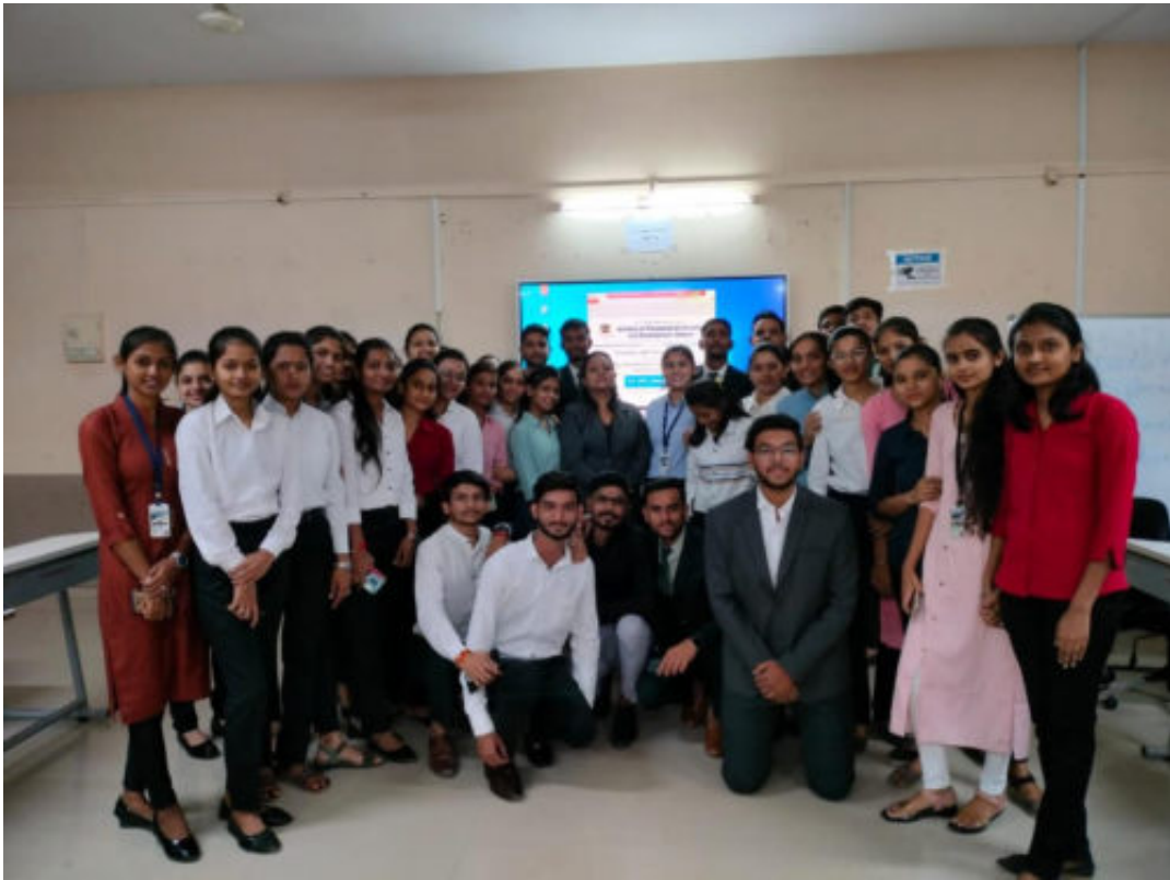
Students Participated in Infosys SDP