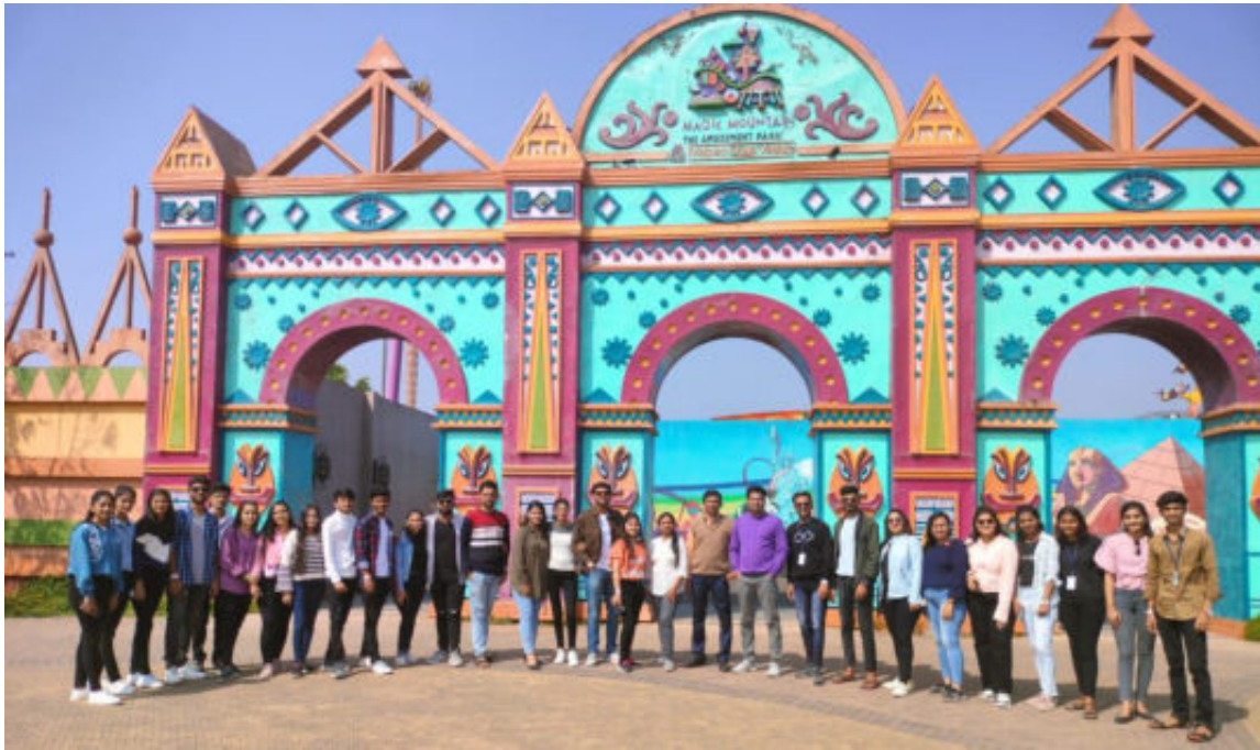
At Wet N Joy Amusement Park Lonavala, Pune