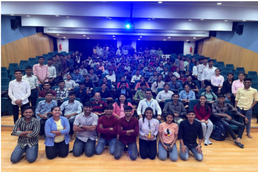
Students participated in Training program