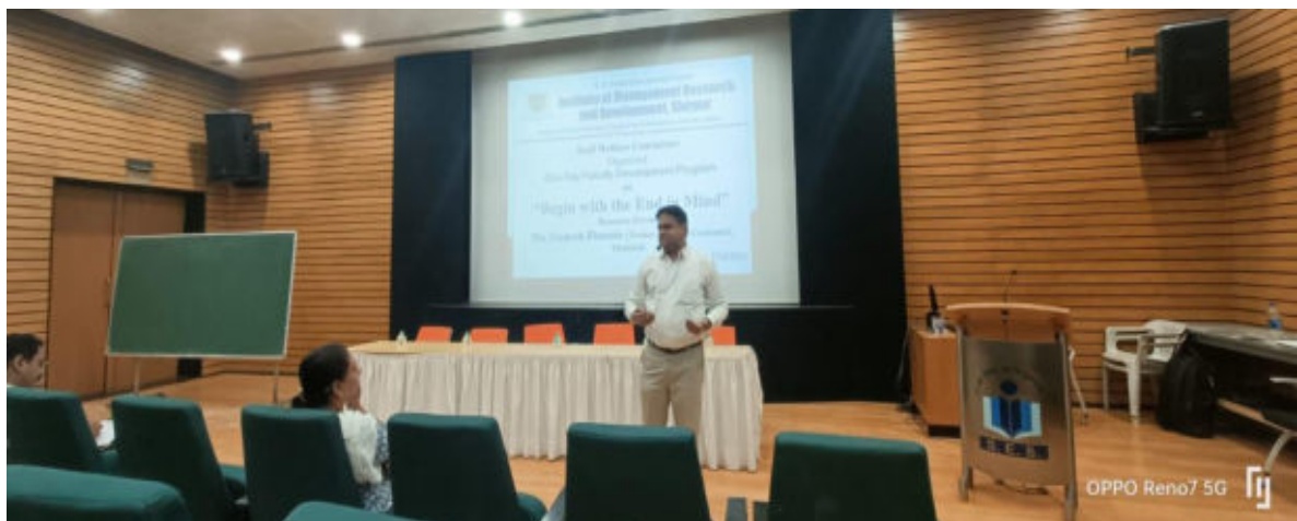
Sir delivering content on “Begin with the End in Mind”