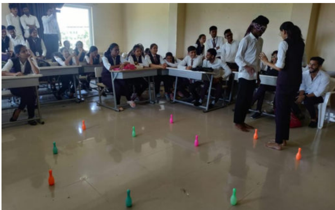
Activity in Infosys Skill Development Training