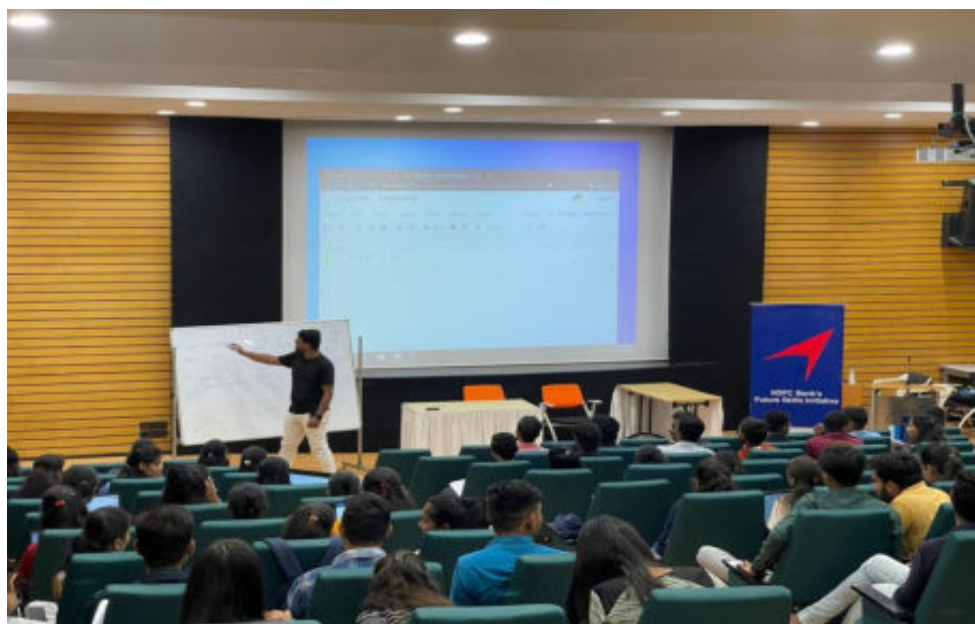
Trainer explaining Jupiter