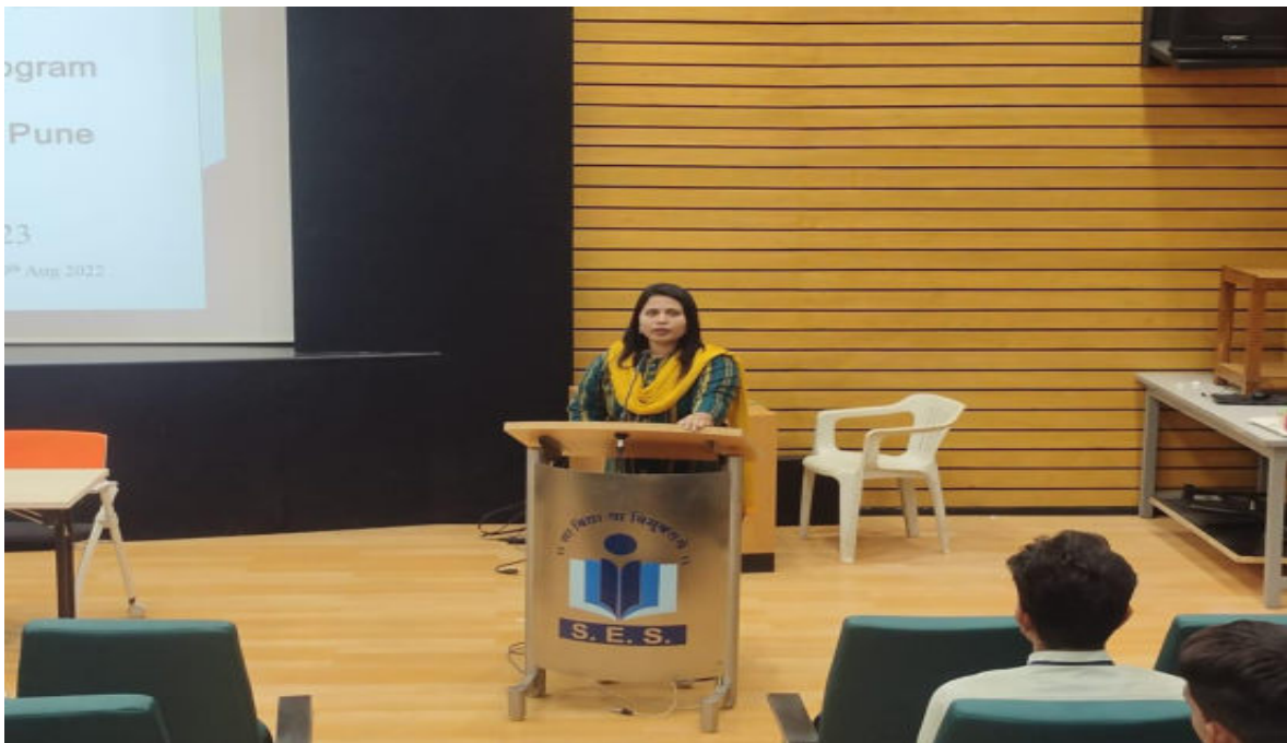
Training and Placement officer talking with students about program structure.