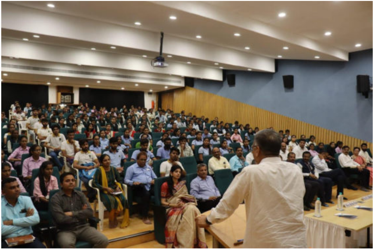
Hon. Rajgopal Bhandari sir addressing audience