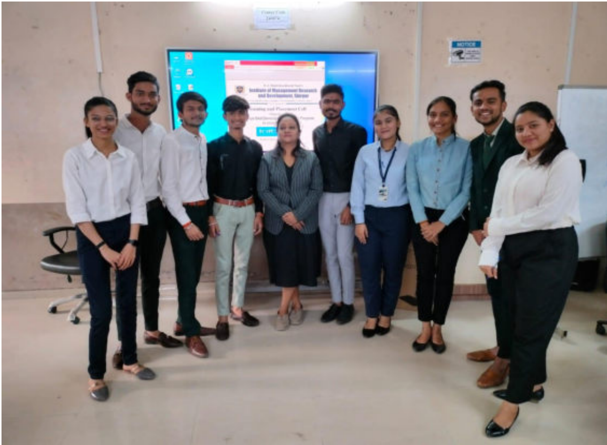
Students in Formals on Mock interview day