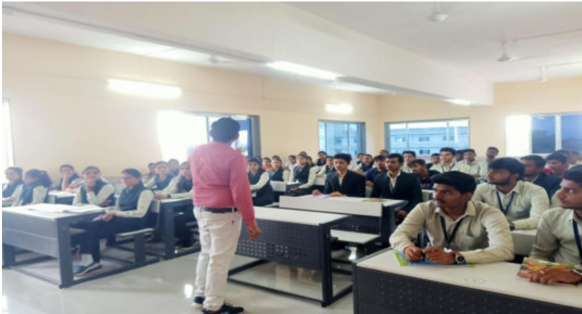
Resource person motivating students