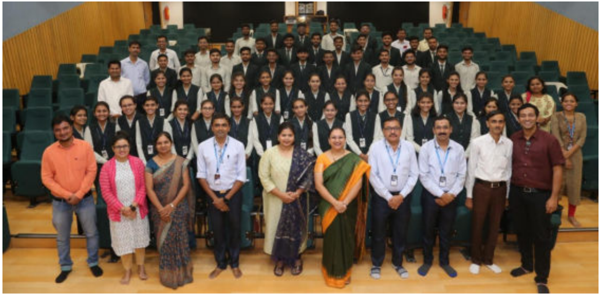
Students selected for FUEL technical training with Hon Director and faculties