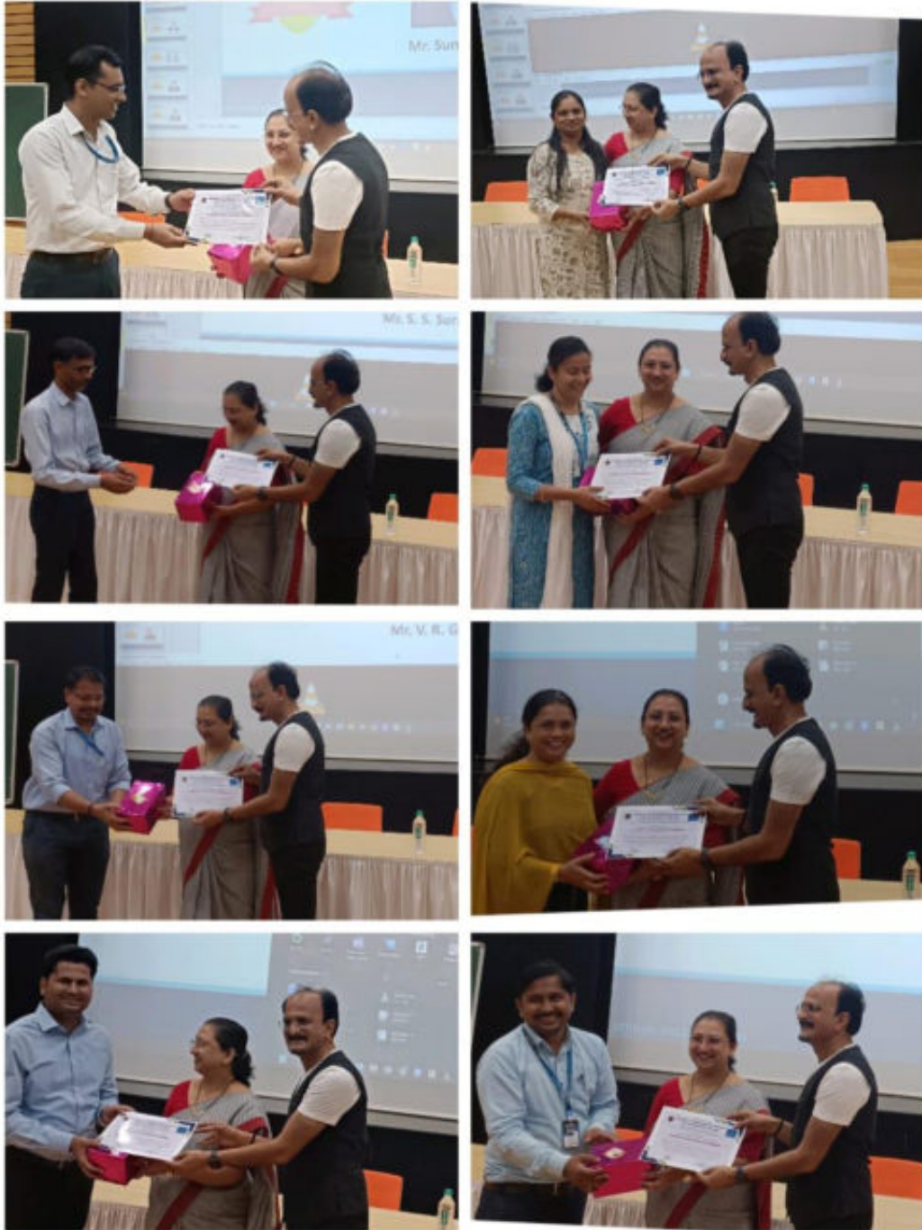
Faculties Awarded as Star Performer