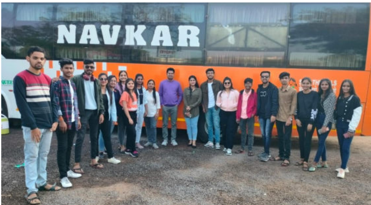
Leaving for the Lonavala.