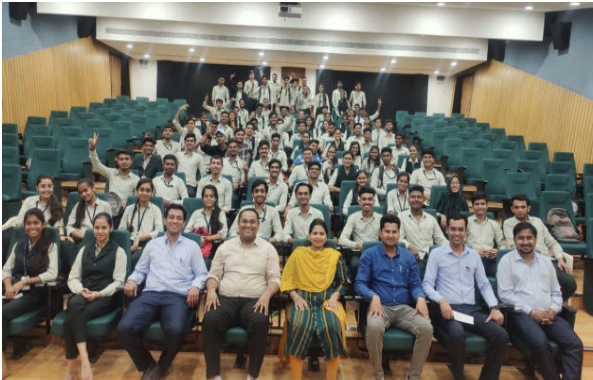
Students and Faculties participated in Training.