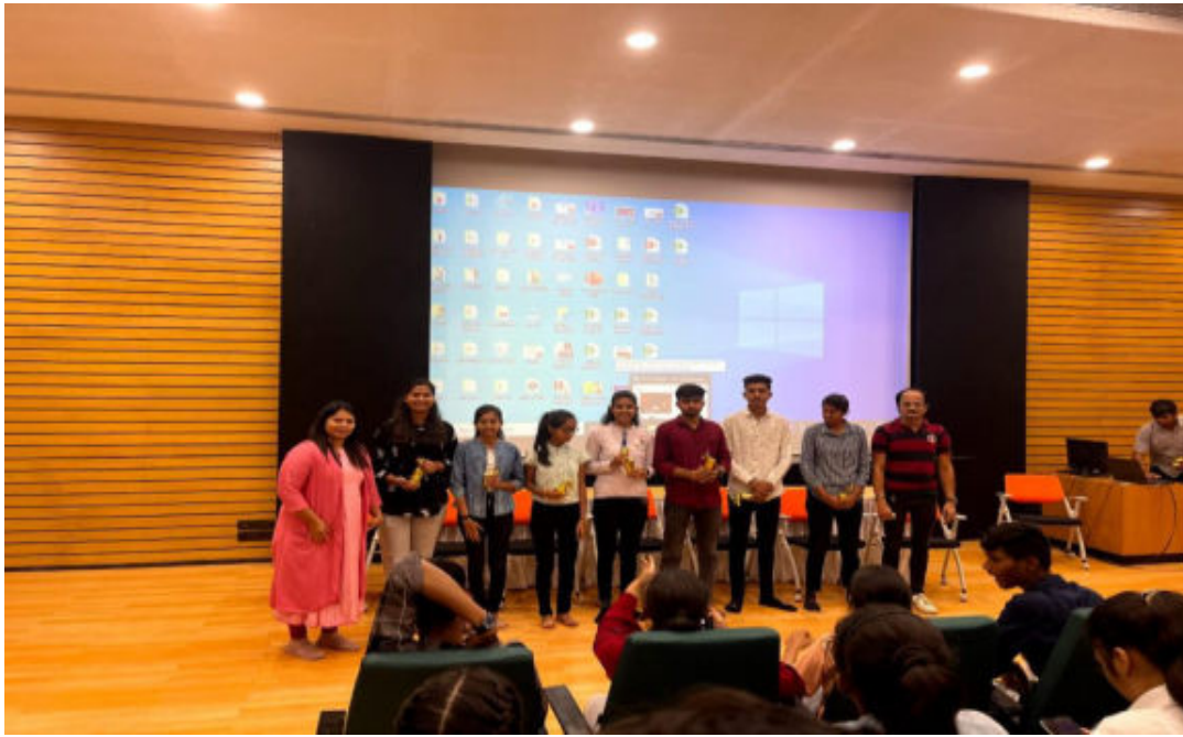
Students awarded for best participation