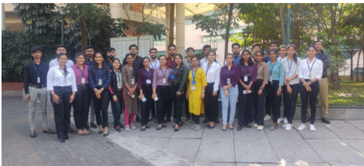
Entrance of the Infosys Pvt. Ltd. Hinjewadi, Pune.