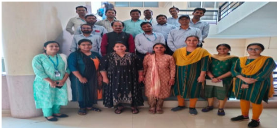
Faculties involve in FDP