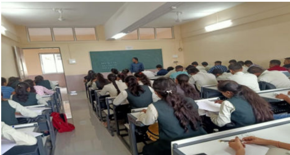
Students were trained on Logical Reasoning