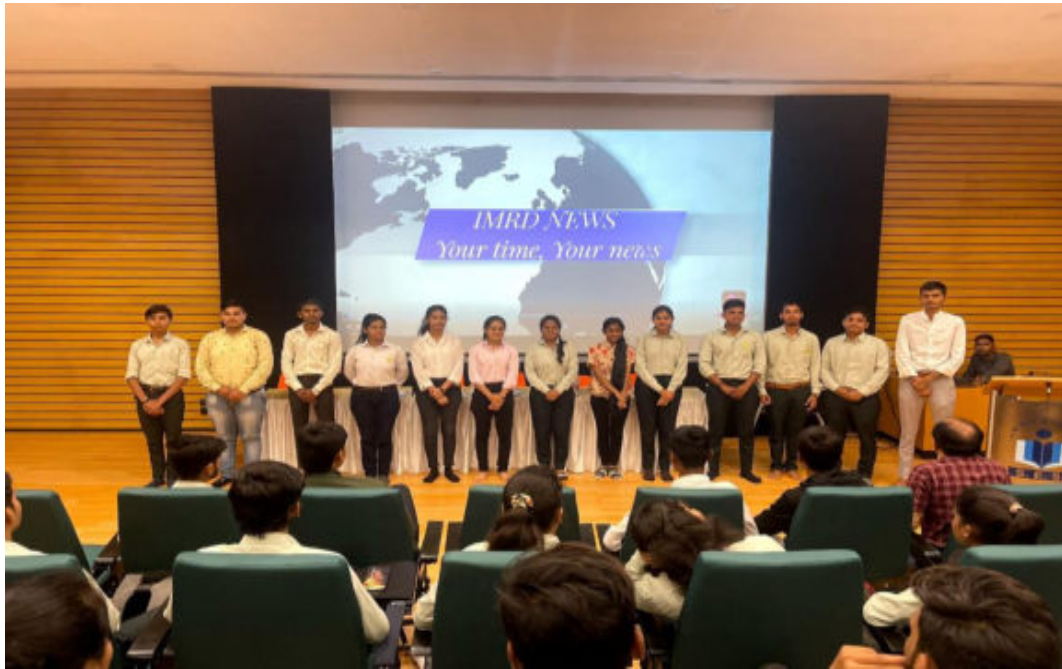
News Channel created by participants