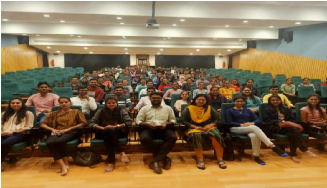
Last Day of Training