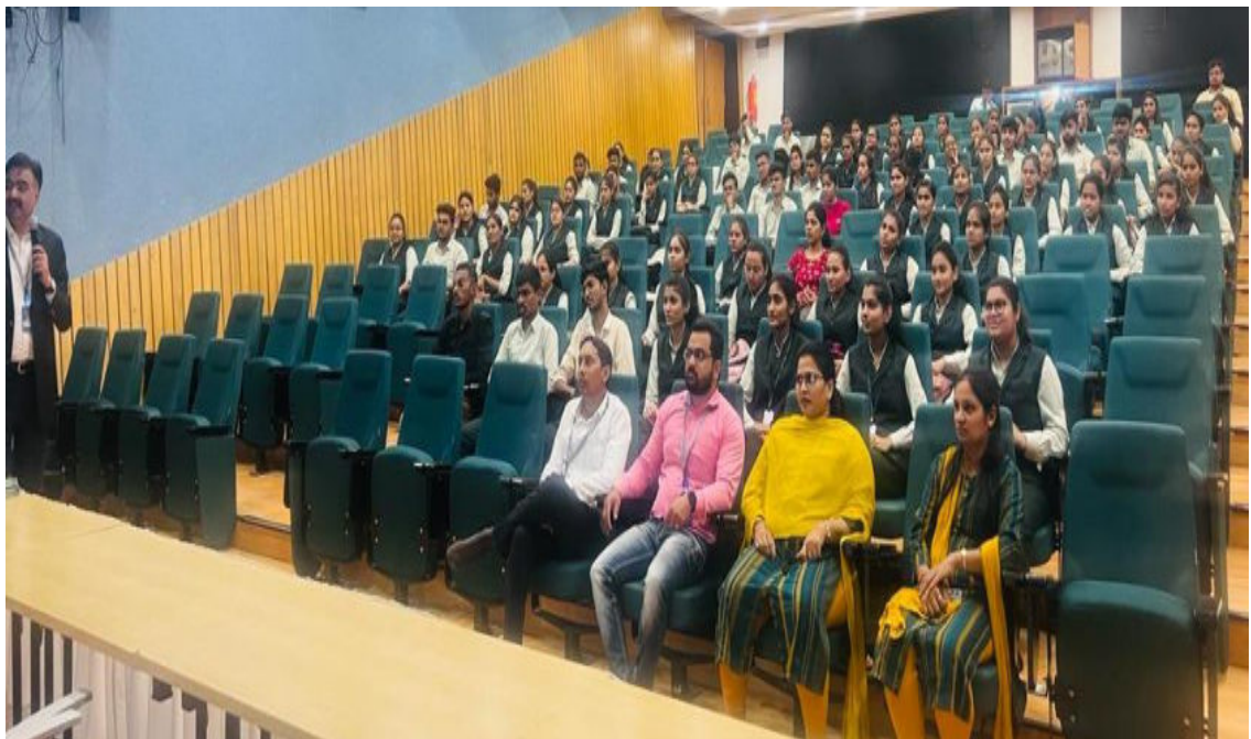
Students and faculties attending session