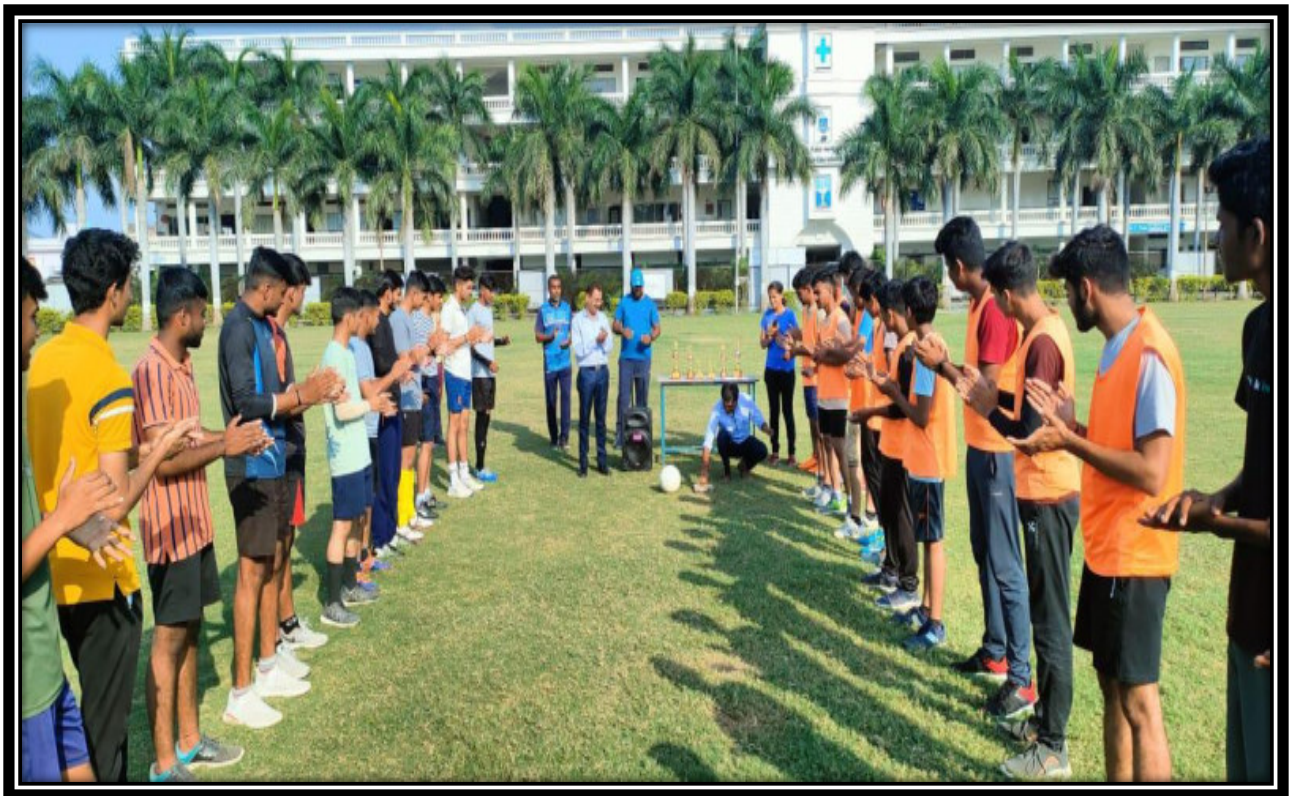
IMRD Football Competition Opening Ceremony