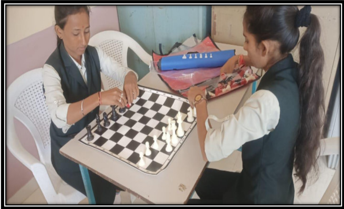
Students Participated in the Chess Workshop