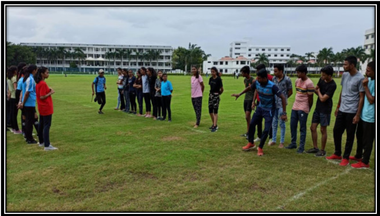
Students Participated in the Athletics Workshop