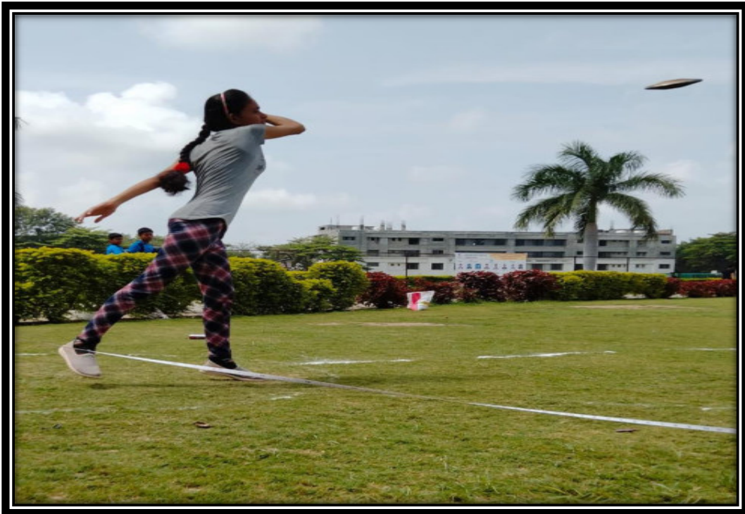
Students Participated in the Discus Throw.