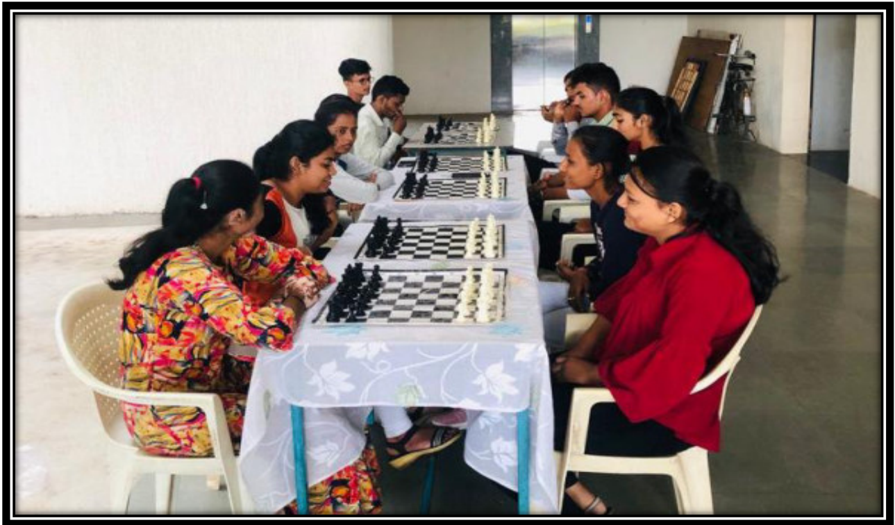
Students Participated in the Chess Competition