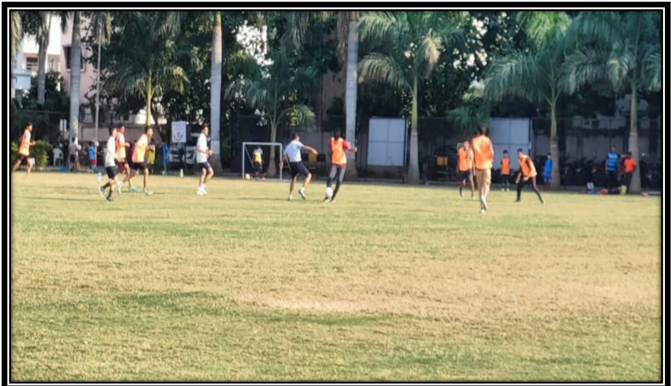
Students Participated in the IMRD Football Tournament.