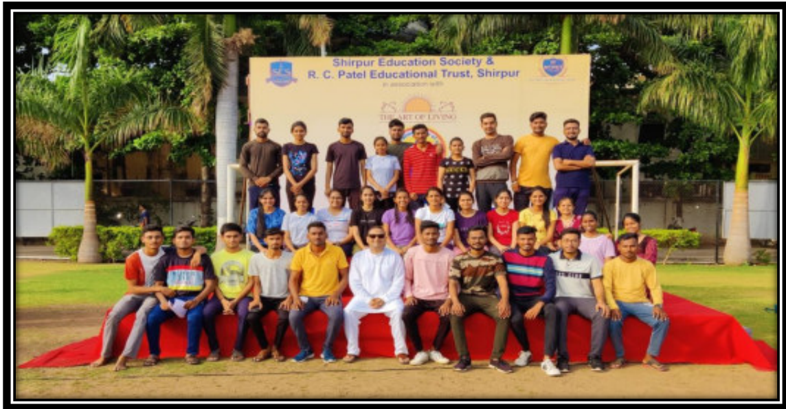
Students Participated in the International Yoga Day