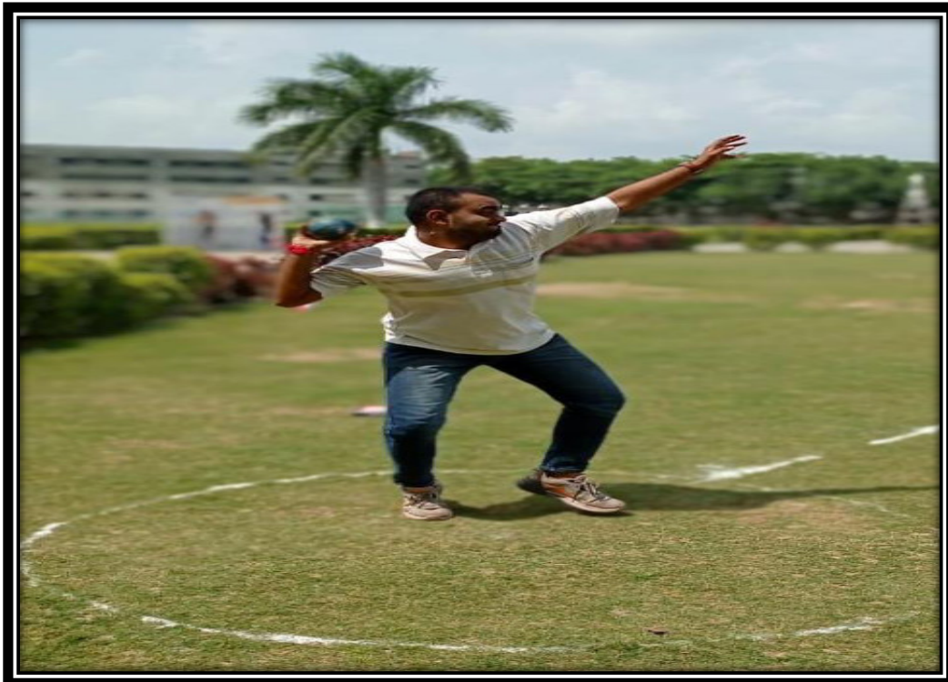
Students Participated in the Shot Put Throw