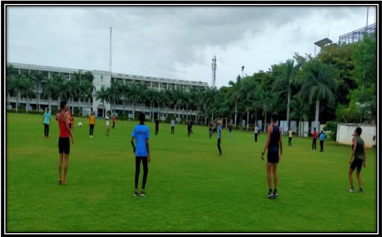
Students Participated in the Athletics Workshop