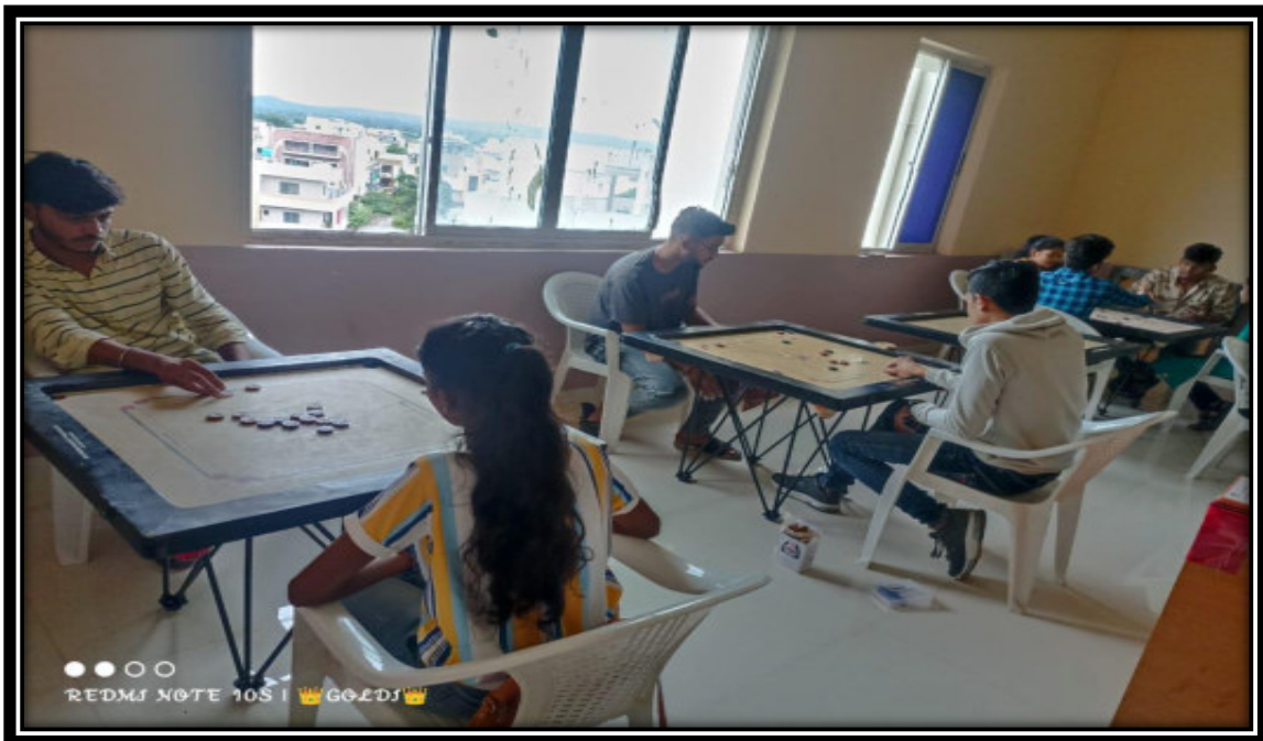
Students Participated in the Carrom Workshop