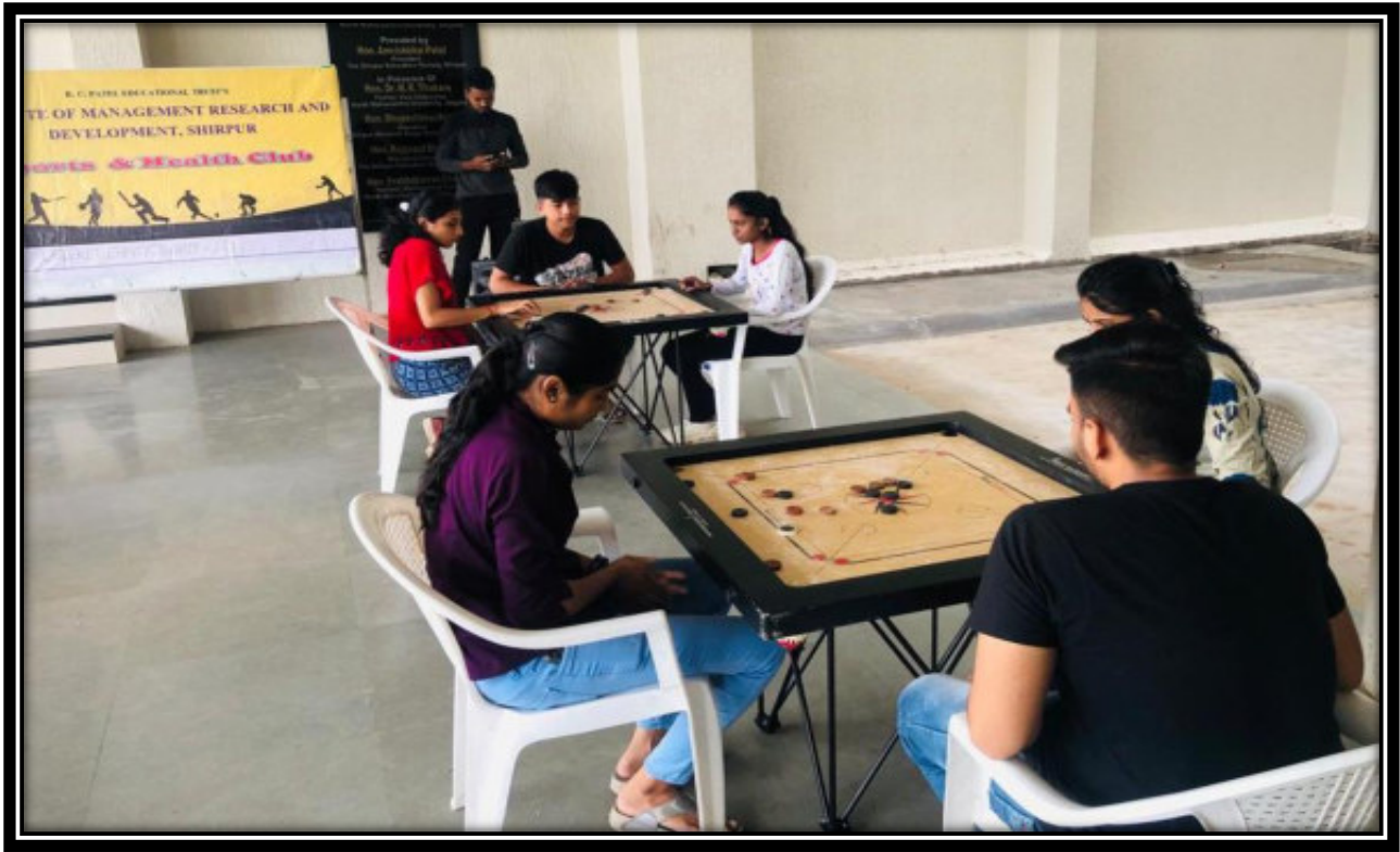
Students Participated in the Carrom Competition