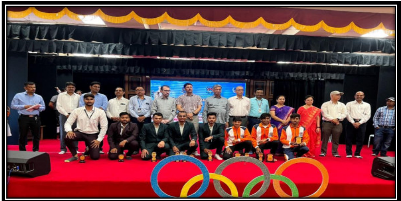
Rewarding achievements in Sports by the dignitaries