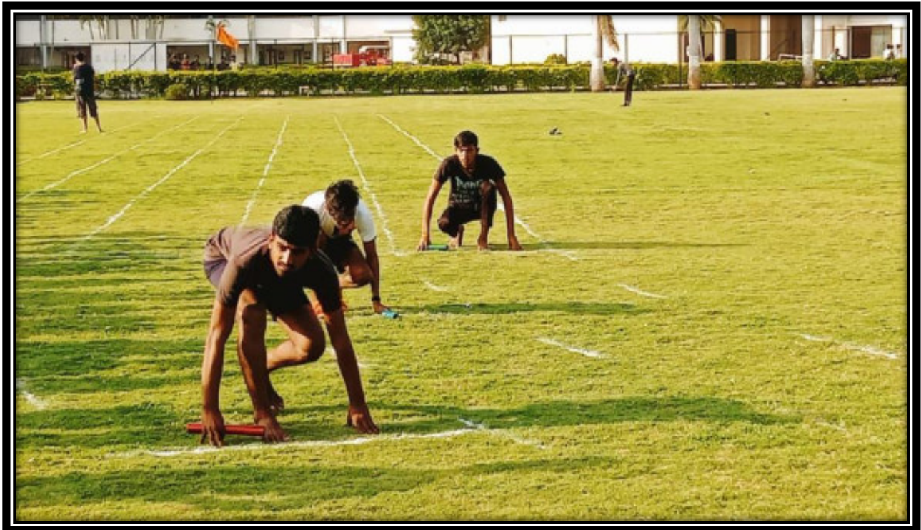
Students Participated in the Relay 4*100m .