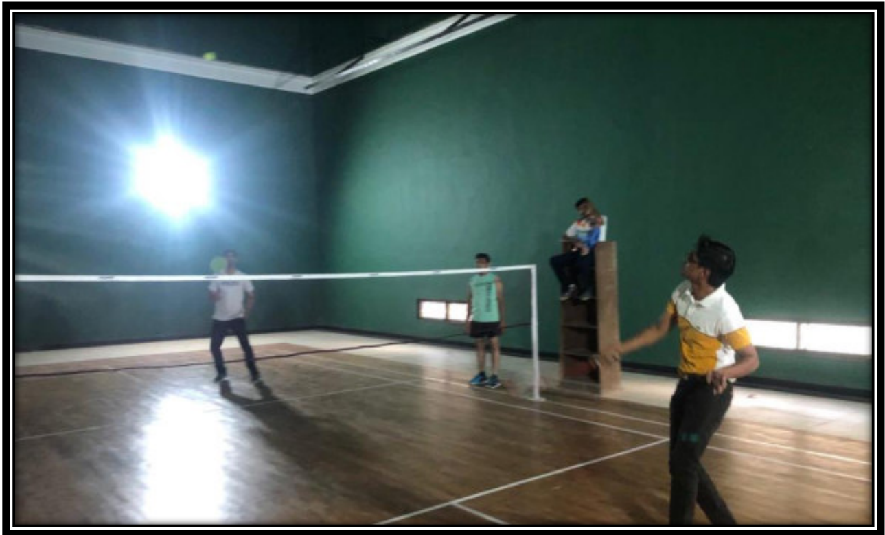
Staff Participated in the IMRD Badminton Competition.