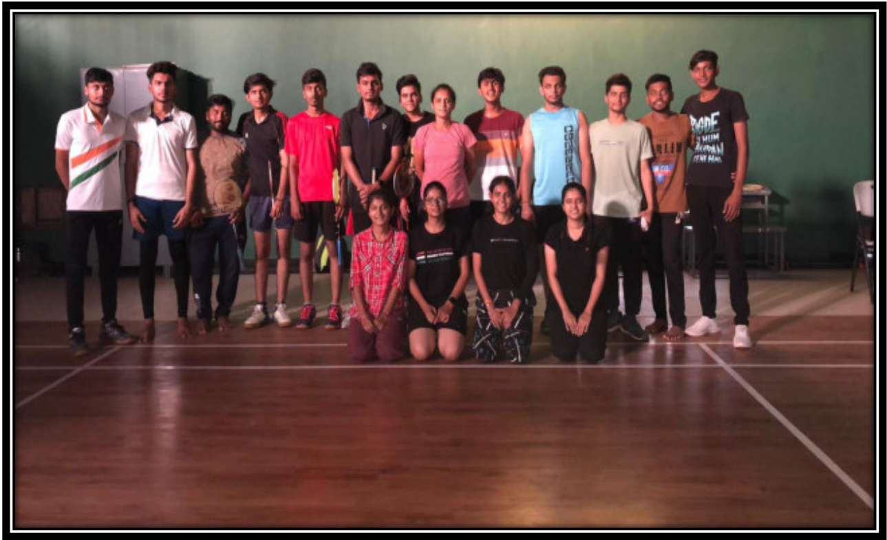
Students Participated in the IMRD Badminton Competition.