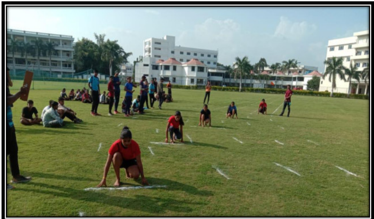
Students Participated in the 200m Running Race.