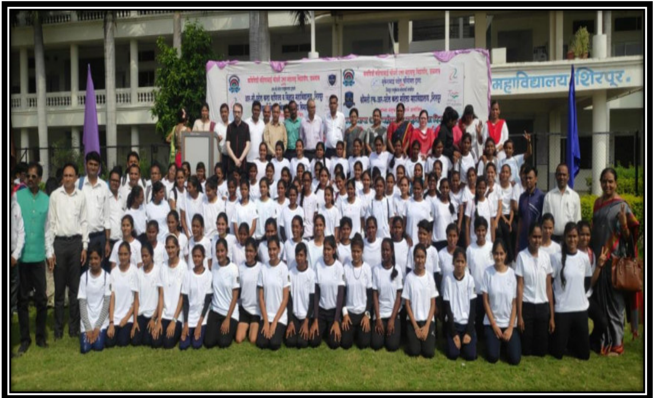
Students Participated in the Marathon (5km).