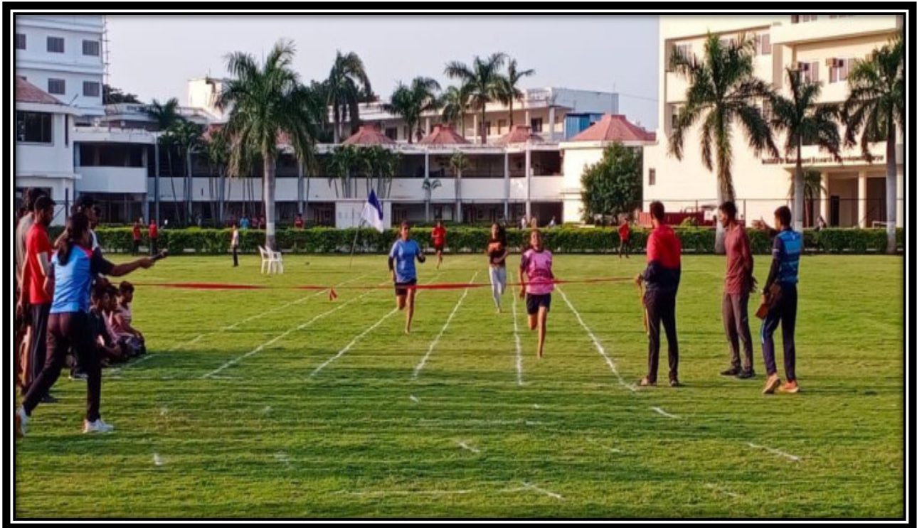
Students Participated in the 200 m Running Race.