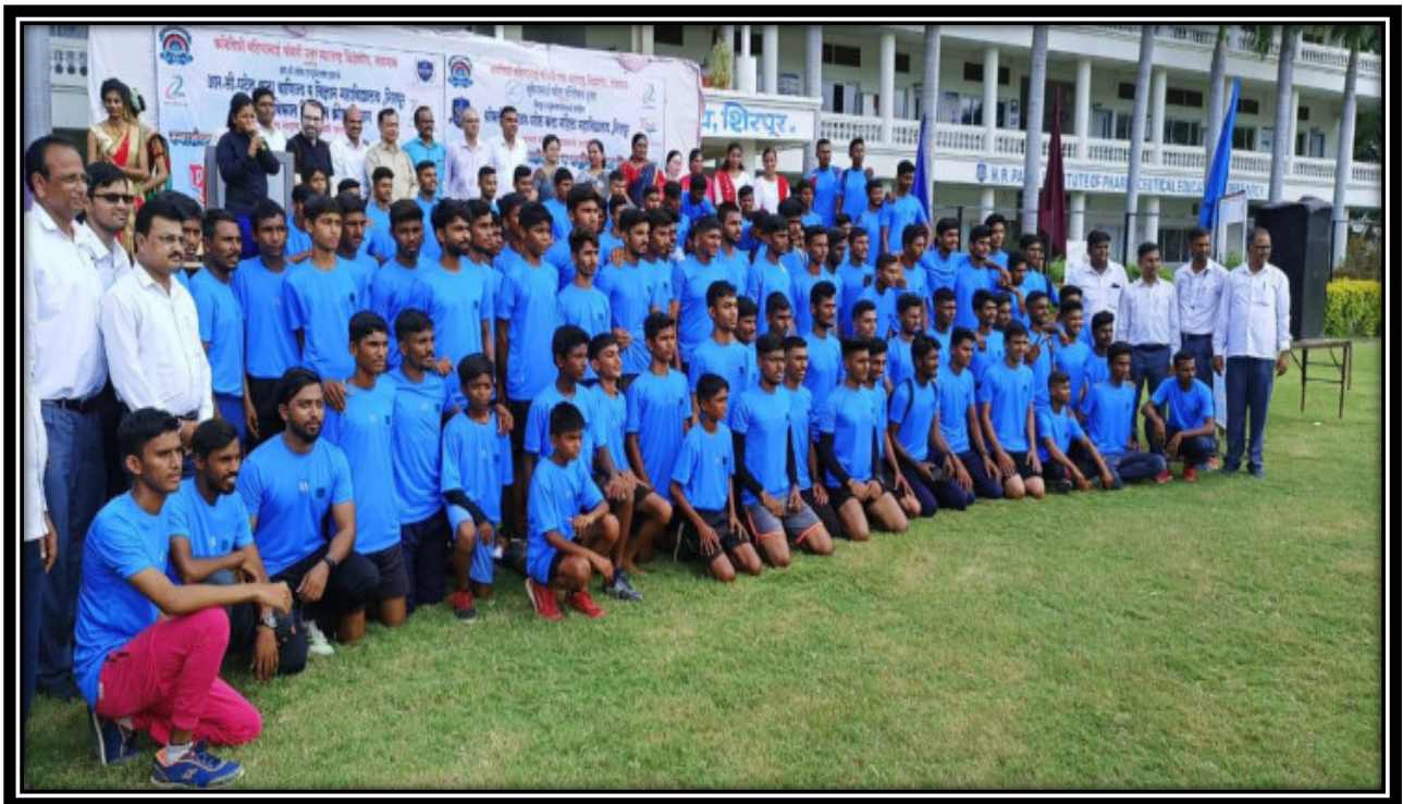
Students Participated in the Marathon (10km).