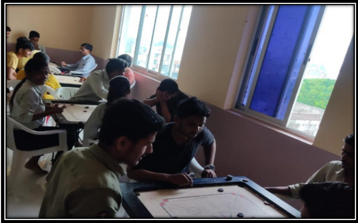
Students Participated in the Carrom Workshop