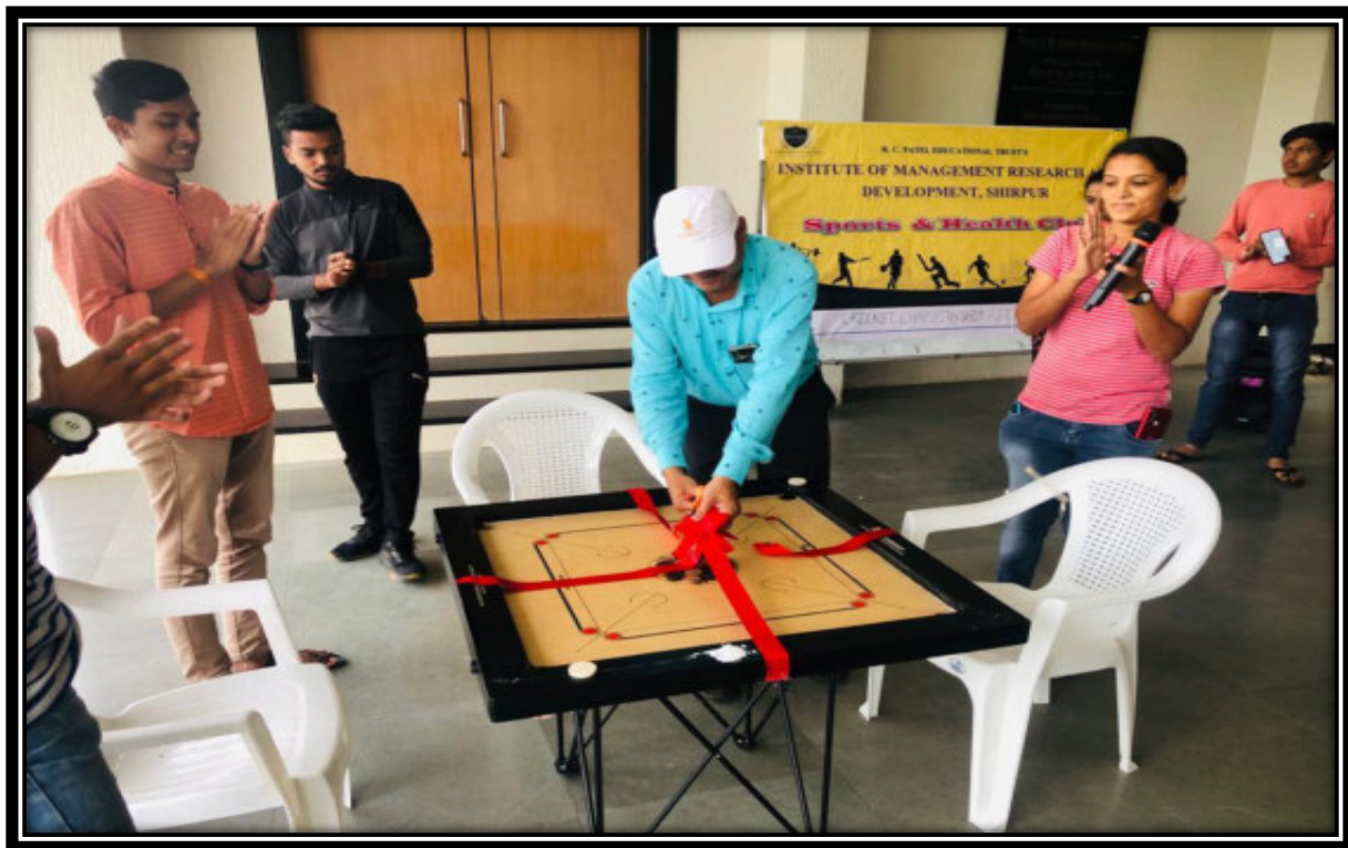
Intramural Carrom Competition Opening Ceremony