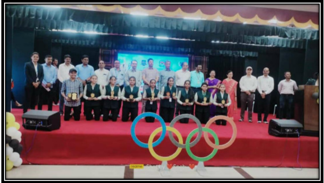
Rewarding achievements in Sports by the dignitaries