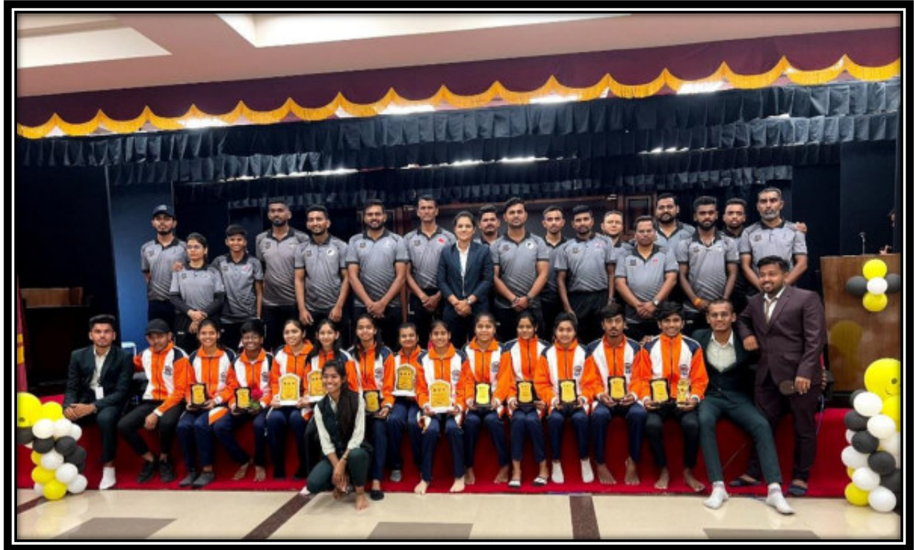
Winner Students in Annual Prize Distribution with Coaches.