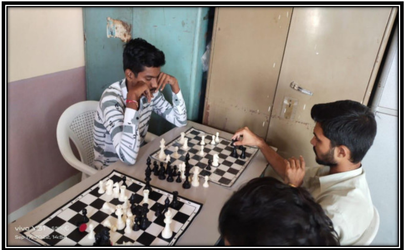
Students Participated in the Chess Workshop