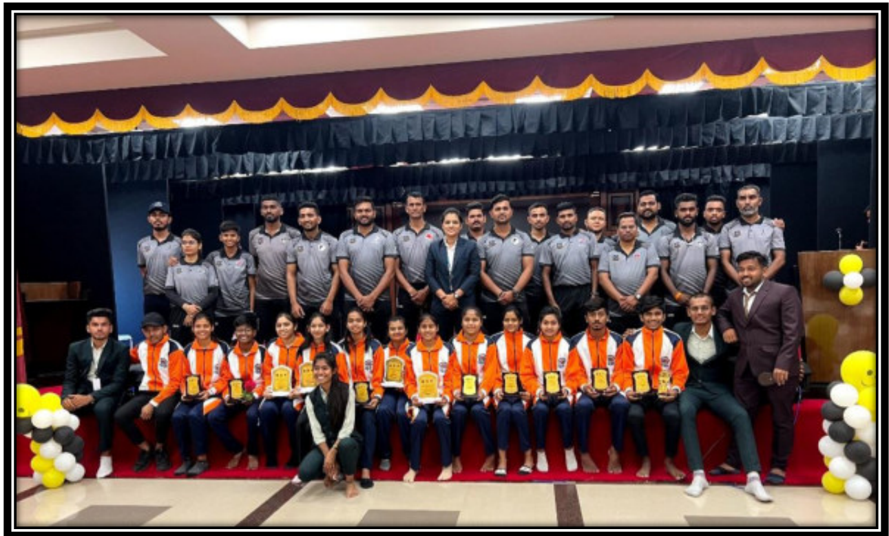
International Sports Day Celebration 2022-23: Players with Trophies