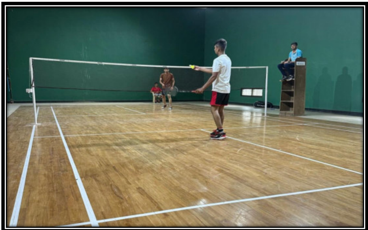
Students Participated in the Badminton Competition.