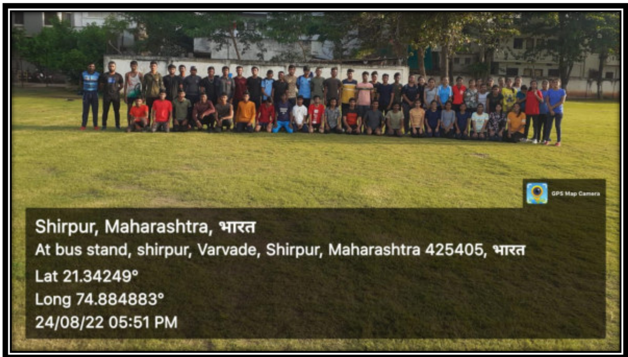
Students Participated in the Athletics Workshop