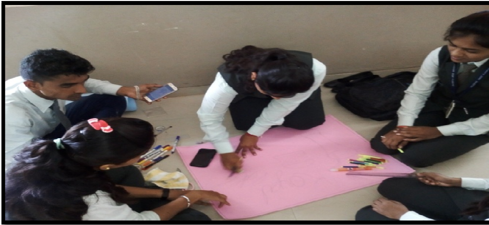
Students participated in Product Making Activity

Training and Placement cell of IMRD organized Global Business Foundation Skill program for MCA 1st year and UG students as on 15th Sept to 17th Sept 2016 and 26th Sept to 27th Sept 2016. This training program was completely activity based and via different activities like Star Activity, Product making and marketing, Tower Building, Essay Writing, Email Writing, Chinese Whisper, Parts of speech students were mentored to develop their communication skills as well problem solving ability.