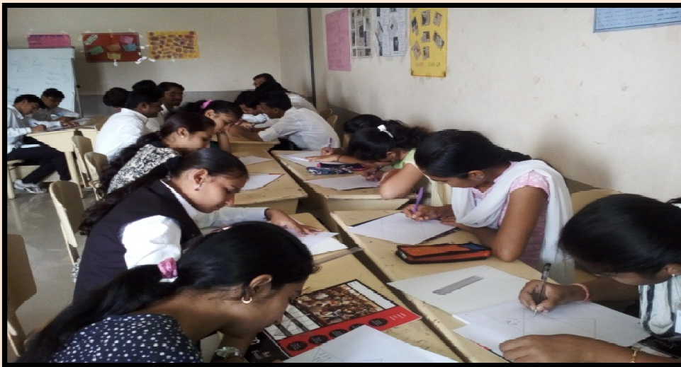
Students making their own Stars