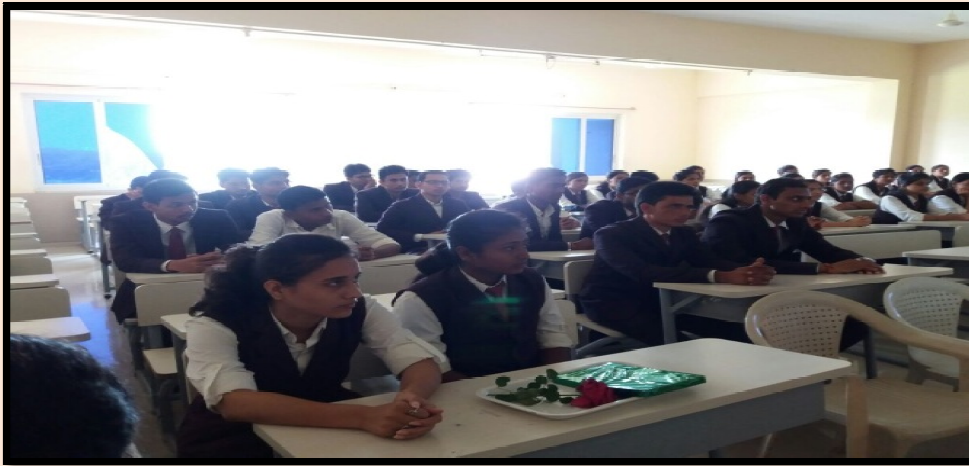
Students participated in Campus Drive