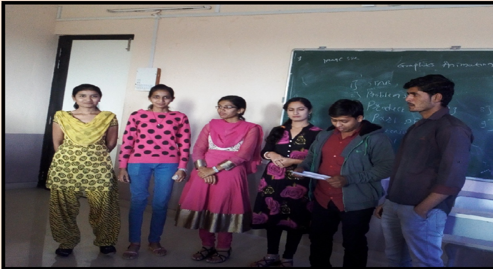
Students participated in GBFS

Training and Placement cell of IMRD organized 5 days Global Business Foundation Skill program for MBM 1 st and 2 nd year students from 22 nd Dec 2016 to 28 th Dec 2016.