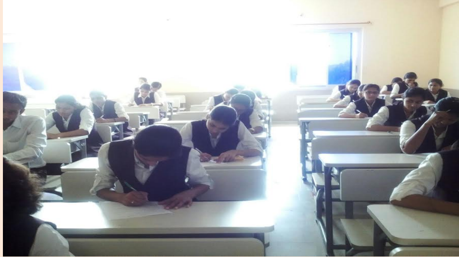
MCA 3 rd year students while giving aptitude test