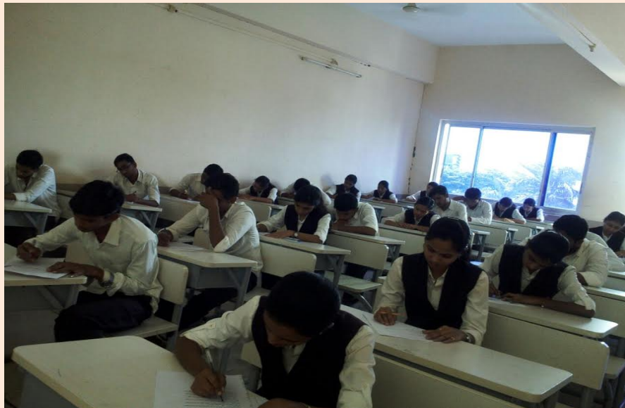
MCA 3 rd year students while giving aptitude test