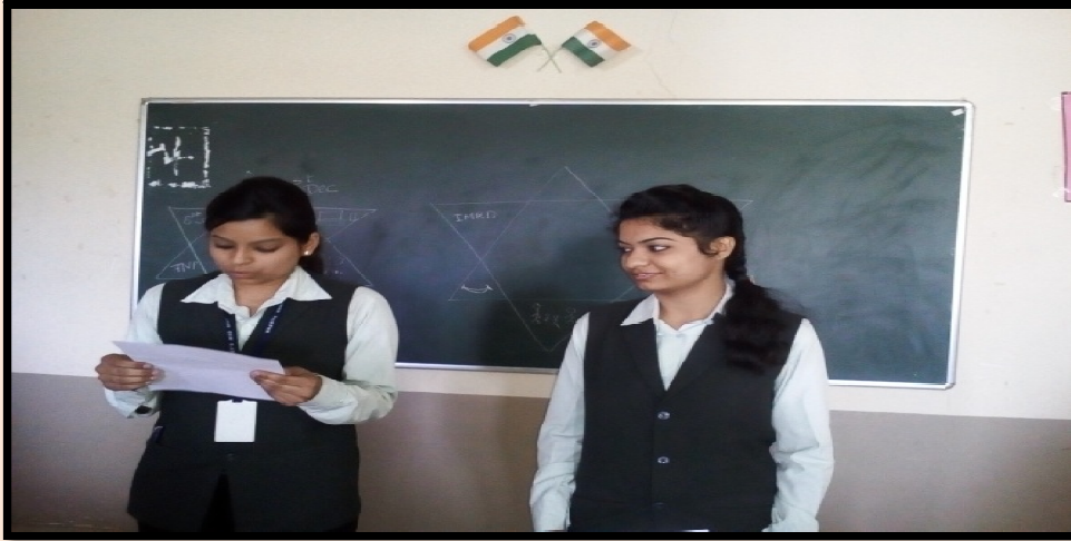
Girl Students participated in Star Activity.