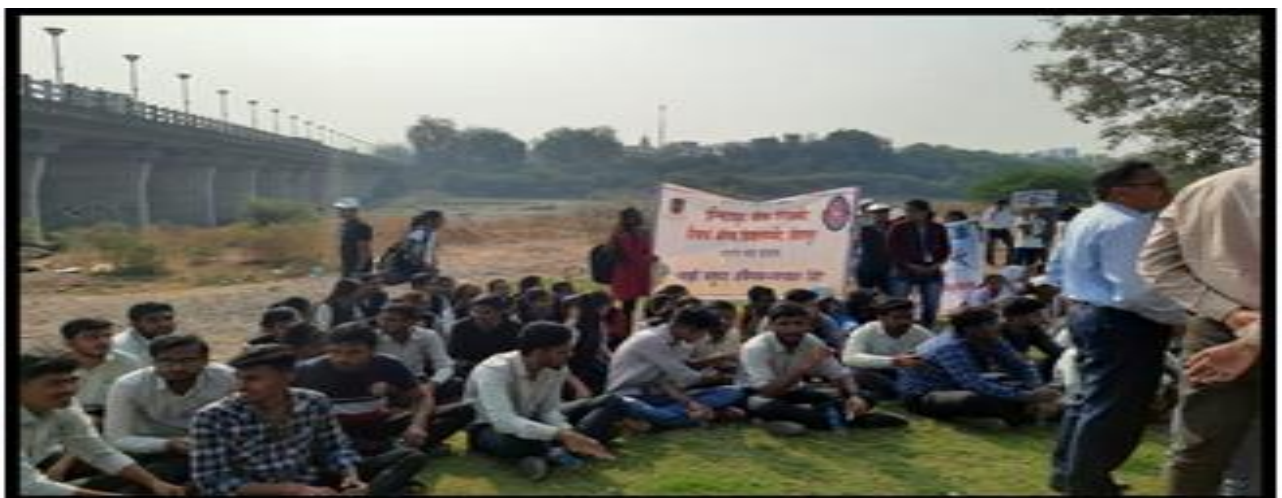
Students participated in River Cleaning under Majhi Vasundhara Mission

Officers, functionaries, employees of S.W.M.C. as well as R. C. Patel Educational Trust’s various colleges students, N. S. S. Students, office bearers of various organizations, former corporates, and numerous students held banners in their hands and made various announcements about cleanliness.