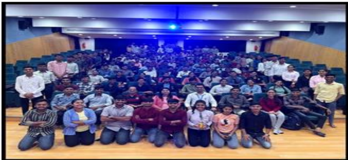
Students participated in Training program