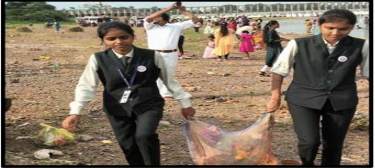
Students collecting nirmalya sankalan from Arunavati River

Event Name : - Plog-Run” Clean Survey 2023 under Majhi Vasundhara Mission