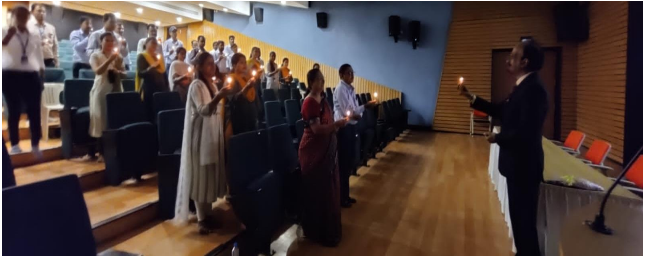
Inaugural activity in the FDP

Event Name : - Three(3) Days Aptitude Training Programme for IMCA Students