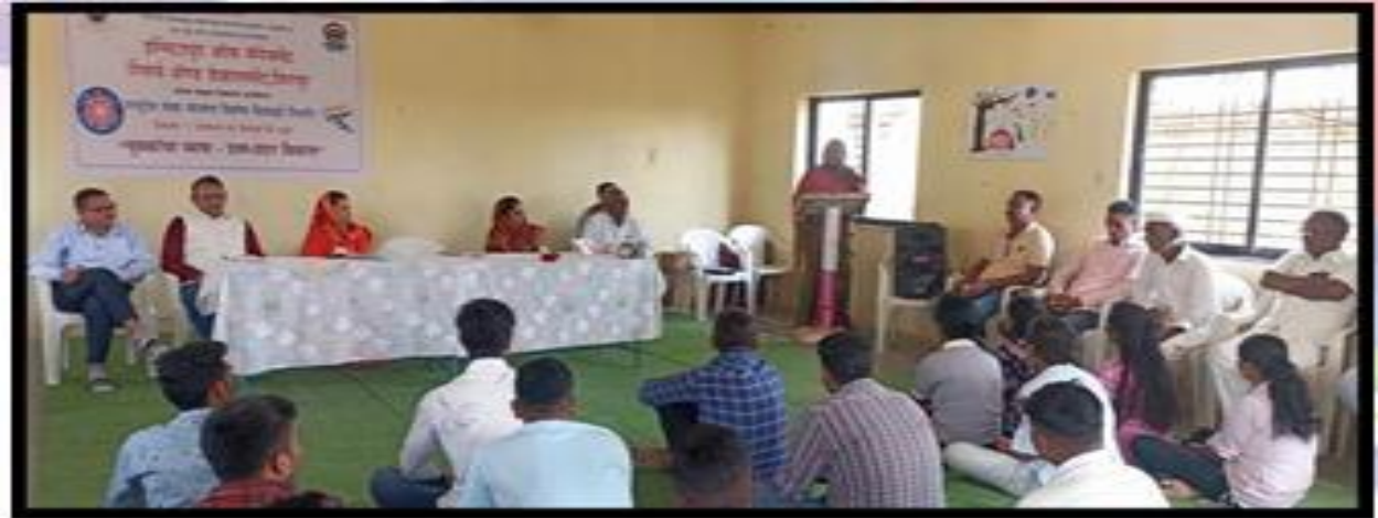
NSS Special Winter Camp-2022-23 Inauguration

Event Name : - Eyes and dental health checking camp