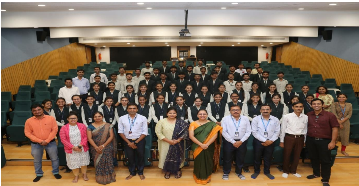
Students selected for FUEL technical training with Hon Director and faculties