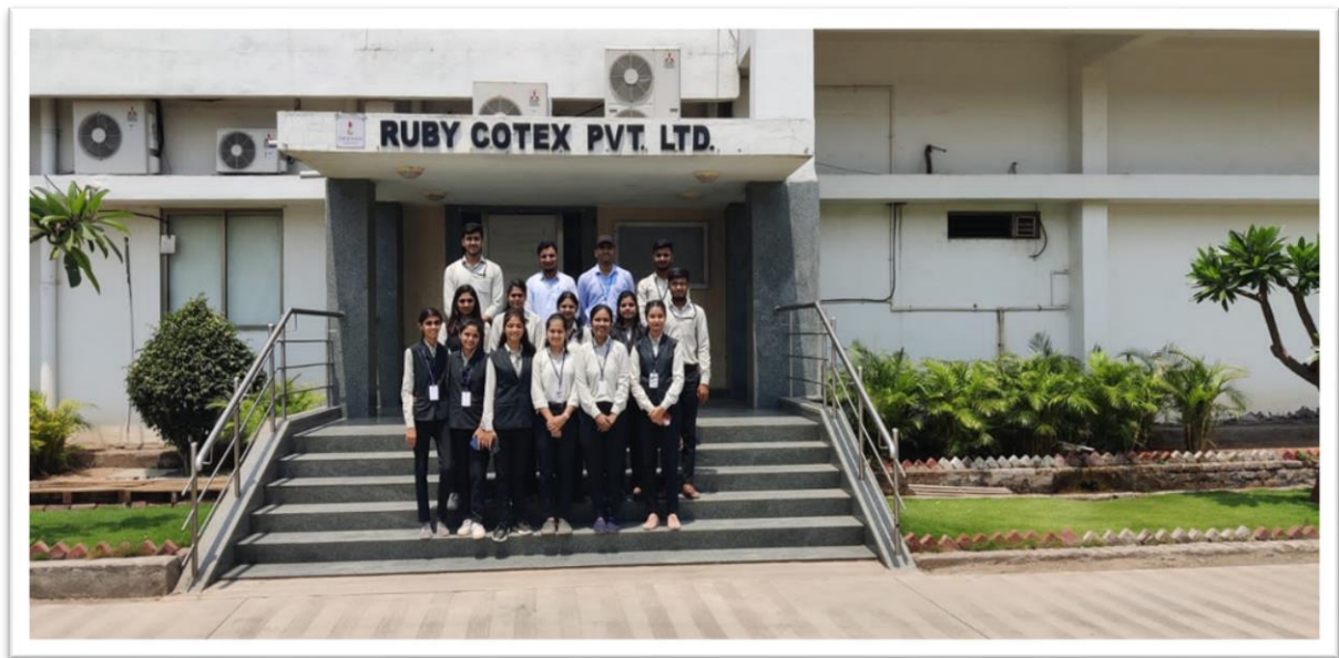
Students with Faculties at Ruby Cotex Pvt. Ltd Shirpur