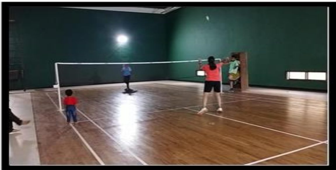
Girls Final Match