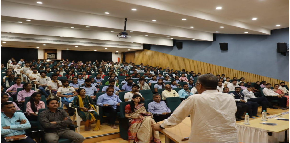
Hon. Rajgopal Bhandari sir addressing audience