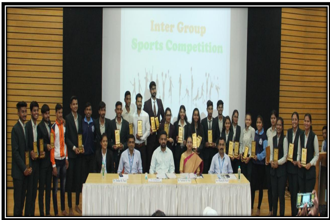
All Inter Group Participant players