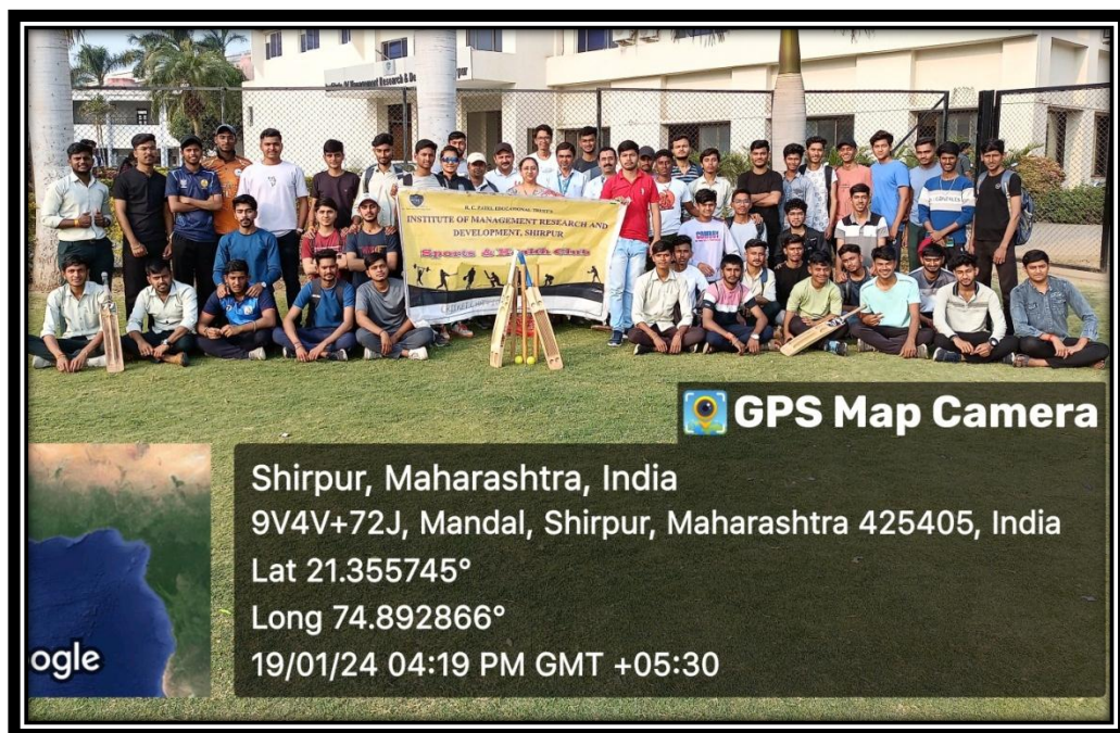
All the participants.