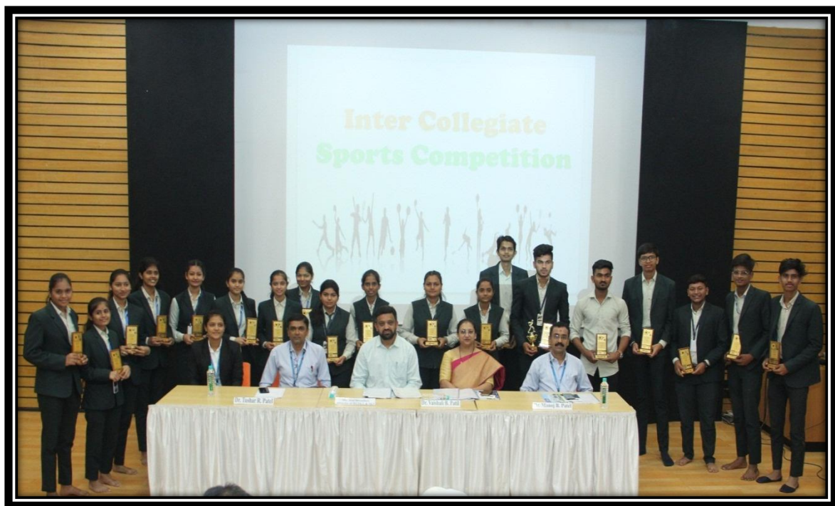
All Inter Collegiate Winners & Runner up players