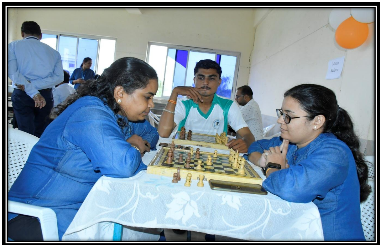
Staff Participated in the Chess Competition