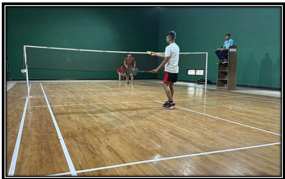
Students Participated in the Badminton Competition.