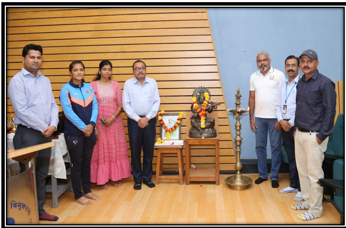
Lightning of lamp done by Chief Guest.