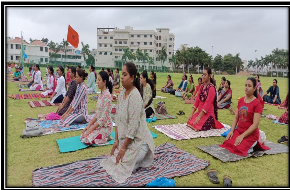
Staff members doing Asana during the session