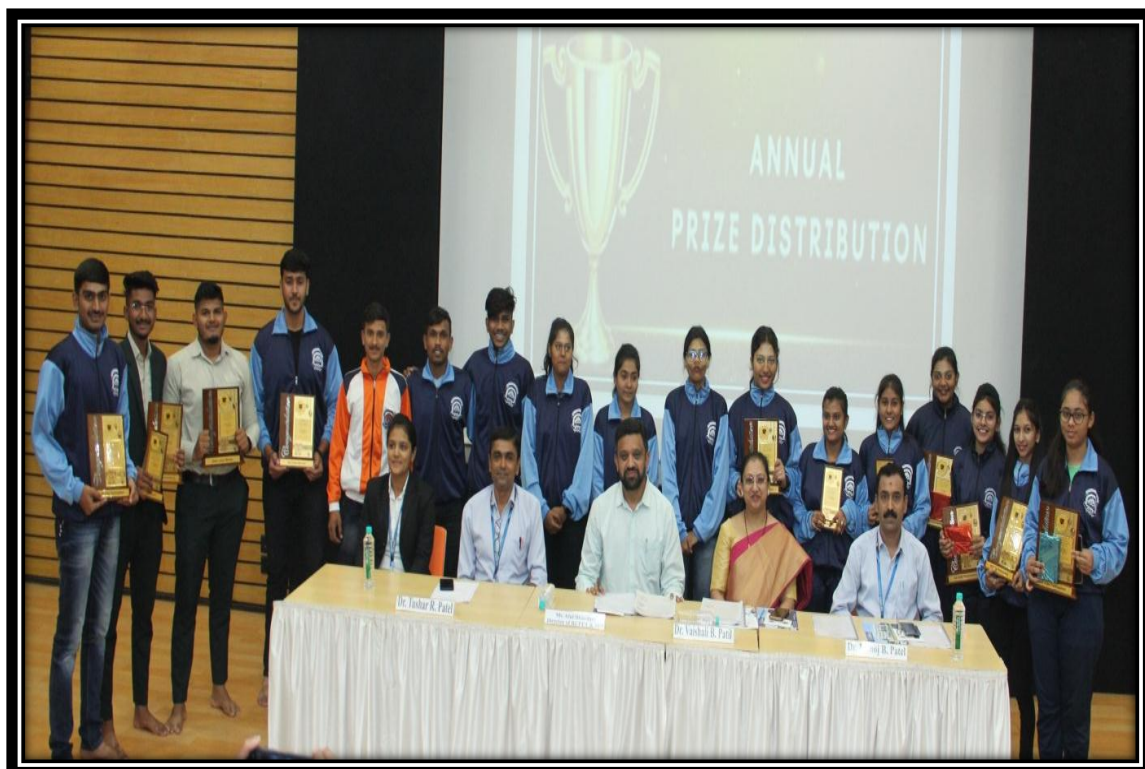
All India Inter University / State/ National Level Participant players