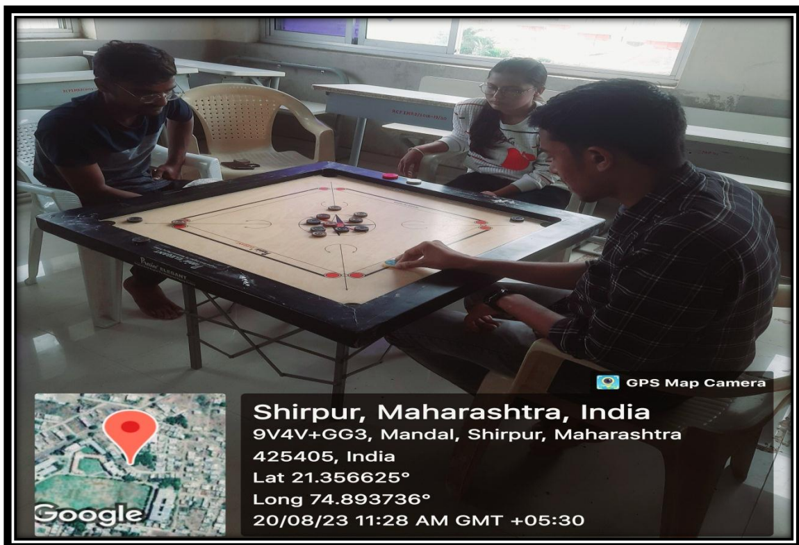
Students participated in the Carrom Competition