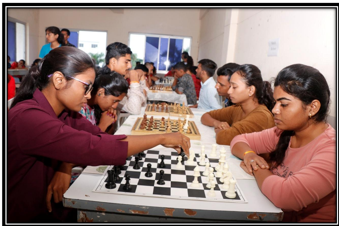
Students Participated in the Chess Competition