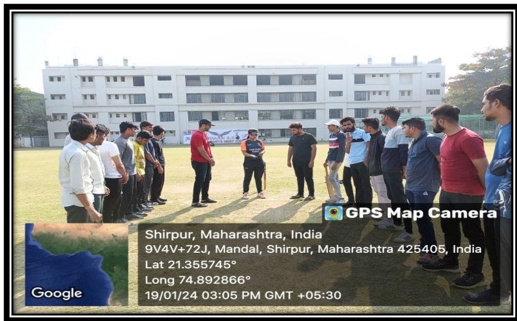
Toss between SYBCA (A) Team vs TYBBA (B) Team