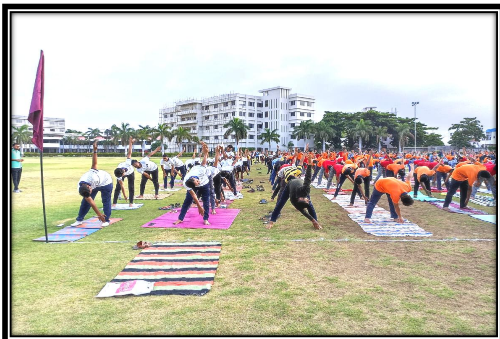
Students and NSS Volunteers performing Yoga