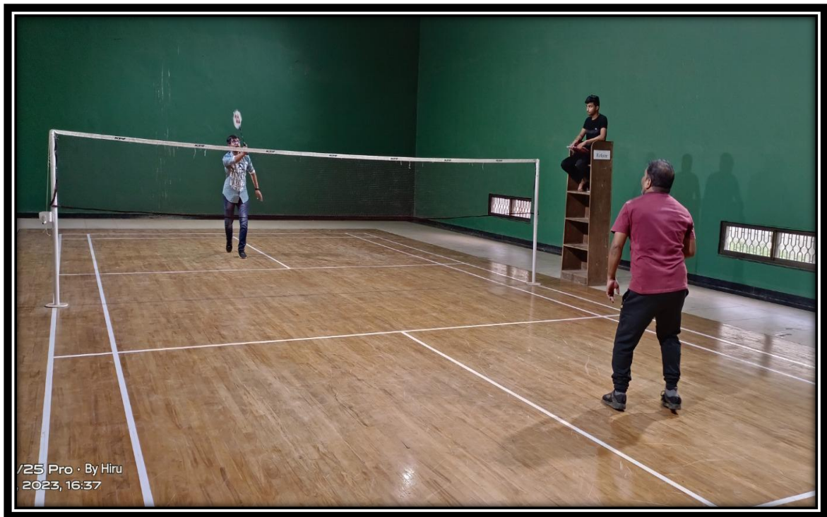
Staff Participated in the Badminton Competition