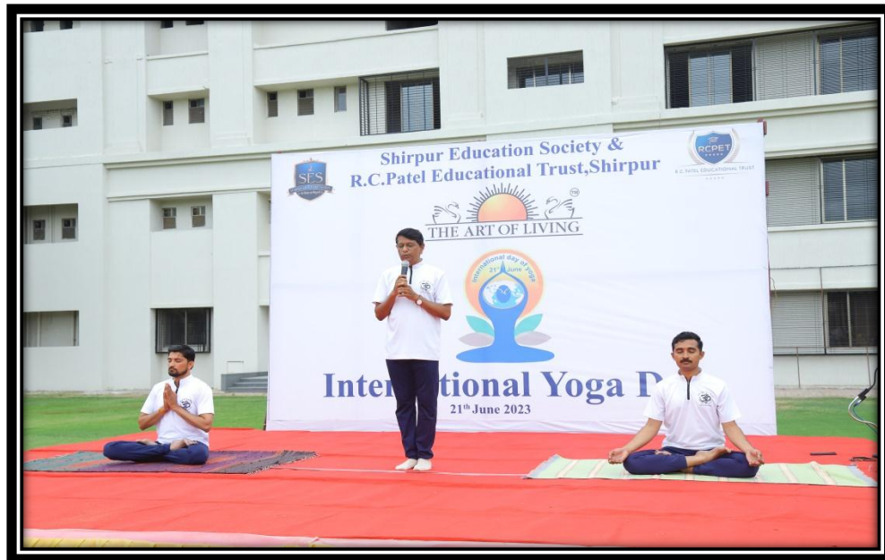
Demonstration of various Yoga postures by Yoga Trainer