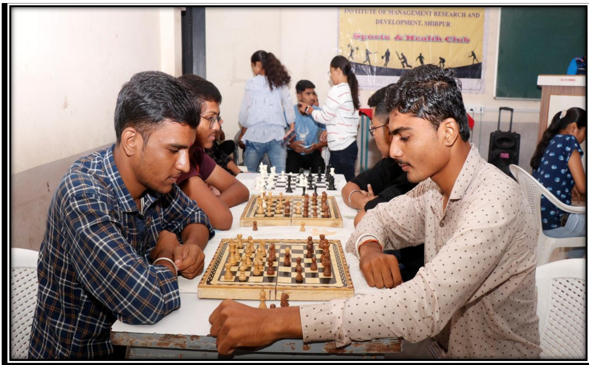
Students Participated in the Chess Competition