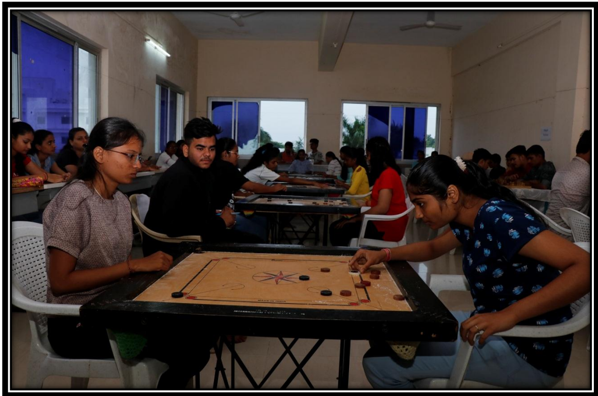
Students participated in the Carrom Competition