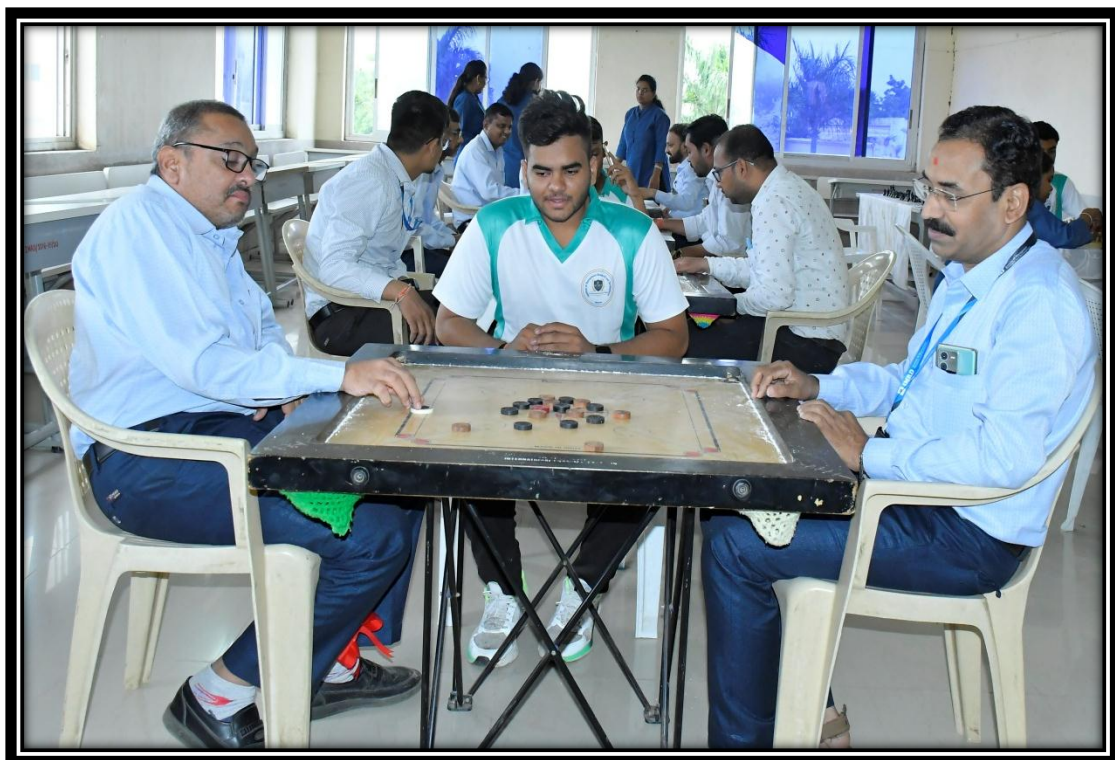
Staff participated in the Carrom Competition