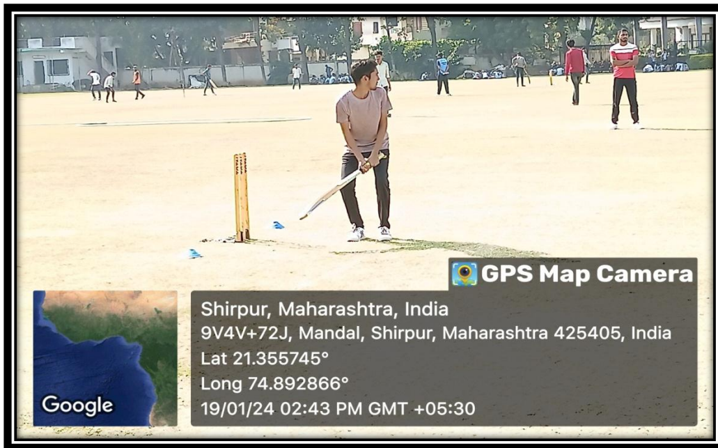
Students participated in 'Fun Cricket'