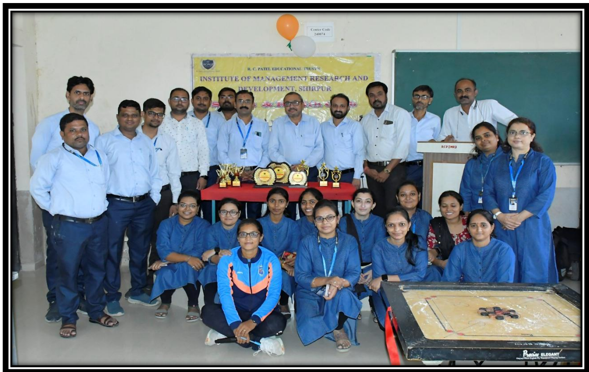
All Staff Participants