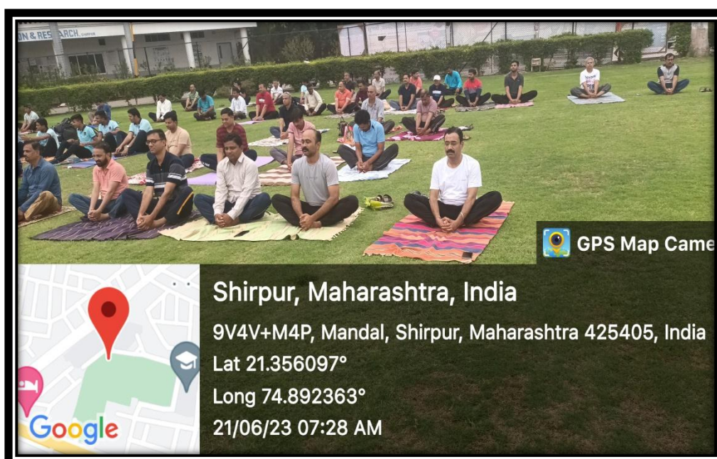
Staff members doing Asana during the session