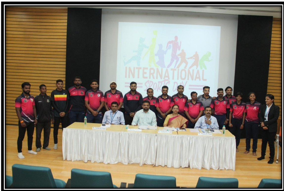
All the coaches