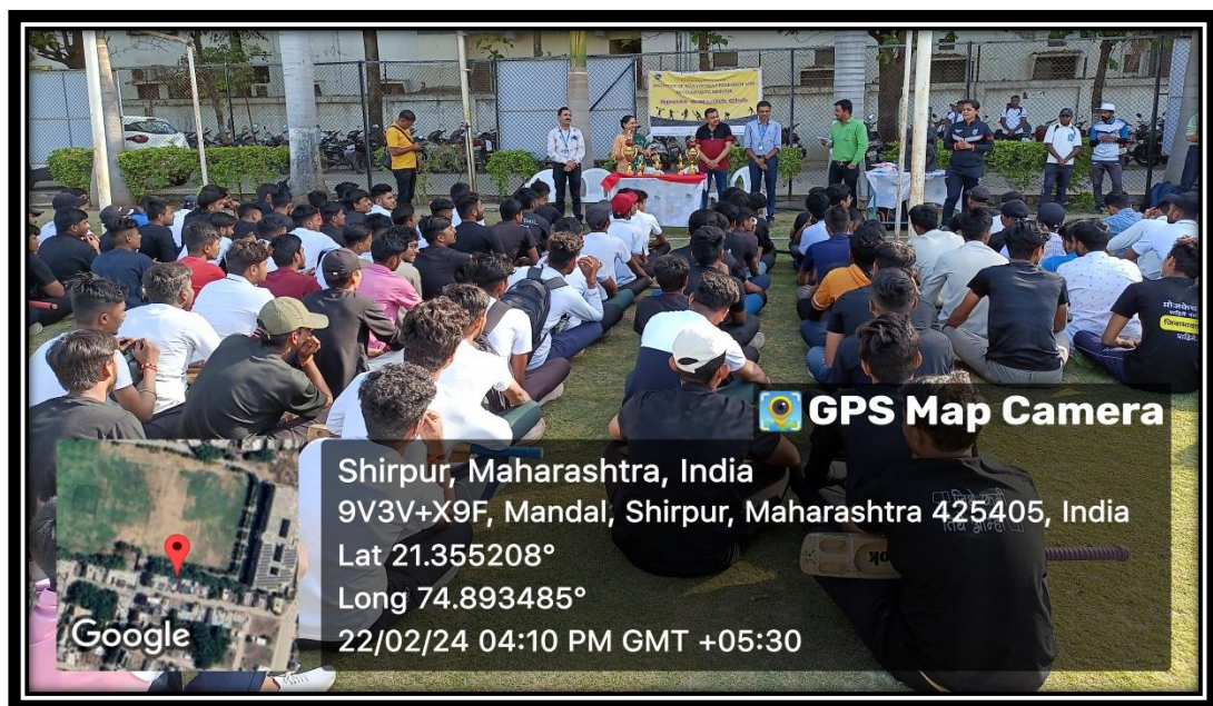
All the participants