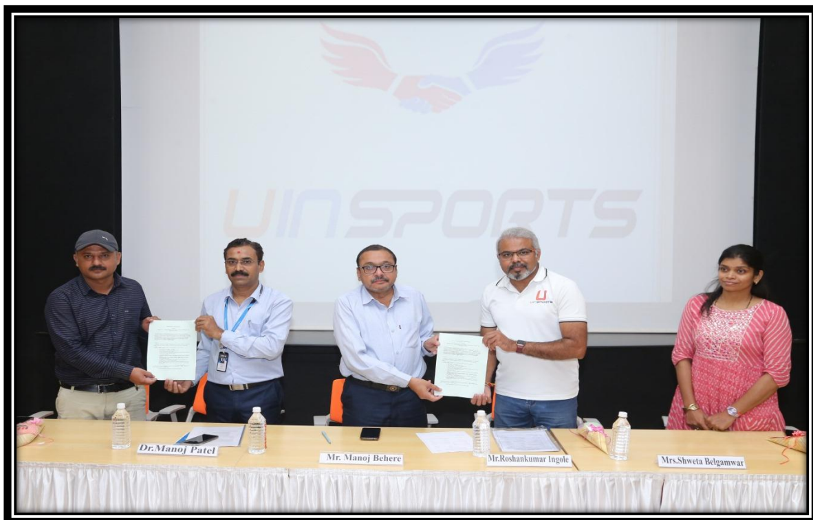
MOU Signing between IMRD and Uin Sports.