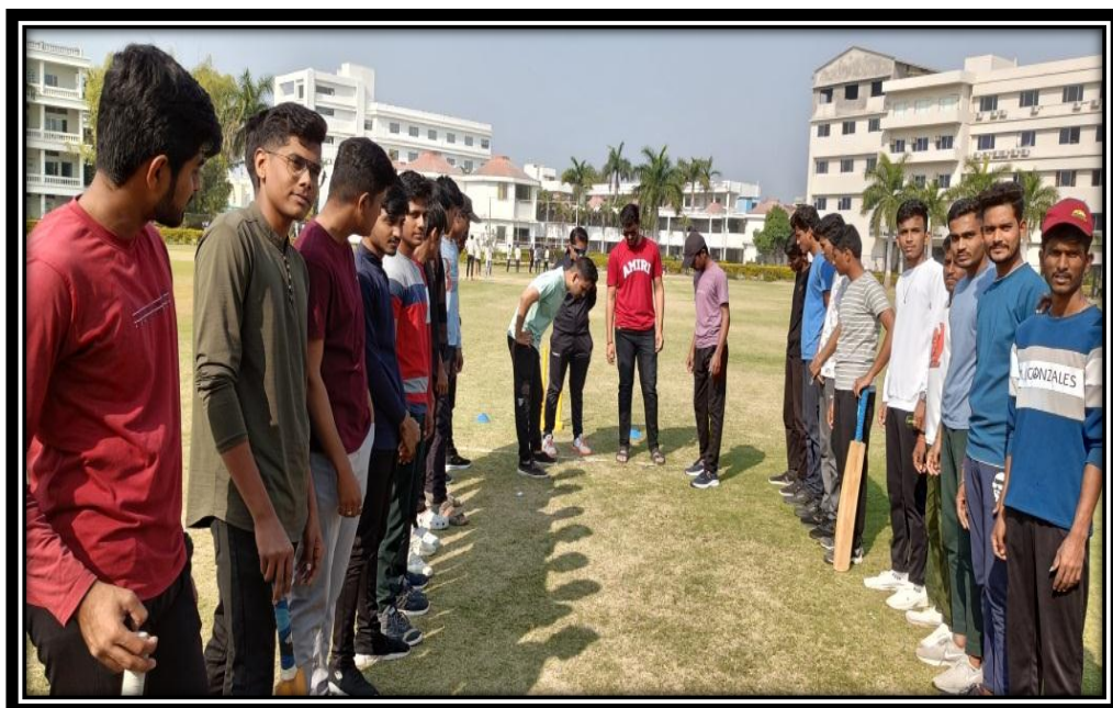
Toss between Int.-MCA II Team vs FYBMS Team