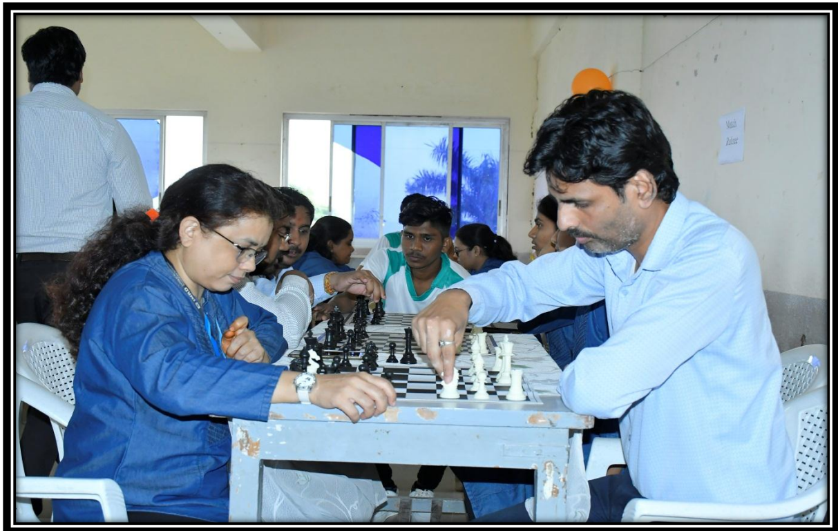
Staff Participated in the Chess Competition