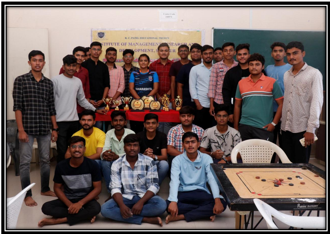
All Students Participants