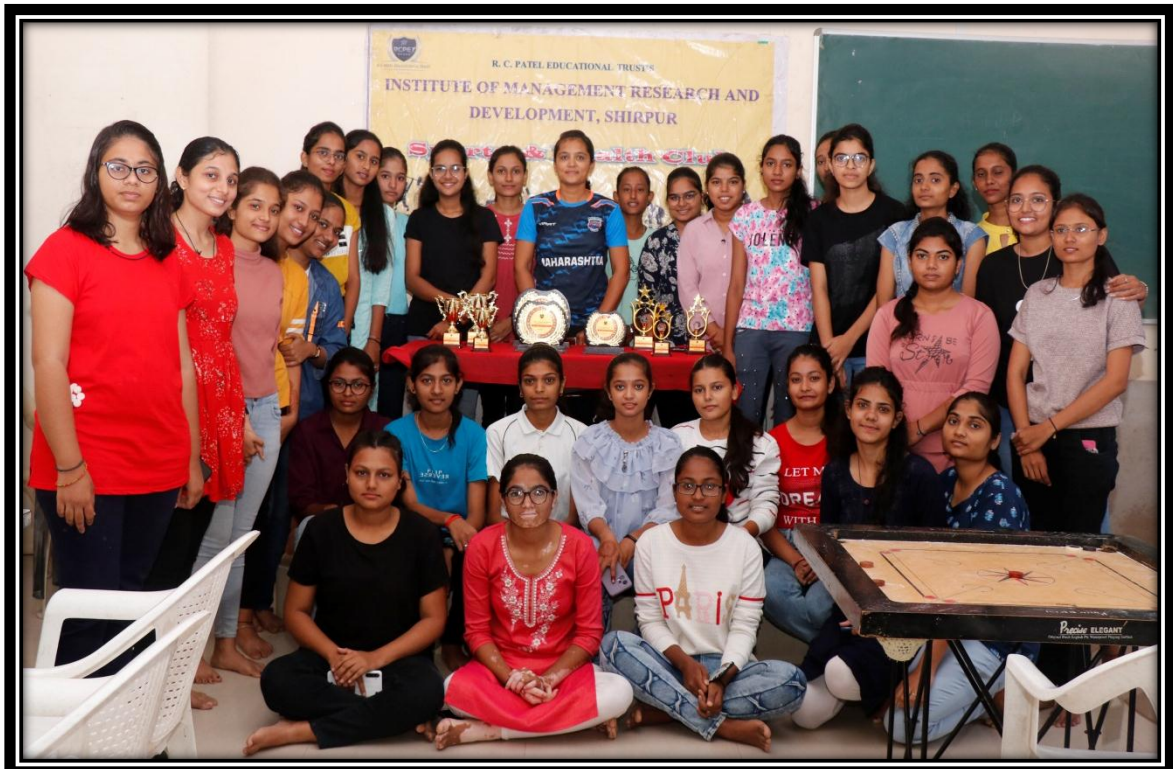
All Student Participants