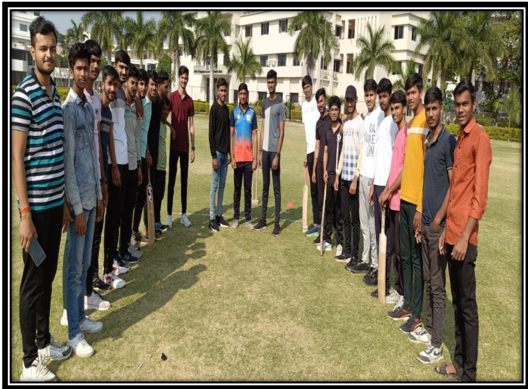
Match between FYBBA (B) Team vs FYBCA (B) team