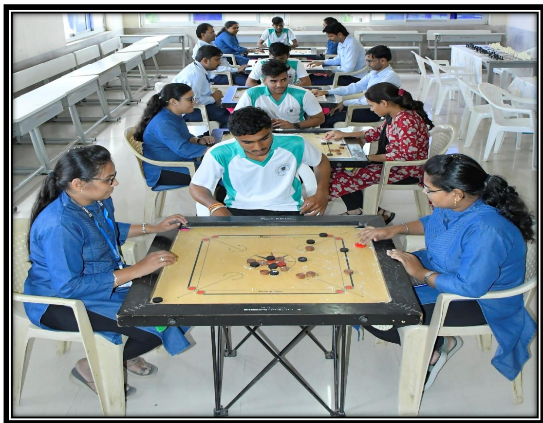
Staff participated in the Carrom Competition