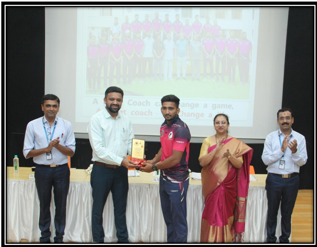
Coaches felicitation by the hands of chief guest