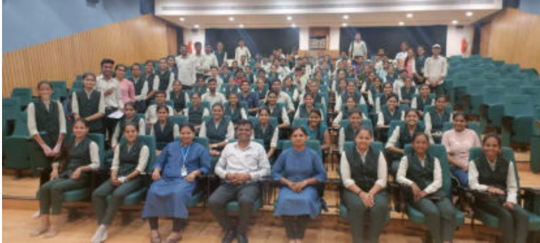
Students of TYBCA participated in Campus credential Training