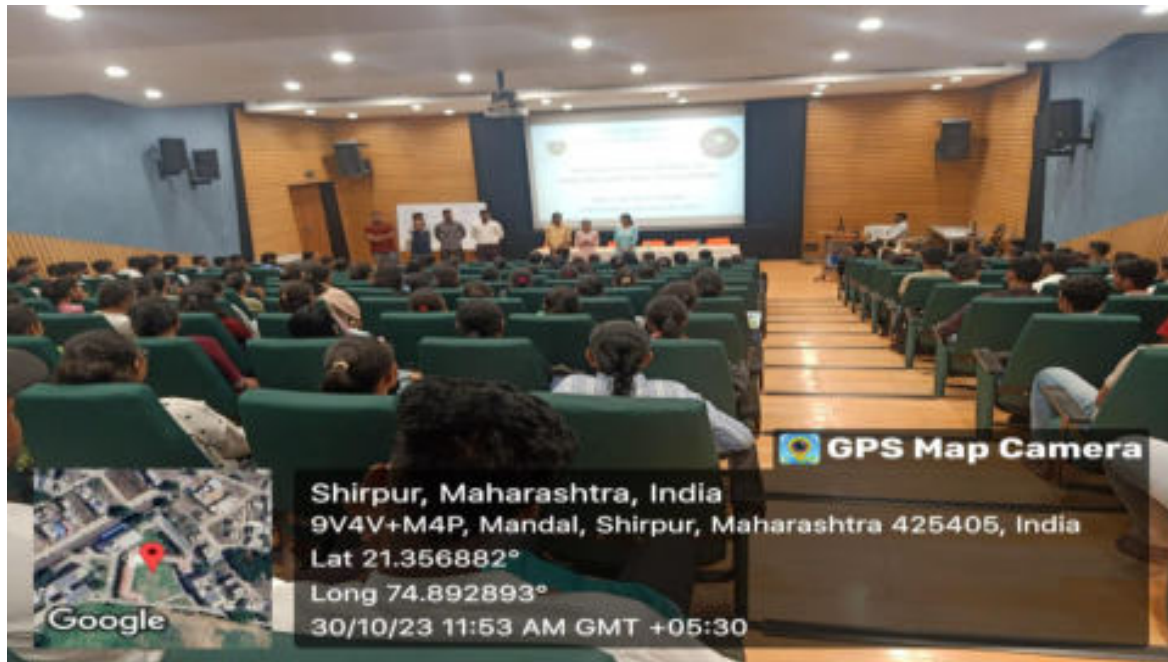
Students participated in event