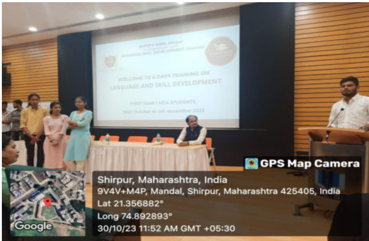
Student's interaction Activity