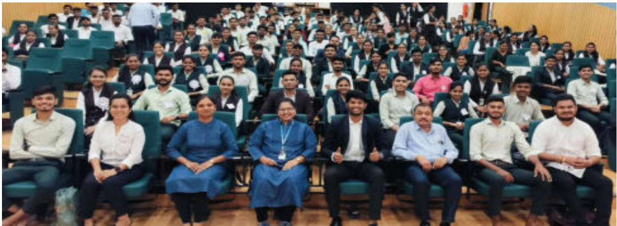
IMCA Students participated in Training