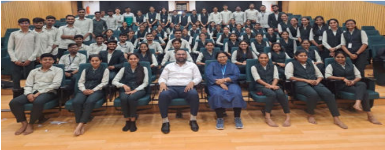
Final Year BCA Students participated in Training