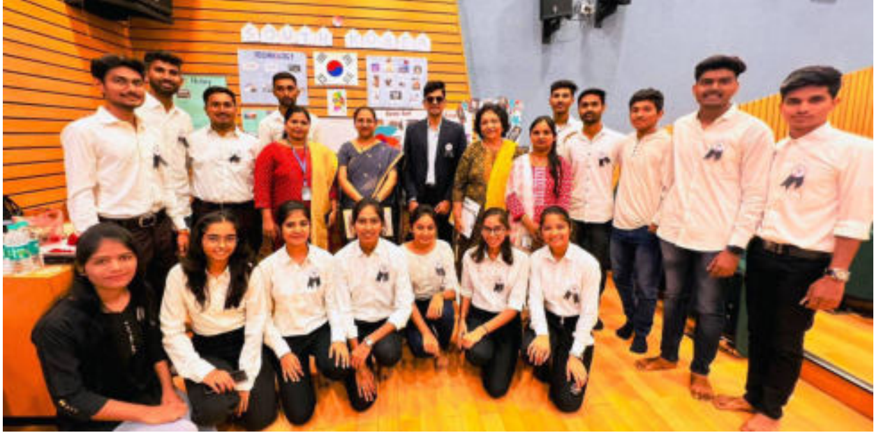
Faculties and judges with South Korea group