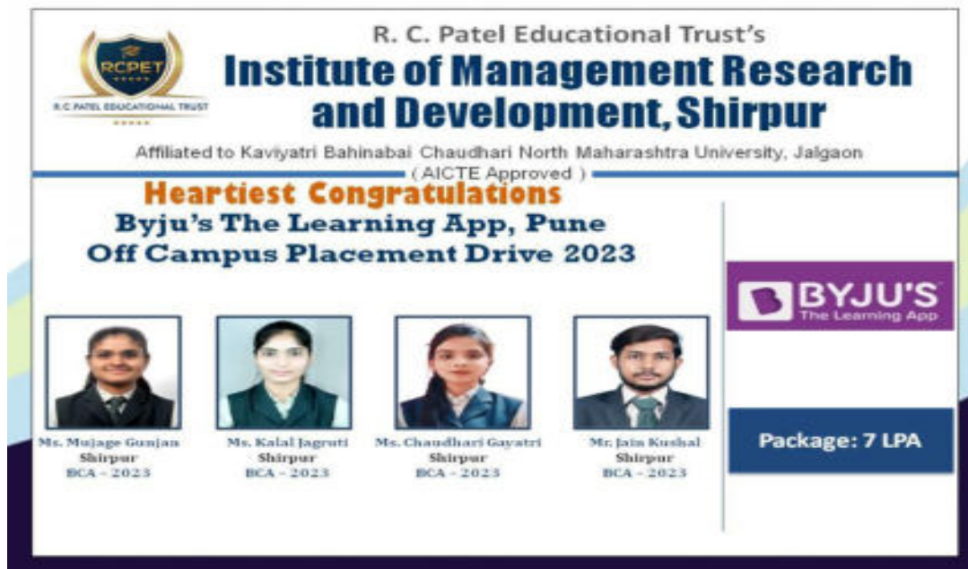
Students from BCA selected in Byjus, Pune