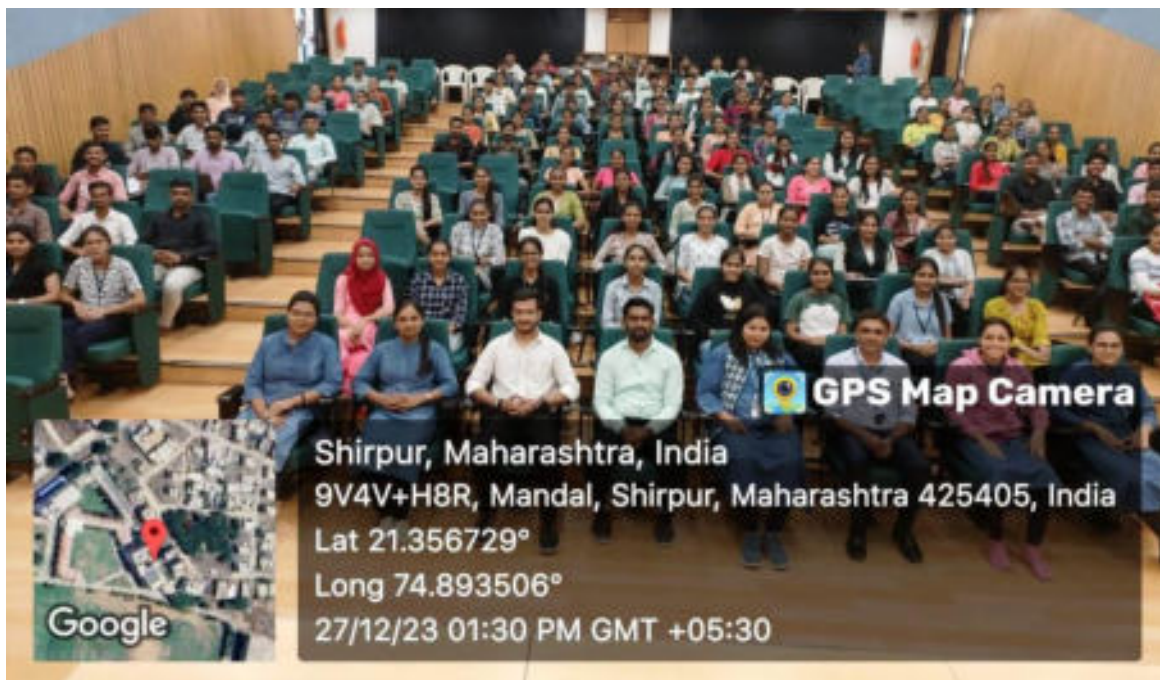
Students of SYBCA participated in AI with Python Training