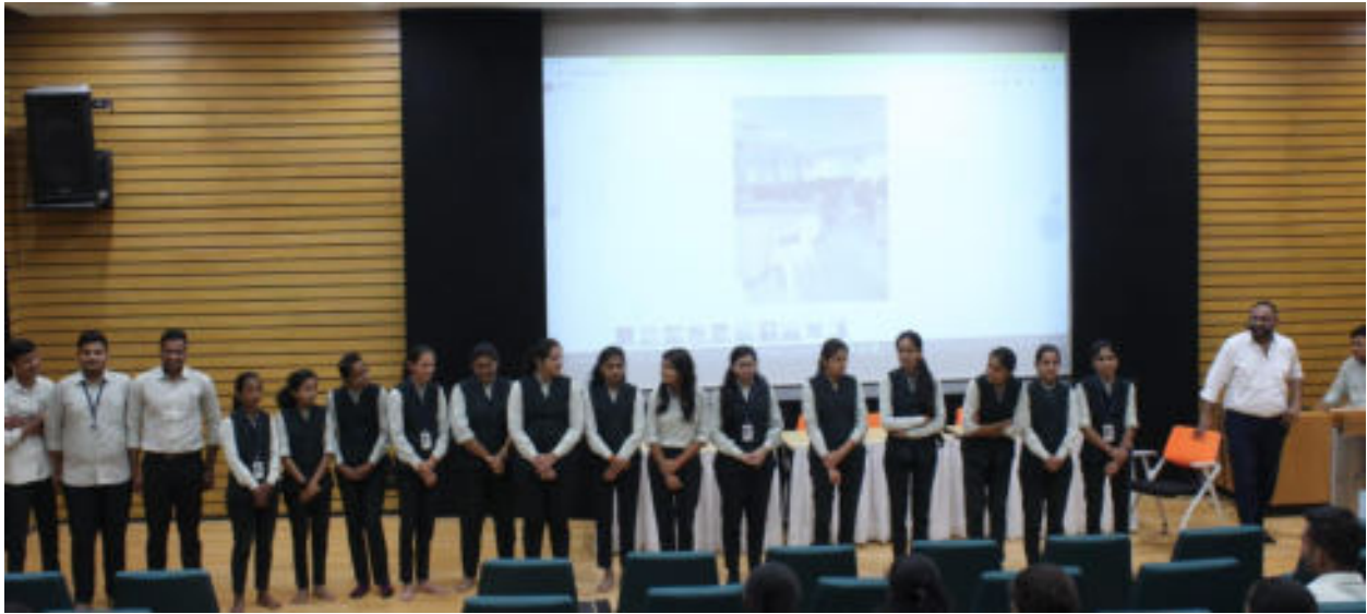
Students participation in Activity.