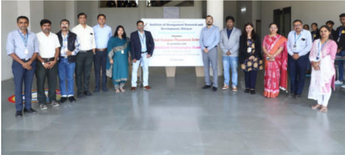
Team Qualitykiosk Technologies, Mumbai visited for Pool Campus Placement Drive.