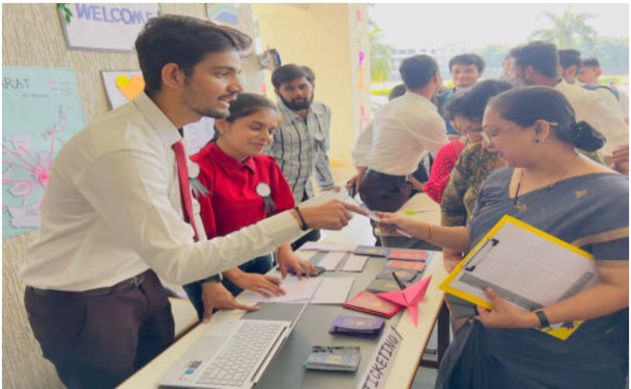
Airline booking counter by Students