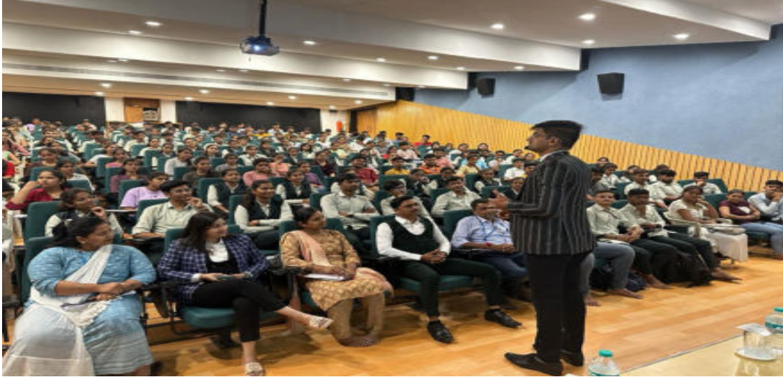
All participants in the Currency trading Session by RTE.