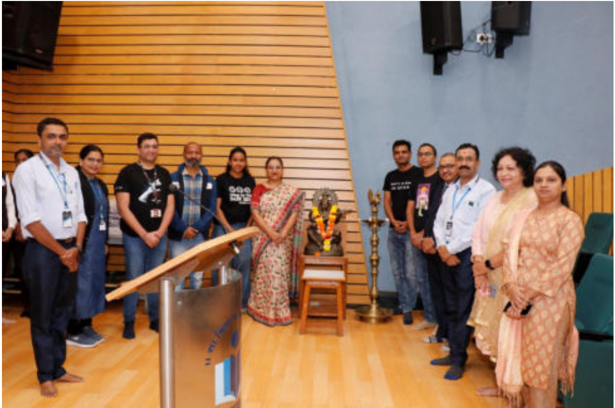
Inauguration of Placement drive by dignitaries.