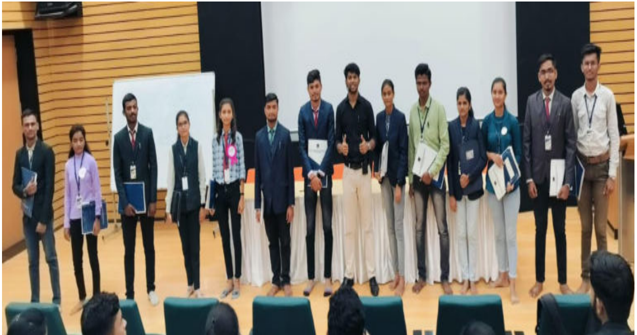
Session on Grooming