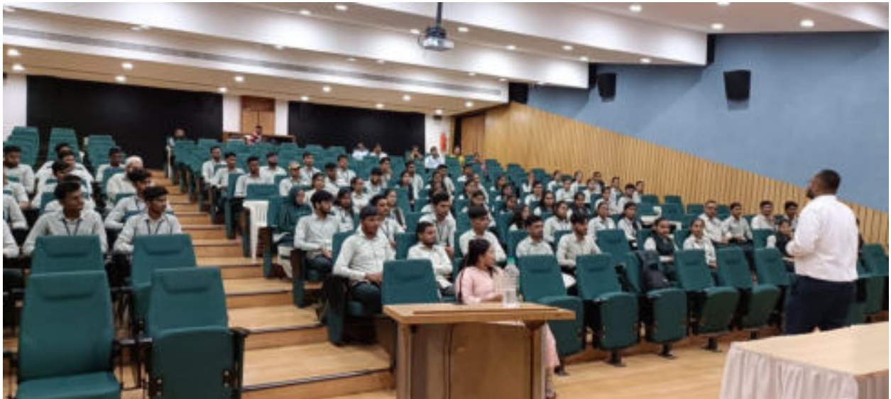
Final Year BBA and BMS Students participated in Training