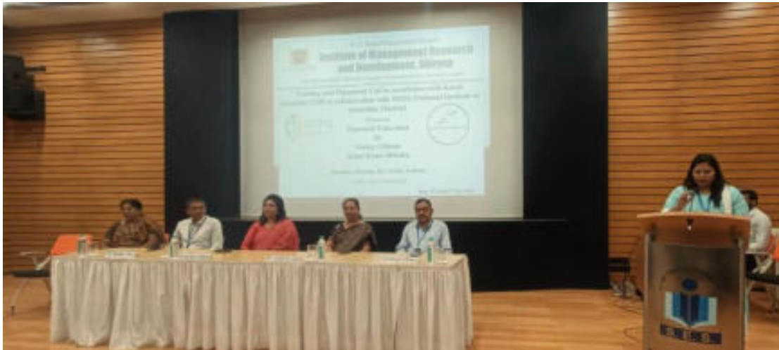
Inauguration of the Workshop on Financial Education for Young Citizens Kona Kona Shiksha