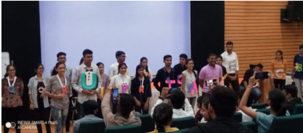
Students playing Vocabulary game