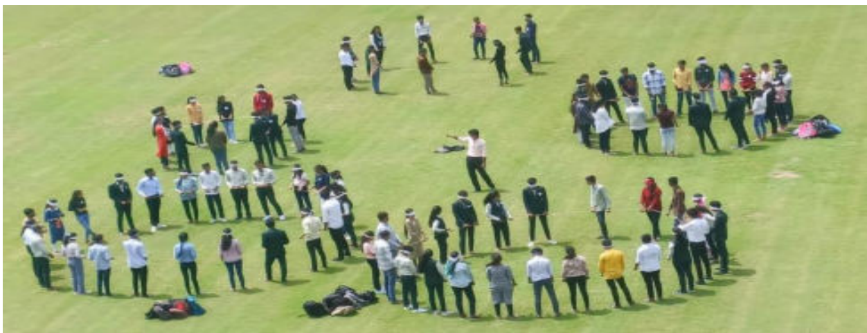
Activity in the ground