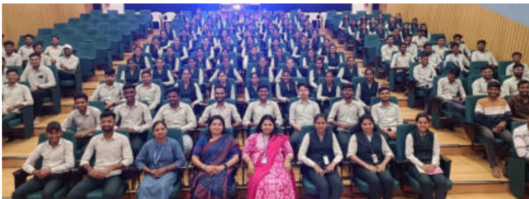
Students participated in the Workshop.