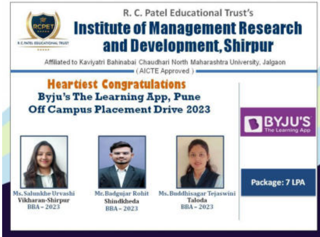
Students from BBA selected in Byjus, Pune.