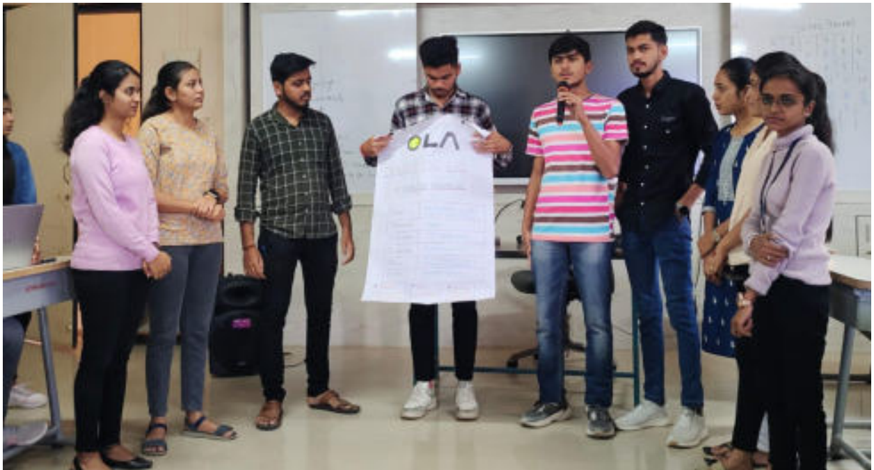
Students Participated in Activity during the Training