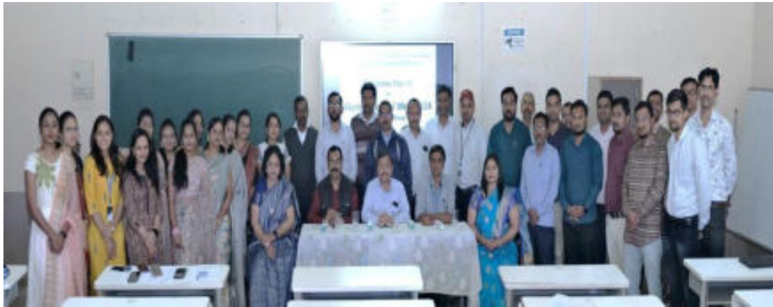
Alumni General Meet 2024