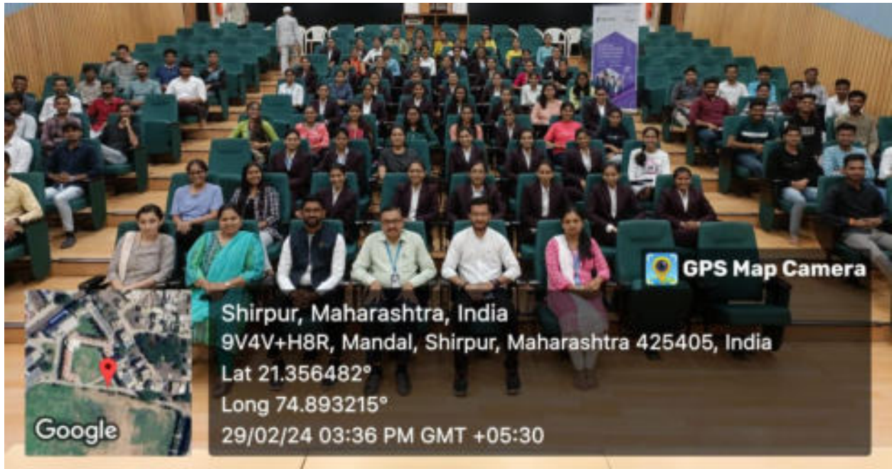
All participants of the AI with Python training