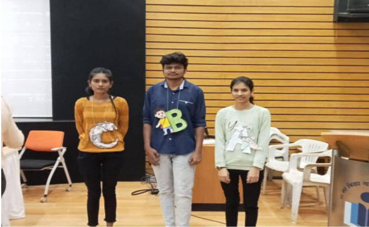
Active participant in event by students