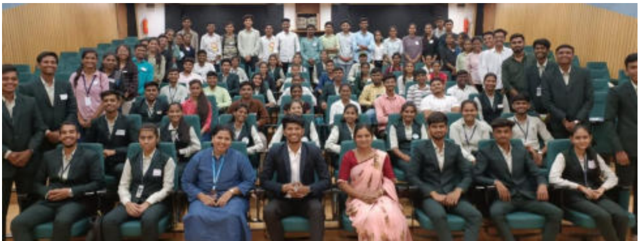
First and Second year BMS Students participated in Training