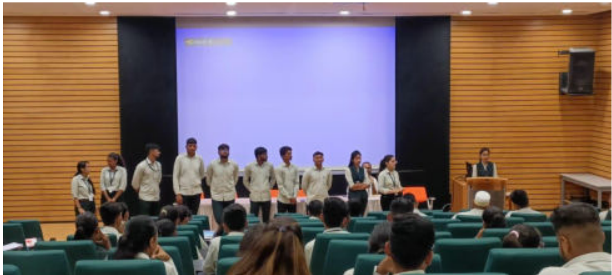
Rubicon Training session