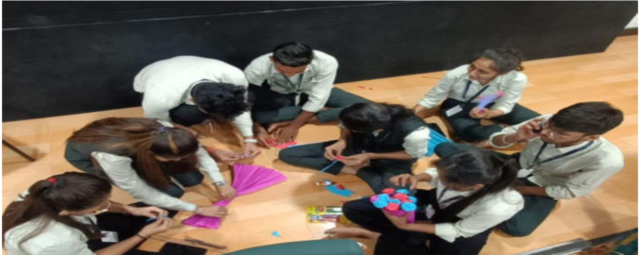
Students Activities in Training