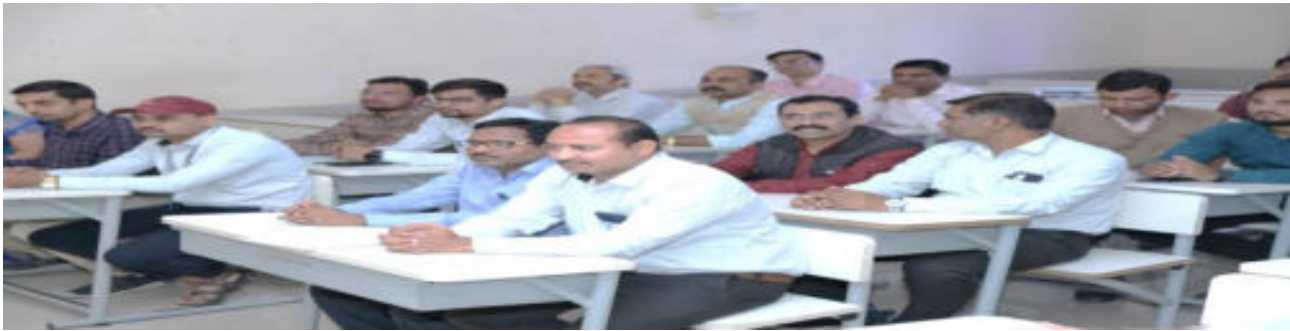
Alumni Gathered for General Meet