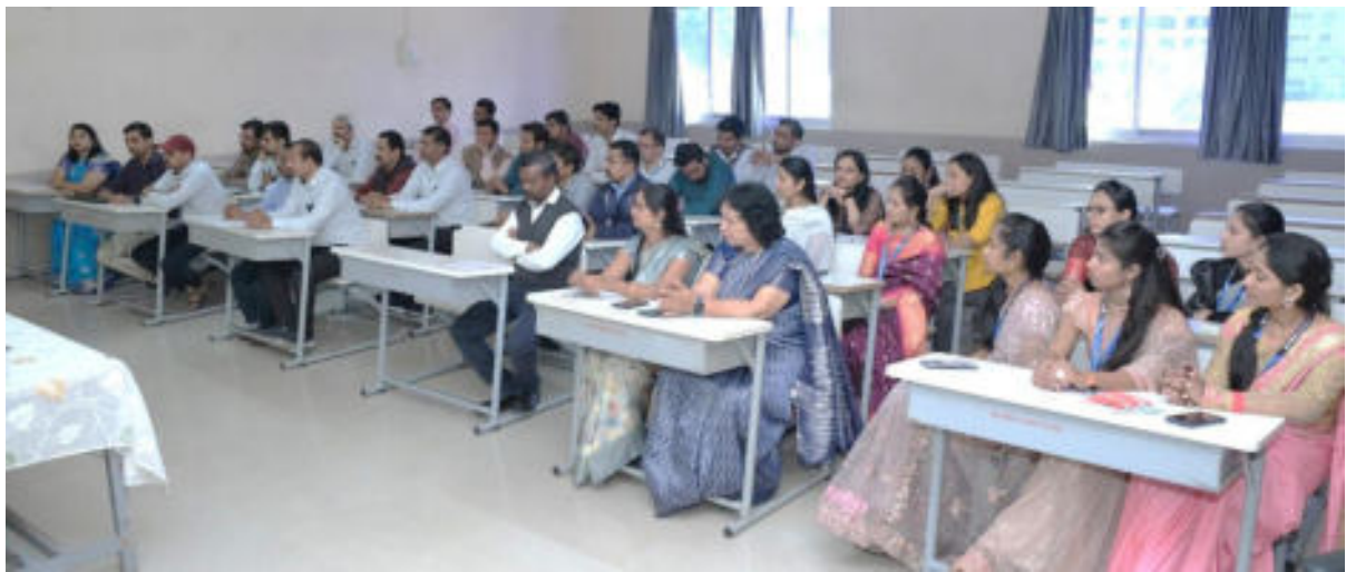
All Alumni Present for meeting