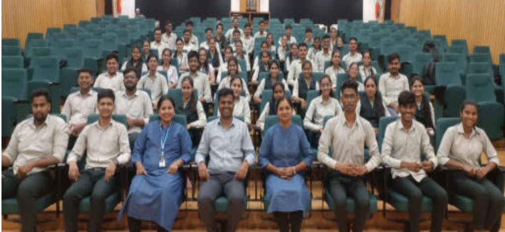
Students of TYBBA and TYBMS participated in Campus credential Training