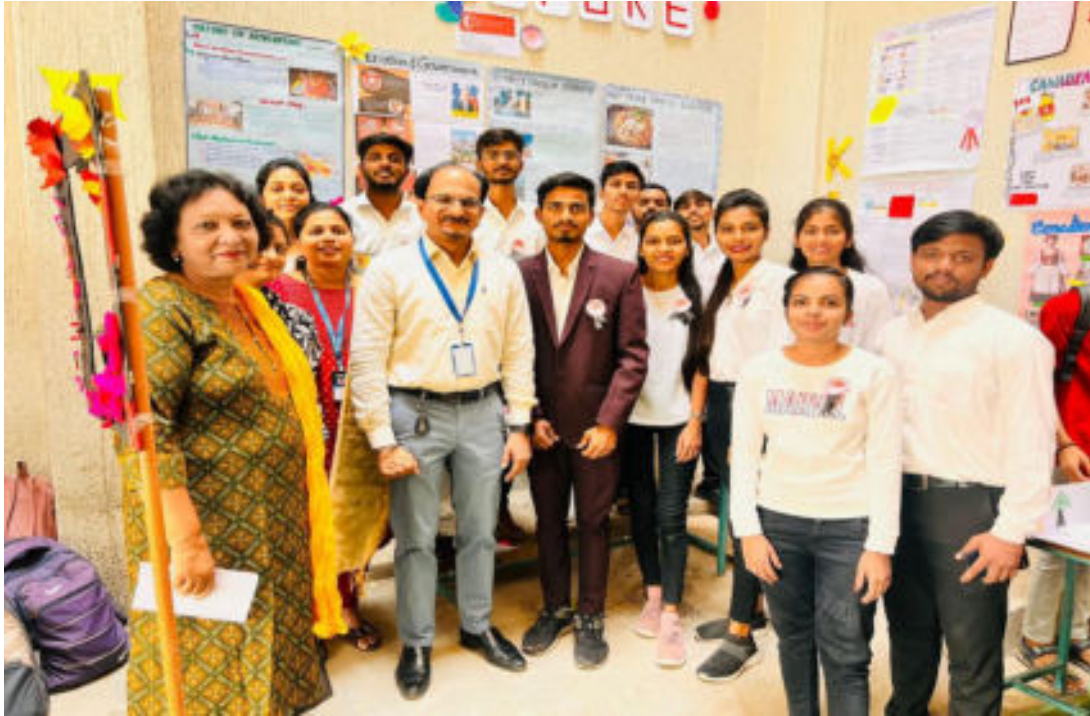
Faculties with Singapore Group