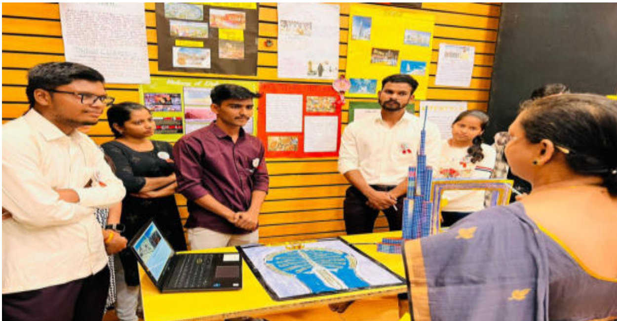
The Dubai Group successfully addressed all the questions and gave their presentation.