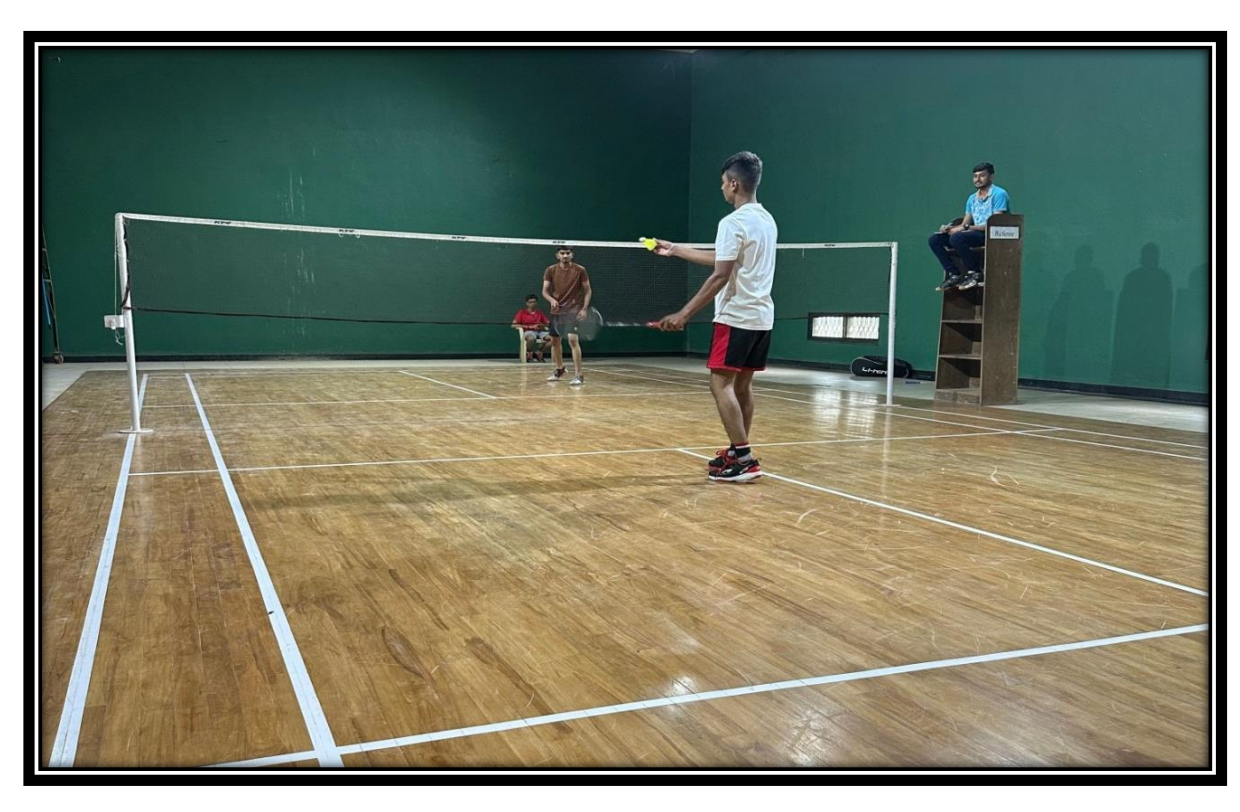
{\bf Students\ Participated\ in\ the\ Badminton Competition.}