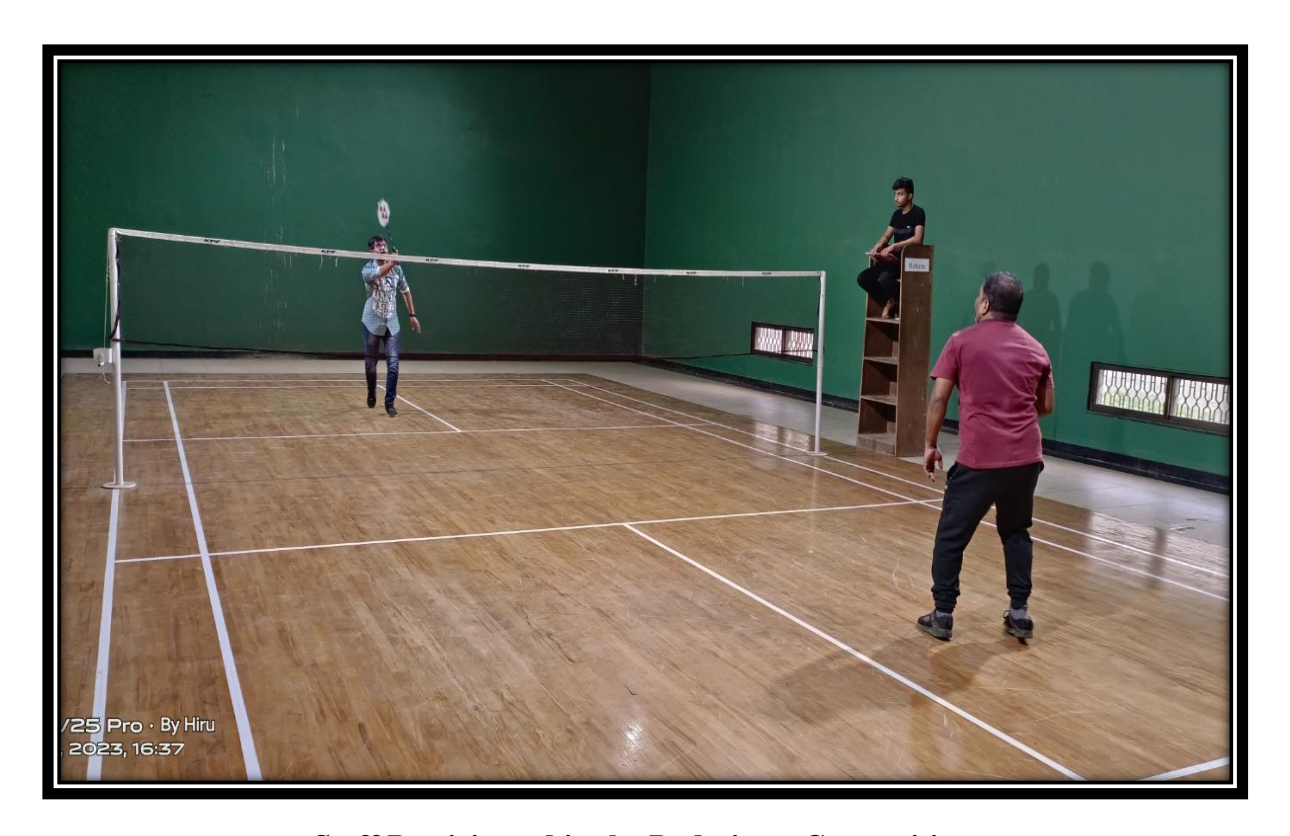
Staff Participated in the BadmintonCompetition